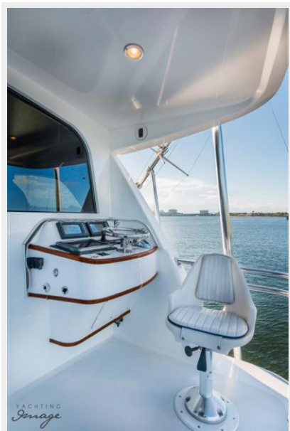
Aft Flybridge Helm