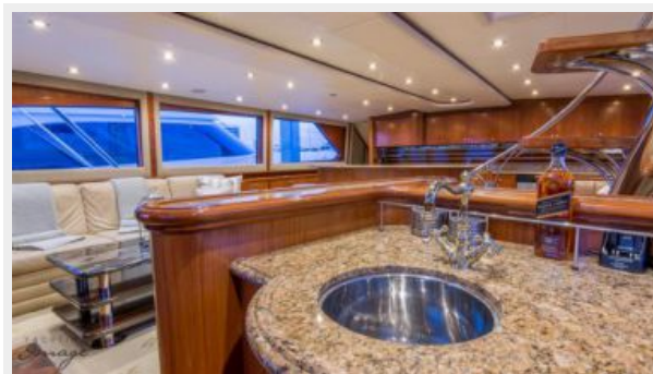
Aft Bar Area