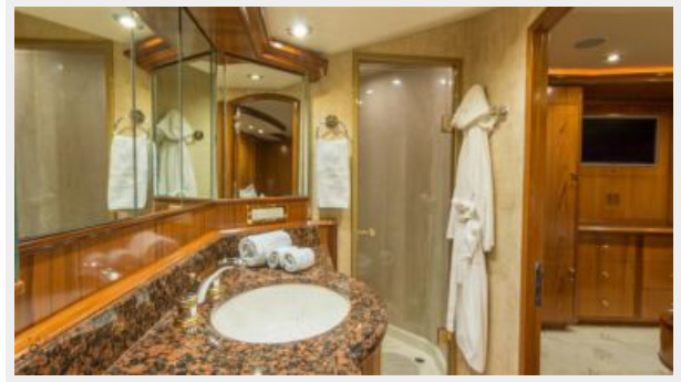
Master Stateroom Head