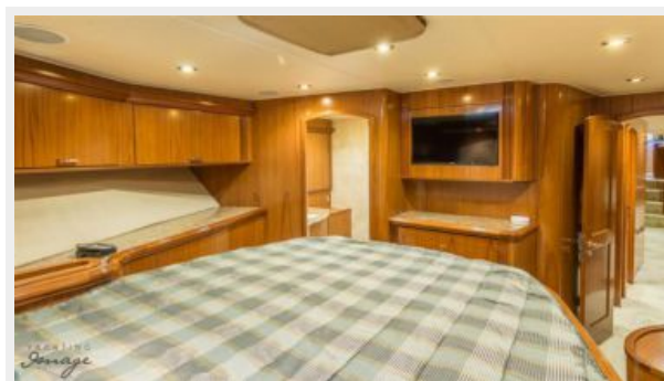
Forward VIP Stateroom