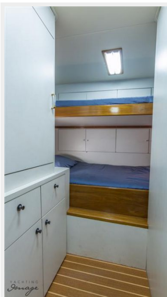
Crew Quarters Stateroom Stbd