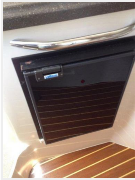
Galley 3 - Refrigerator