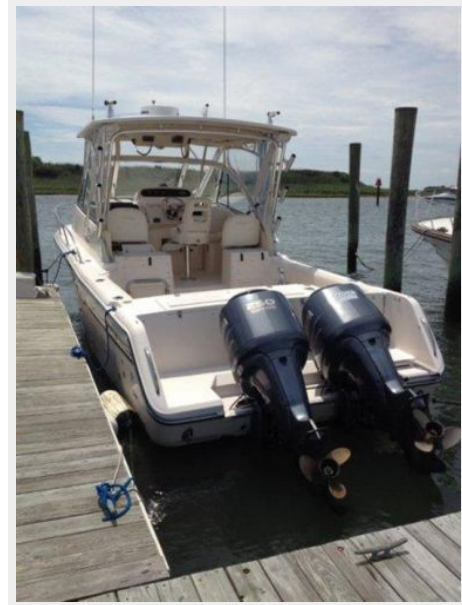
Engine & Mechanical Equipment 1 - Motors