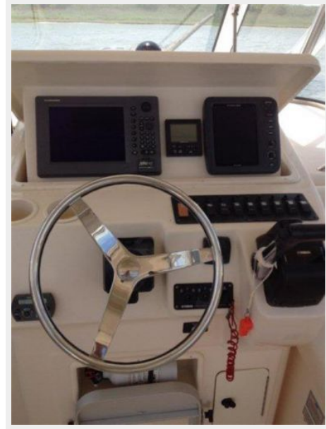
Helm / Electronics & Navigation 1