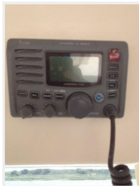
Helm / Electronics & Navigation 5 - Icom VHF Radio