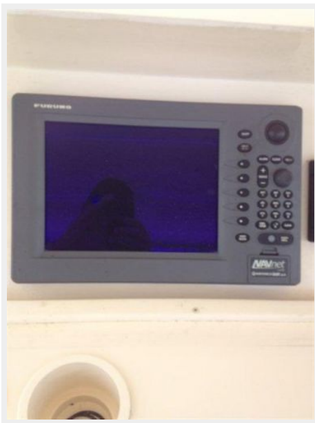
Helm / Electronics & Navigation 2 - NAV NET GPS / Plotter / Radar