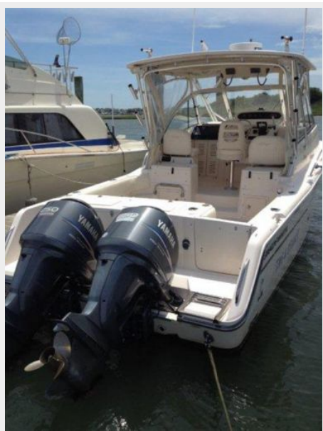
Engine & Mechanical Equipment 2 - Motors