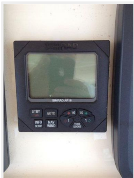
Helm / Electronics & Navigation 4 - Simrad Auto Pilot