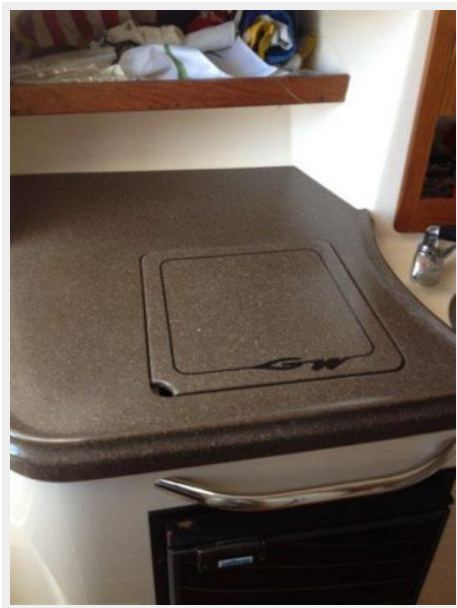
Galley 1 - Stove