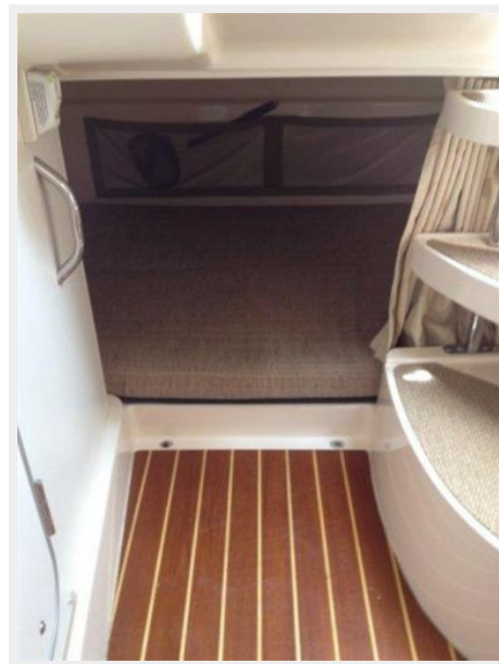
Main Cabin 2 - Aft Cabin Berth