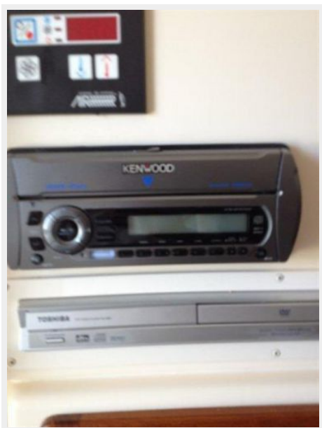
Main Cabin 3 - Stereo System