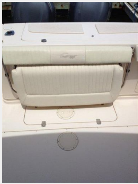
Deck 2 - Aft Seating