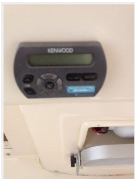
Helm / Electronics & Navigation 6 - Stereo Remote