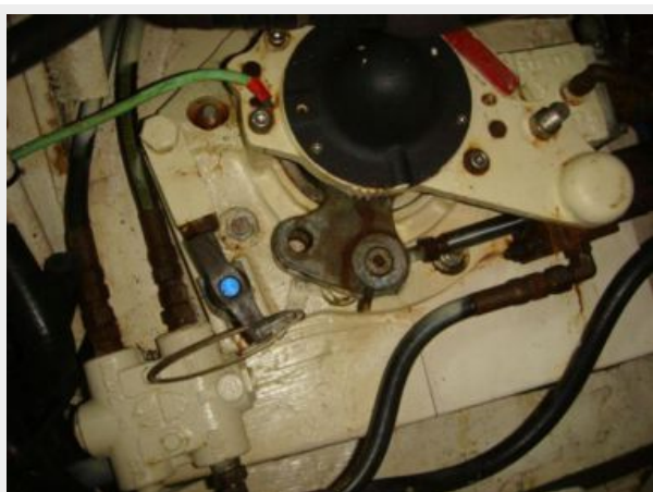
48' Defever Port Stabilizer Head