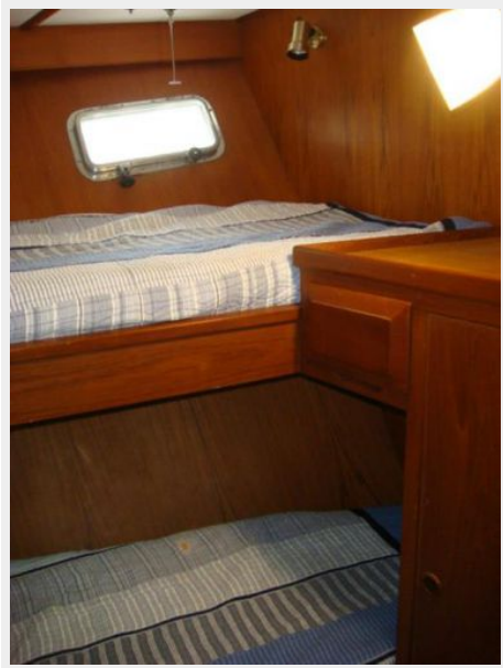
48' Defever Port Guest Stateroom Forward