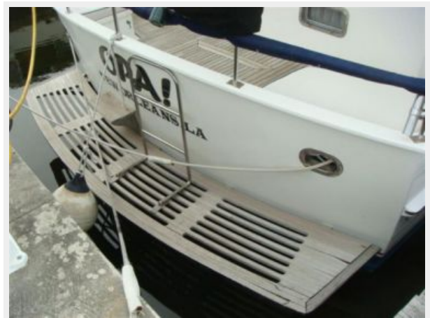
48' Defever Swim Platform