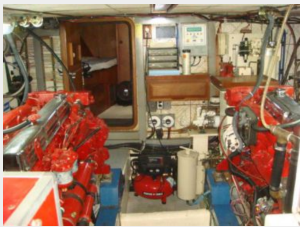
48' Defever Engine Room Forward