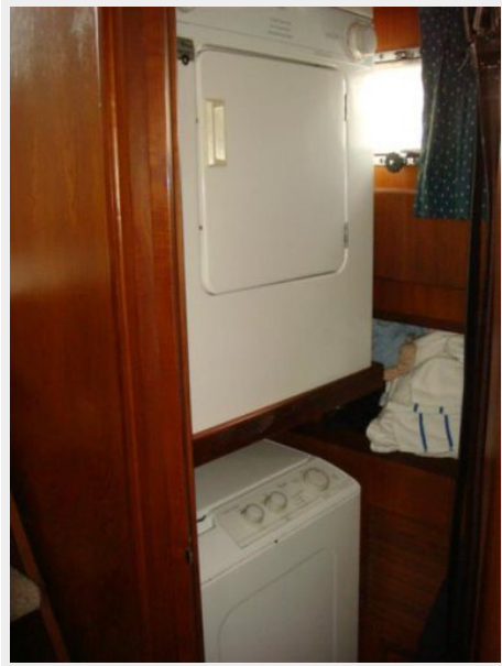
48' Defever Washer-Dryer