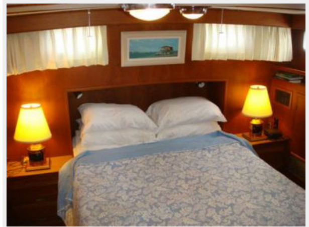
48' Defever Master Stateroom