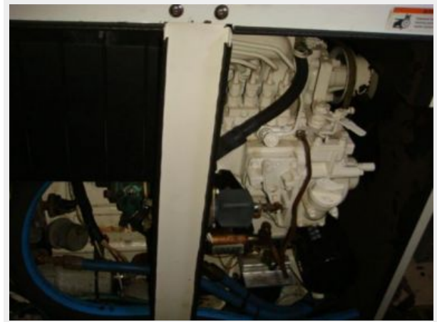
48' Defever Onan Generator