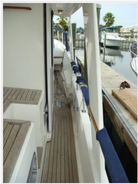
48' Defever Starboard Side Deck photo2