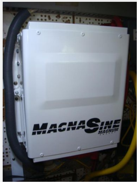
48' Defever Inverter