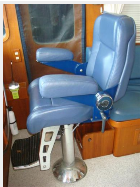
48' Defever Lower Helm Helmseat