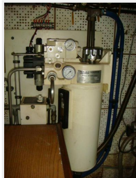
48' Defever Stabilizer System