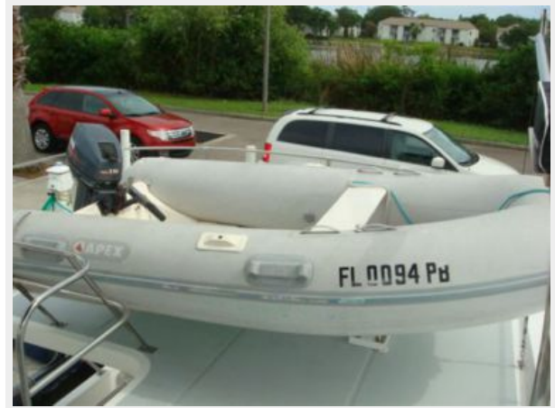
48' Defever Tender