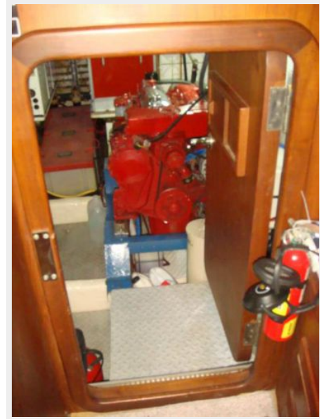
48' Defever Engine Room Access