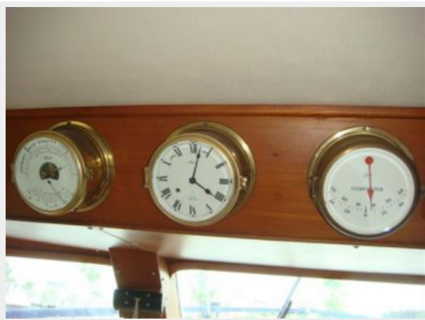
48' Defever Lower Helm OVHD Electronics photo4