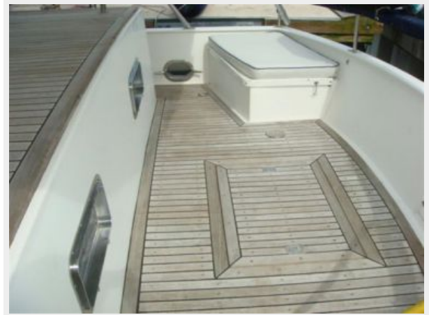
48' Defever Cockpit Starboard