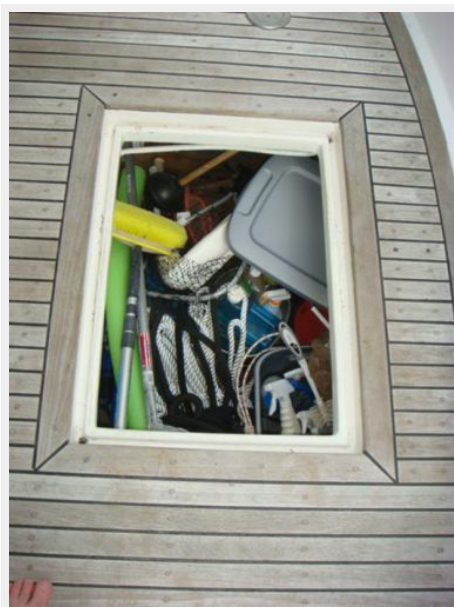
48' Defever Laz Access