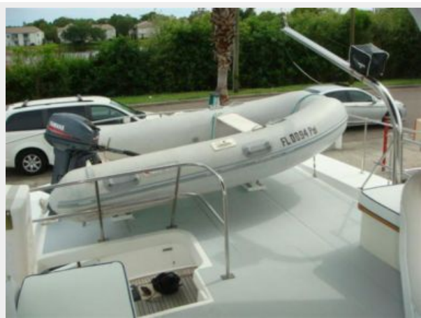
48' Defever Flybridge Aft