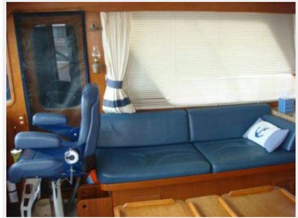
48' Defever Salon Starboard