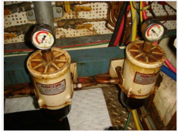
48' Defever Racor Fuel Filters