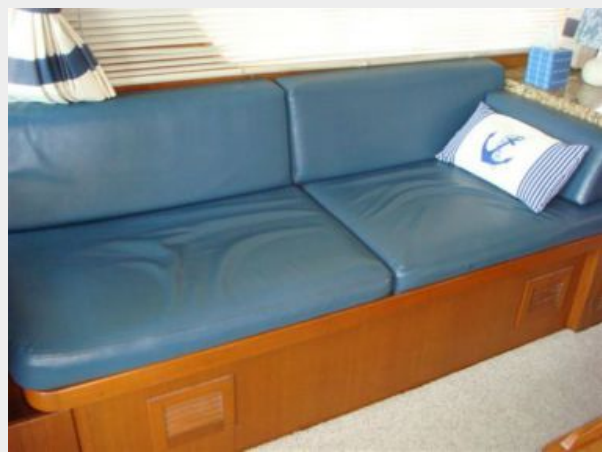
48' Defever Salon Starboard Seating