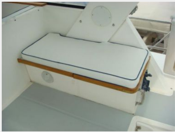
48' Defever Flybridge Starboard Aft Seating