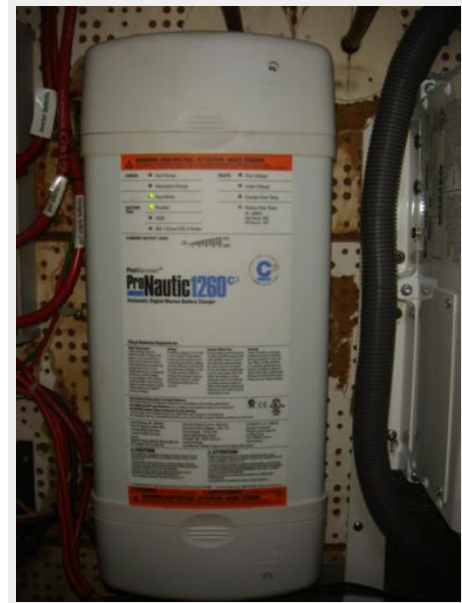
48' Defever Battery Charger