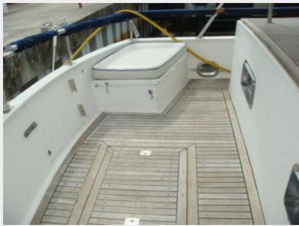
48' Defever Cockpit Port