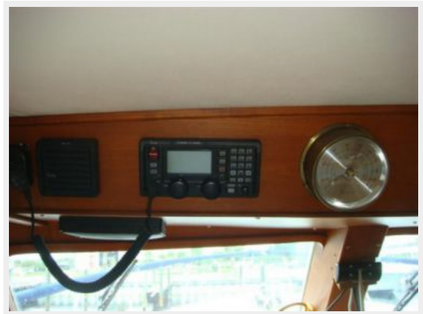
48' Defever Lower Helm OVHD Electronics photo3