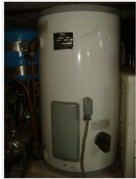
48' Defever Water Heater