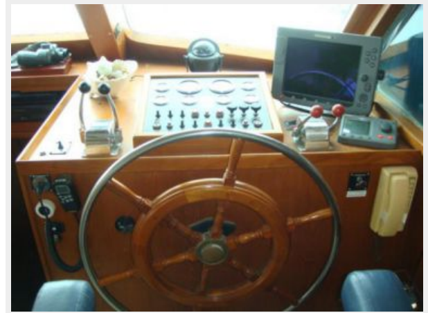
48' Defever Lower Helm photo2