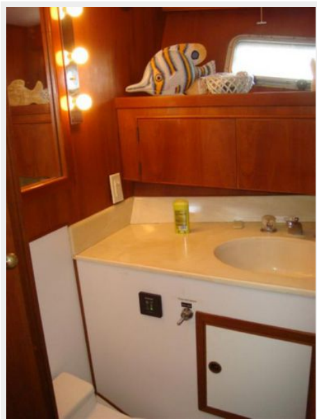
48' Defever Guest Head