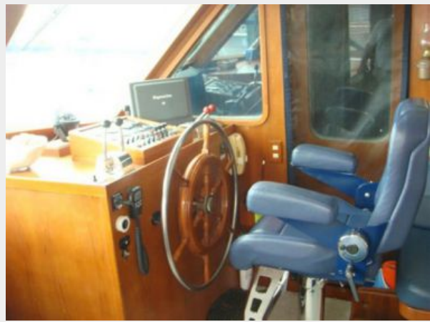
48' Defever Lower Helm photo1