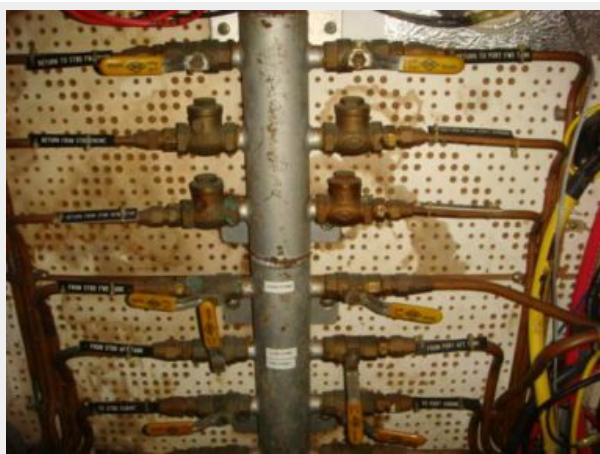
48' Defever Fuel Manifold