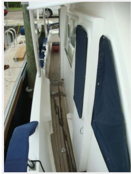
48' Defever Starboard Side Deck photo1