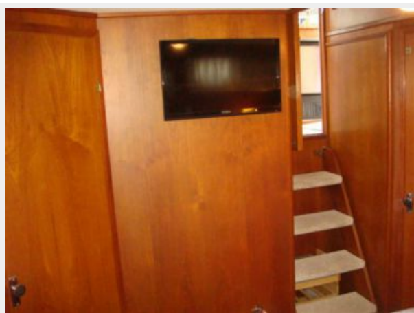
48' Defever Master Stateroom Forward