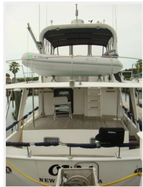
48' Defever Aft Profile