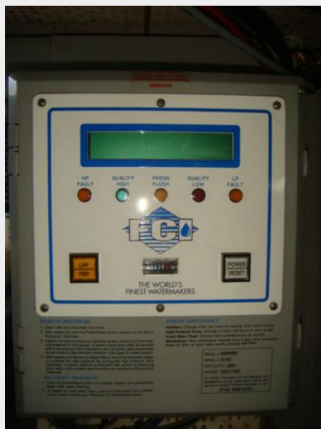
48' Defever Watermaker