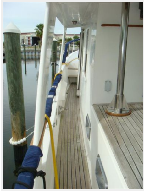
48' Defever Port Side Deck photo2