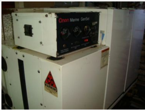
48' Defever Onan Generator Soundbox