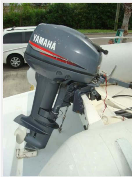
48' Defever Tender Outboard