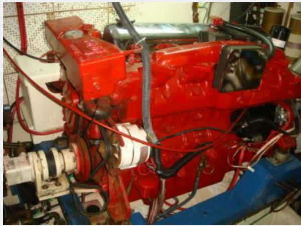
48' Defever Starboard Main Engine