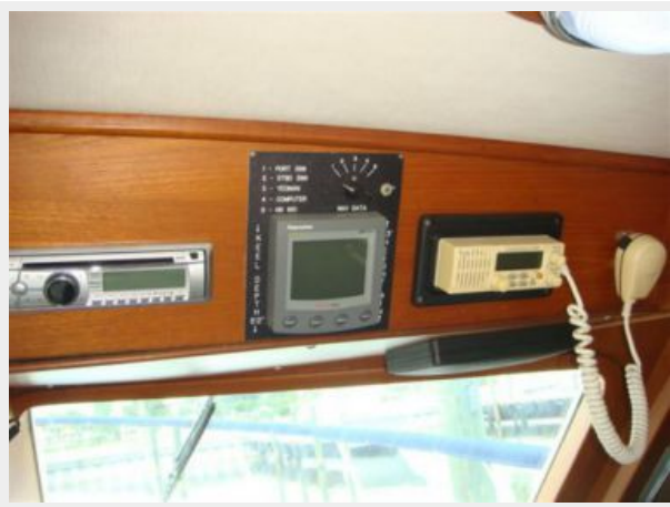
48' Defever Lower Helm OVHD Electronics photo2