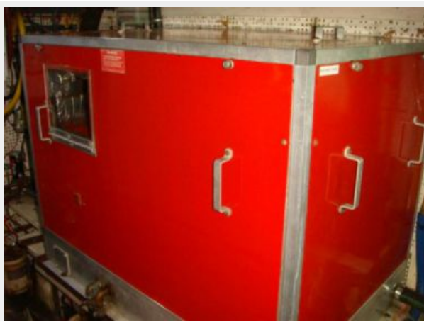
48' Defever Westerbeke Generator Soundbox