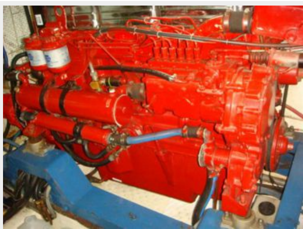
48' Defever Port Main Engine