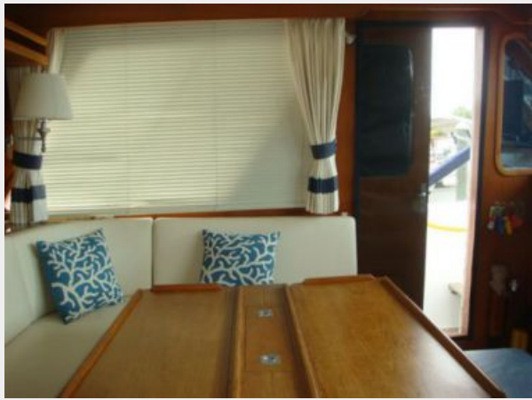
48' Defever Salon Port