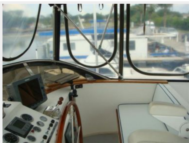
48' Defever Flybridge STarboard