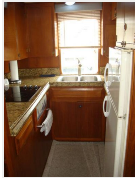
48' Defever Galley photo1