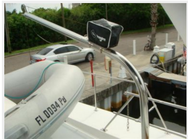
48' Defever Tender Davit