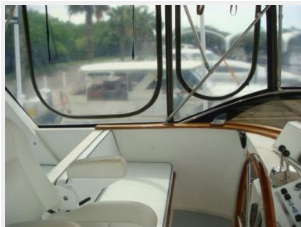
48' Defever Flybridge Port