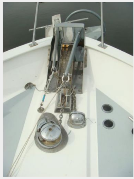
48' Defever Anchor Windlass