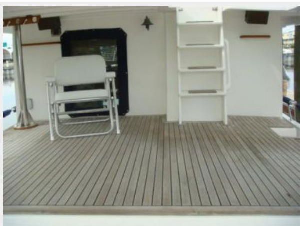
48' Defever Trunk Cabin Forward