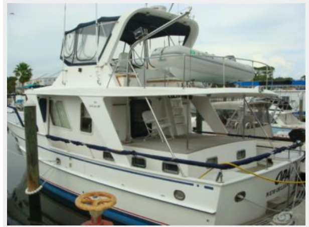
48' Defever Aft Profile