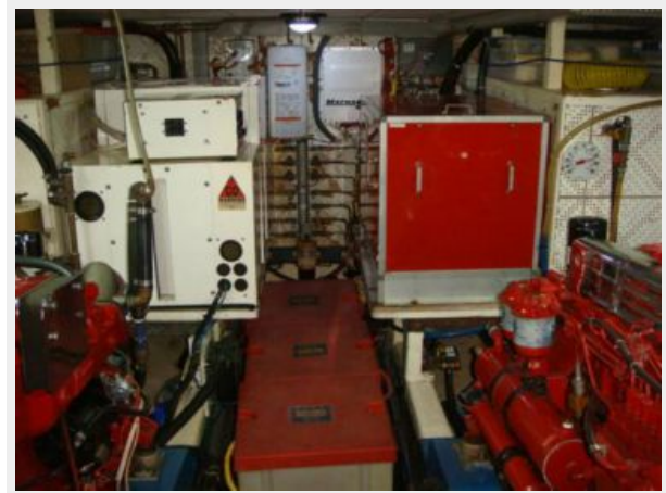
48' Defever Engine Room Aft