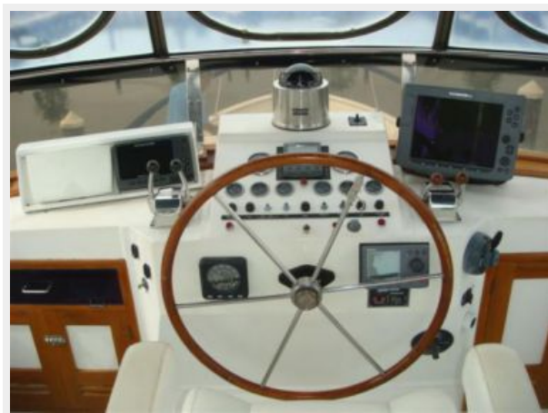
48' Defever Flybridge Helm