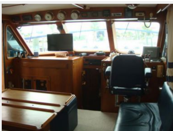
48' Defever Salon Forward