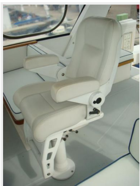
48' Defever Flybridge Helmseat