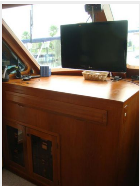
48' Defever Salon Port Forward