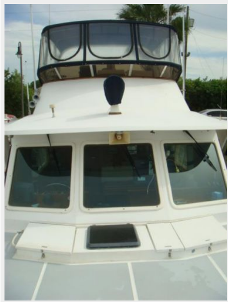
48' Defever Foredeck Aft