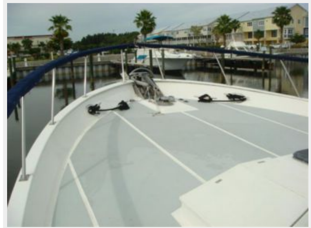
48' Defever Foredeck