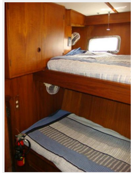
48' Defever Port Guest Stateroom Aft