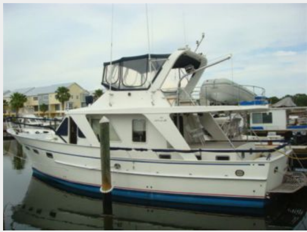
48' Defever Port Profile