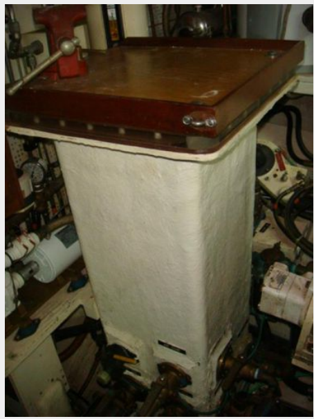
48' Defever Sea Chest