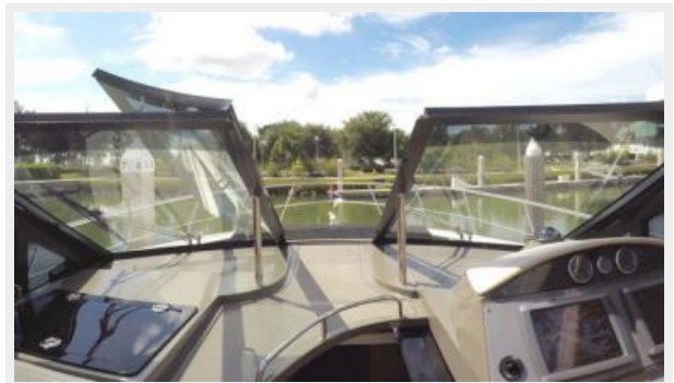
Walk thru windshield w Retractable roof