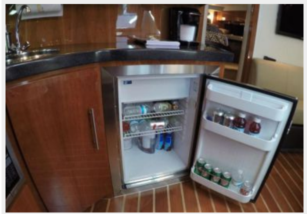
Galley Second photo