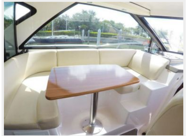
Helm area Seating