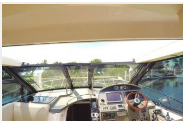
Walk thru windshield w Retractable roof Windshield closed