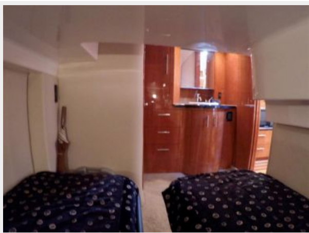
Guest Stateroom looking out