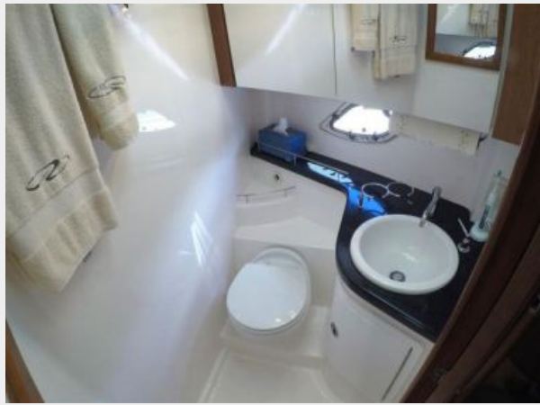
Master Stateroom Head Port side