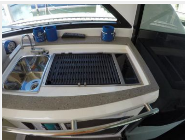
Helm Area Wet bar with TV above