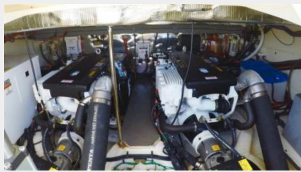
Volvo Penta IPS engine room