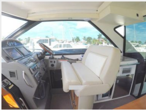
Helm Seating Electric