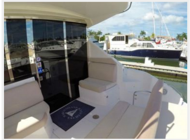
Sliding Glass door, no curtains to roll up