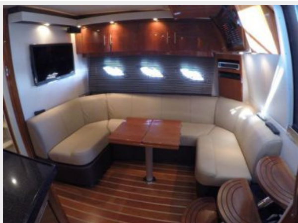
Salon w/ table