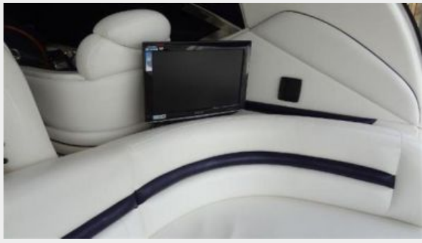
New Cockpit TV/DVD