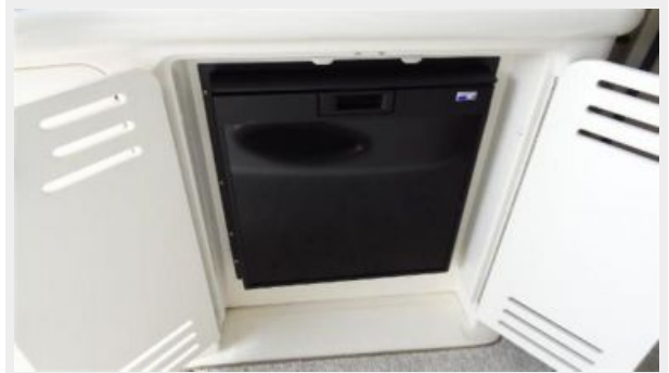
New Cockpit Refrigerator