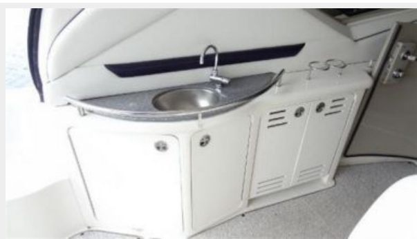
Cockpit Wet Bar