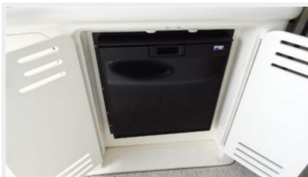
New Cockpit Refrigerator