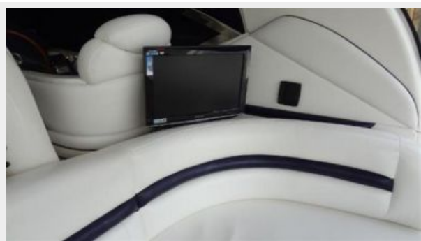
New Cockpit TV/DVD