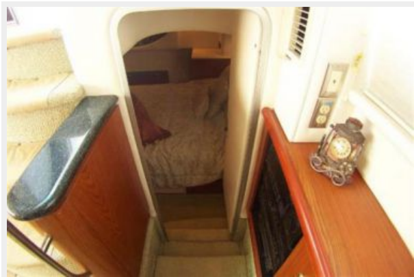
Passageway to aft MSR