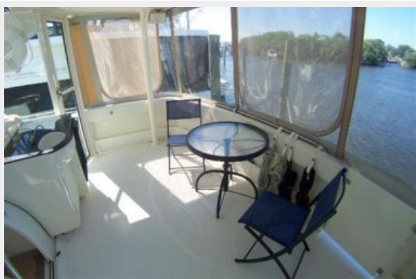
Eisenglass enclosed Aft Deck