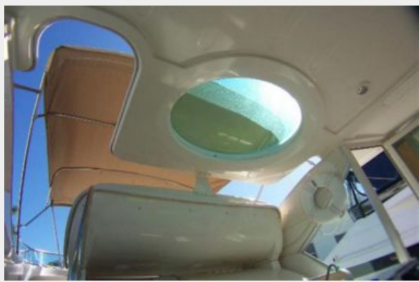
Skylight in Aft Deck Hardtop