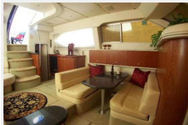
Portside Dinette in Salon