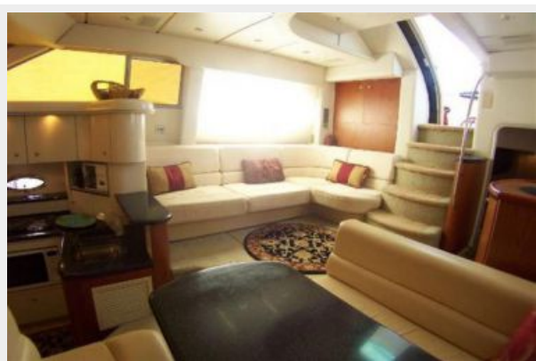
Starboard L-Settee and Galley