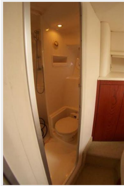
Guest ensuite Head entrance