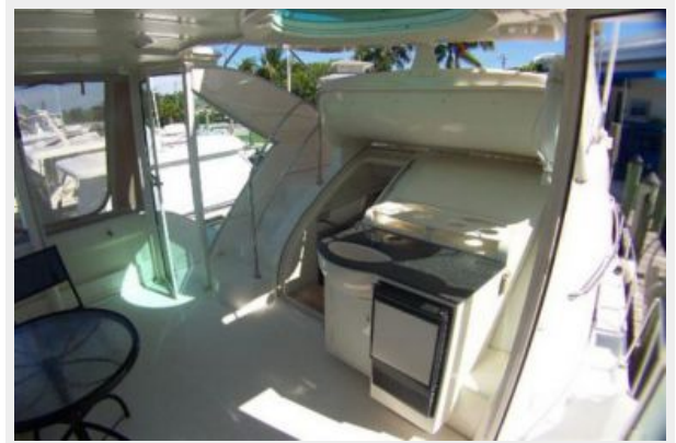
Aft Deck with Wet Bar, Sink, Fridge