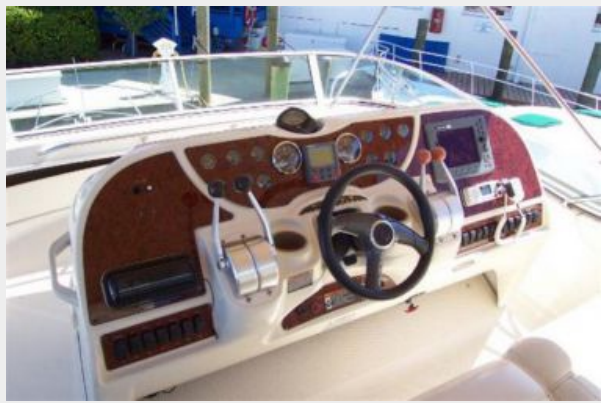
Helm with full instrumentation