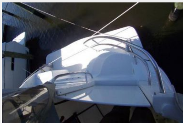
Molded curved Staircase to large Swim Platform, from Aft Deck