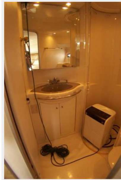
Guest/Day Head and Shower