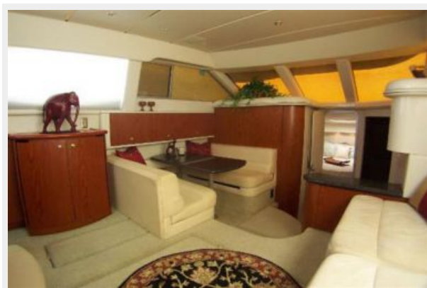
Salon forward to port