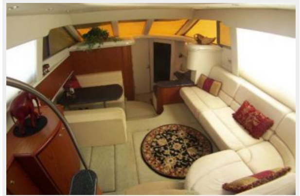
Main Cabin - Salon, Dinette, Galley