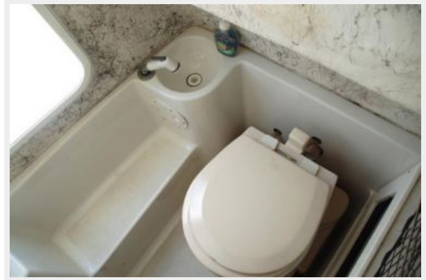
Fresh water Vacu-Flush Head and Sink