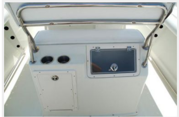
Back of Leaning Post