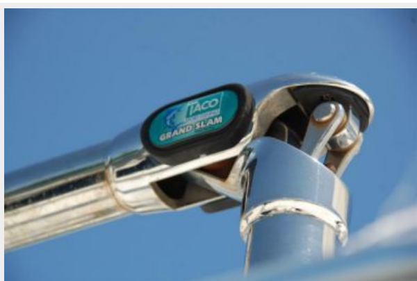
Grand Slam Taco Outriggers