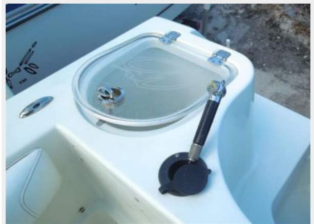
Freshwater Washdown and Livewell on Transom