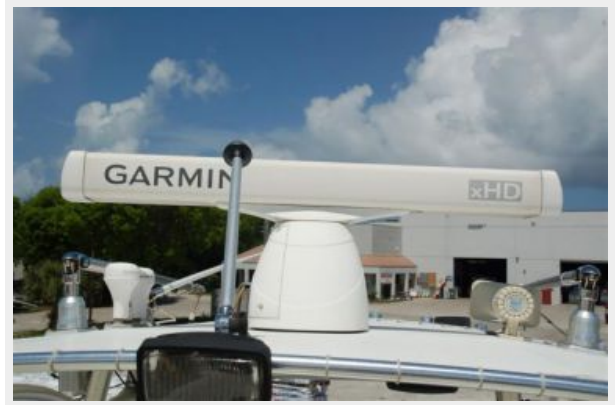
Garmin GMR Open-Array Radar Scanner