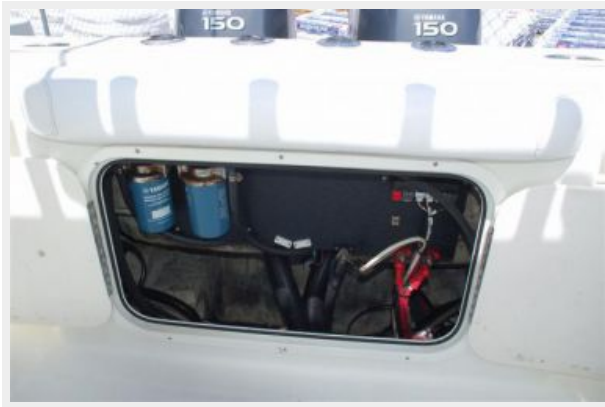
Bilge Space Access