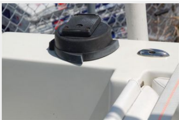
Downrigger Base, Penn Fathom-Master Included