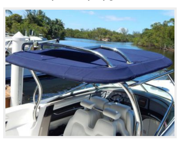
Speed Top Upgrade