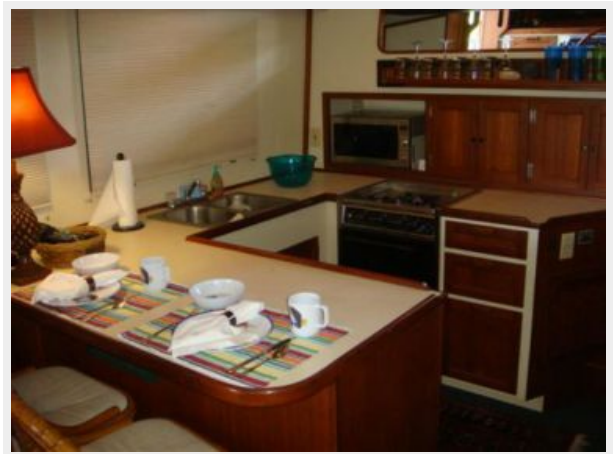
37' Pacific Trawler galley photo1