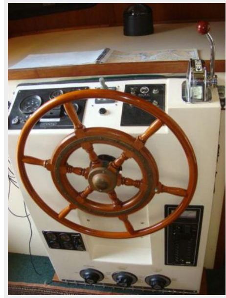
37' Pacific Trawler pilothouse helm