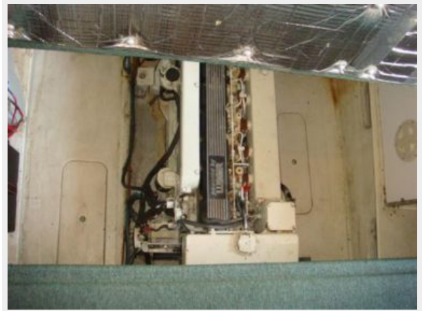
37' Pacific Trawler engine room access