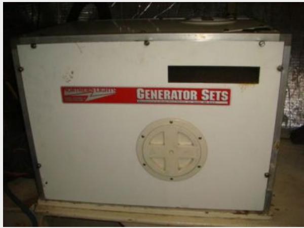
37' Pacific Trawler generator soundbox