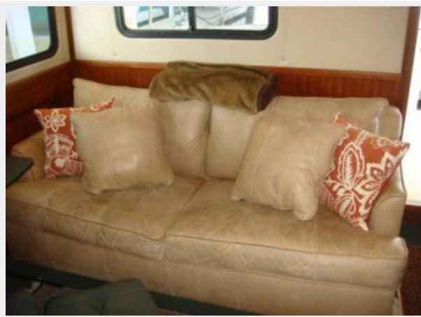
37' Pacific Trawler salon aft