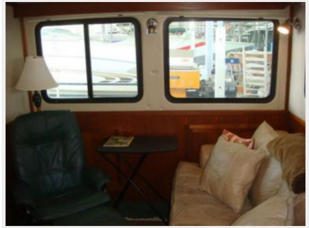
37' Pacific Trawler salon starboard