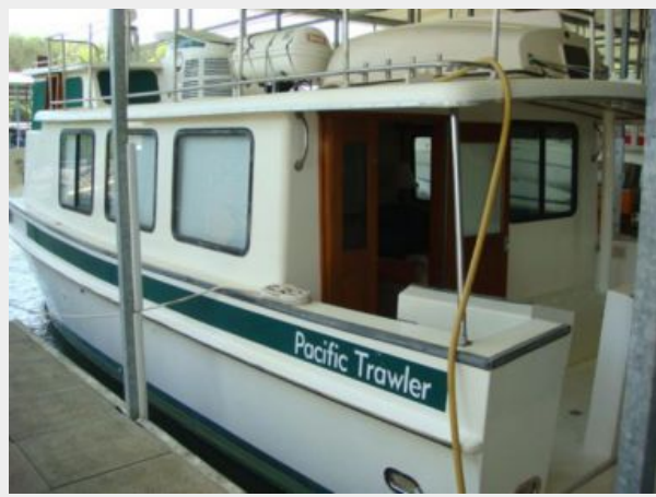
37' Pacific Trawler port aft profile