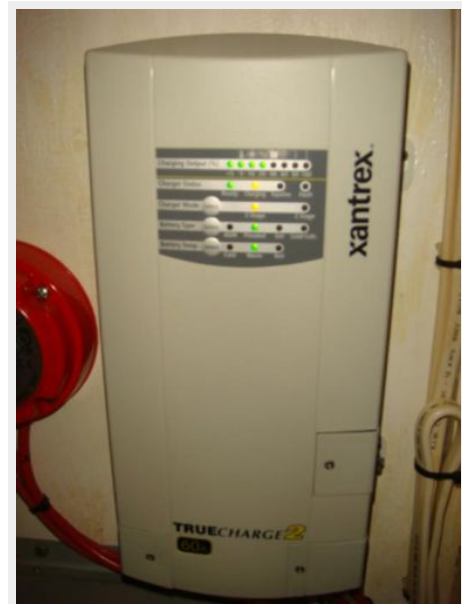
37' Pacific Trawler battery charger