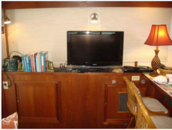
37' Pacific Trawler salon port