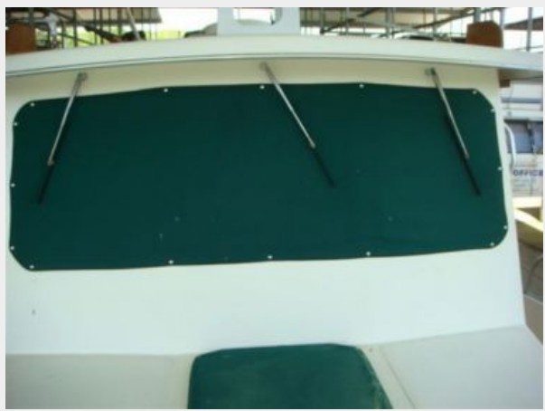
37' Pacific Trawler foredeck aft