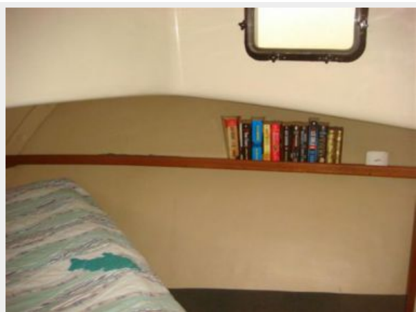
37' Pacific Trawler satteroom starboard