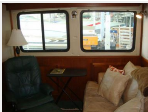
37' Pacific Trawler salon starboard