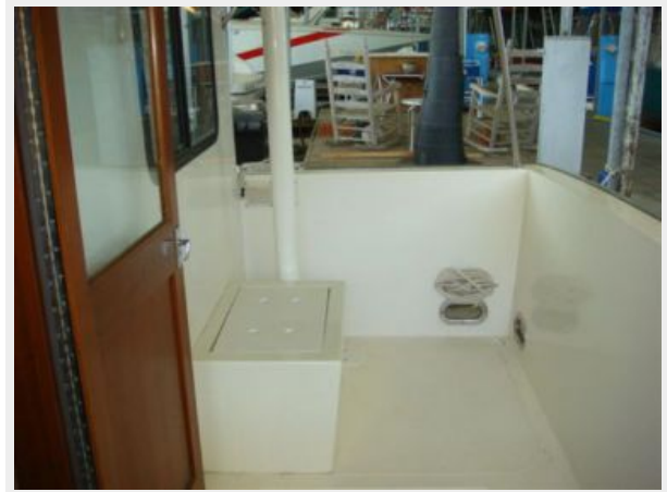
37' Pacific Trawler aftdeck starboard