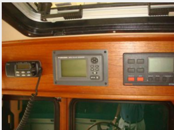
37' Pacific Trawler pilothouse electronics