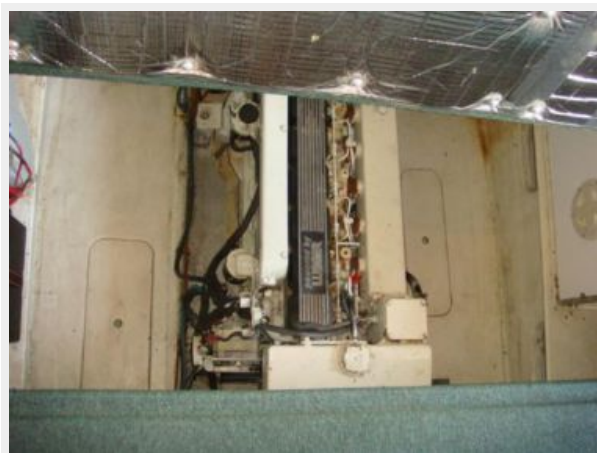
37' Pacific Trawler engine room access