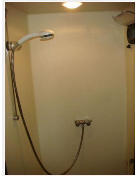
37' Pacific Trawler shower