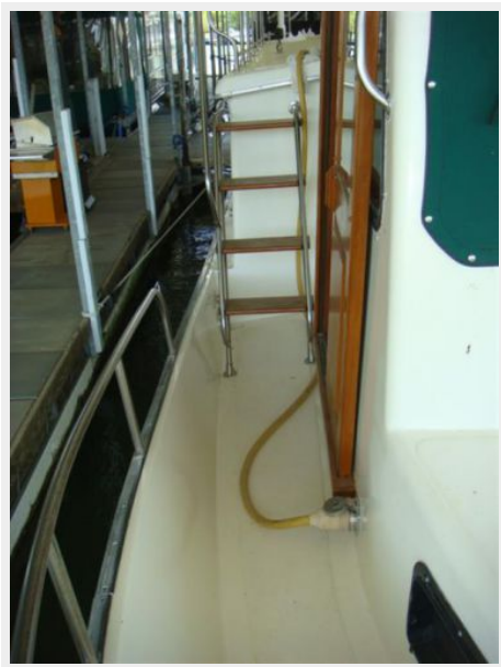
37' Pacific Trawler starboard side deck