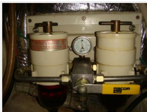
37' Pacific Trawler Racor fuel filters