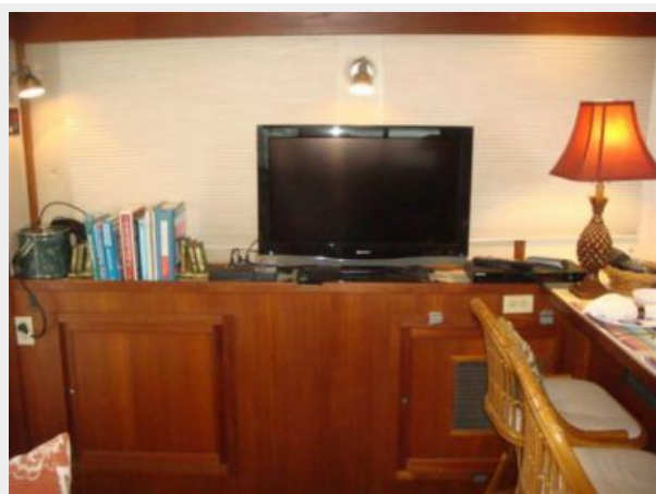
37' Pacific Trawler salon port