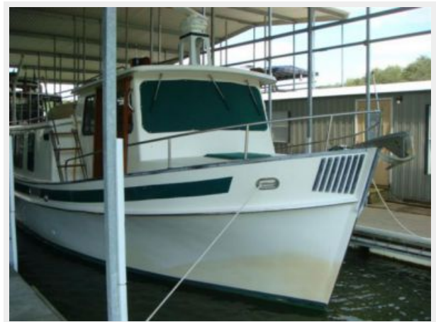
37' Pacific Trawler anchor windlass