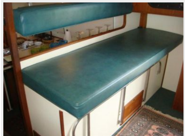
37' Pacific Trawler pilothouse seating