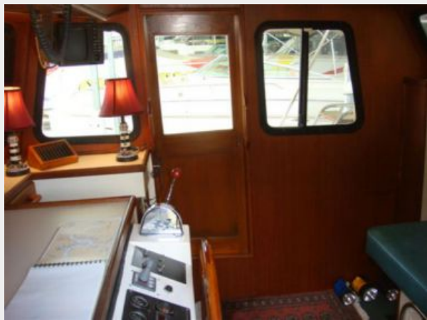
37' Pacific Trawler pilothouse starboard