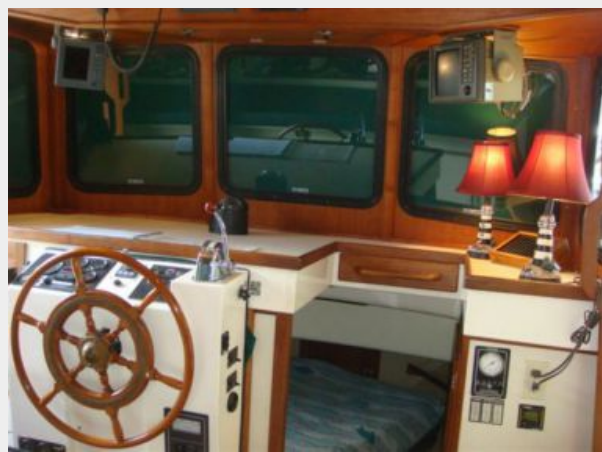
37' Pacific Trawler pilothouse