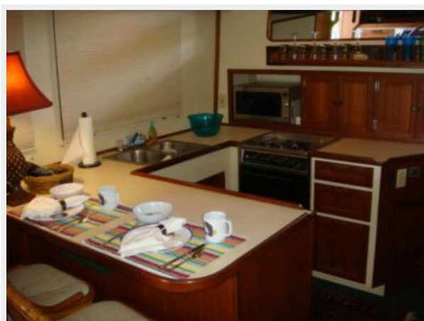
37' Pacific Trawler galley photo1