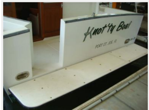
37' Pacific Trawler swimplatform