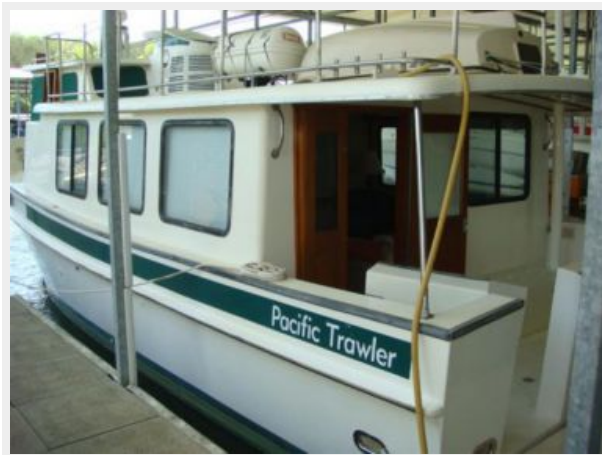
37' Pacific Trawler port aft profile