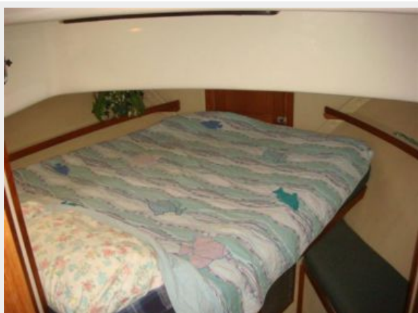
37' Pacific Trawler stateroom