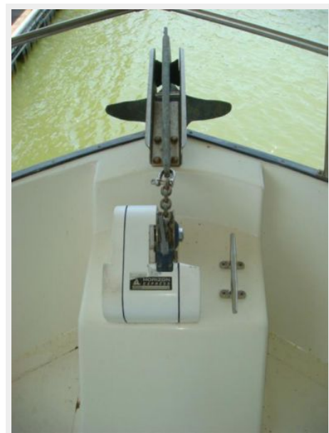
37' Pacific Trawler anchor windlass