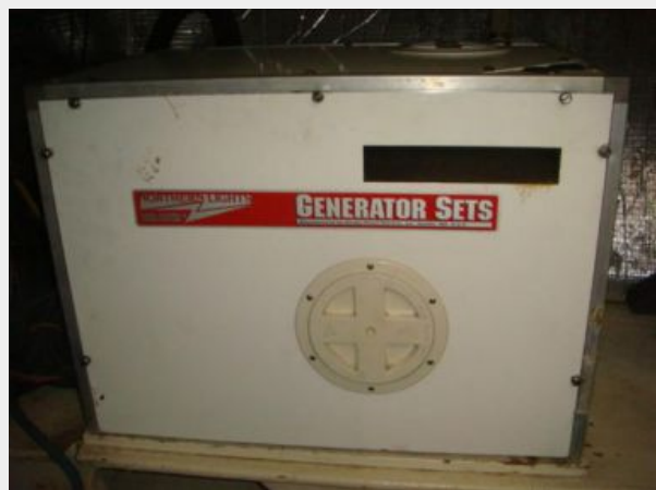
37' Pacific Trawler generator soundbox