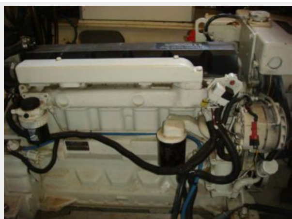
37' Pacific Trawler main engine