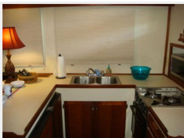
37' Pacific Trawler galley photo2