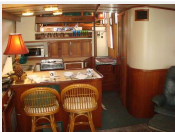
37' Pacific Trawler salon forward