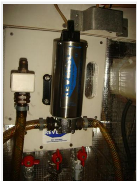
37' Pacific Trawler oil change system