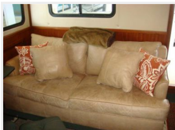
37' Pacific Trawler salon aft