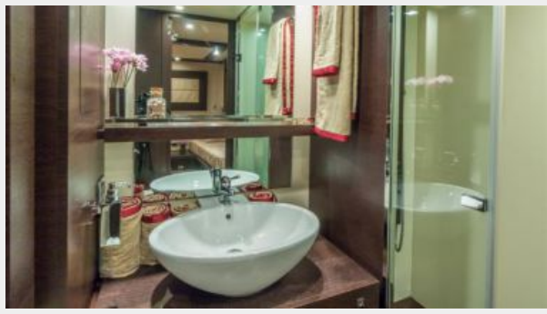
VIP Head 2