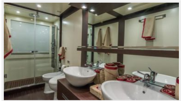
Master Head 1