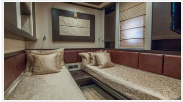
Guest Cabin 1