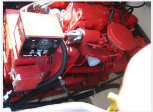
8KW Westerbeke Generator