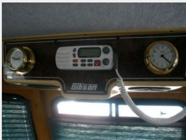
Lower Helm 2