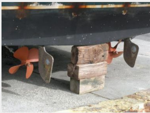
Props - Rudders