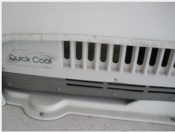
Reverse Cycle A/C