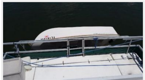
9' Tender on Weaver Davits