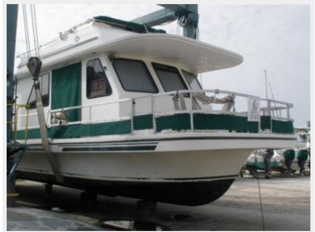
Starboard View - Sling