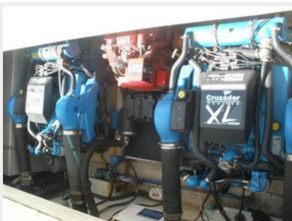
Twin FWC 454 Crusaders