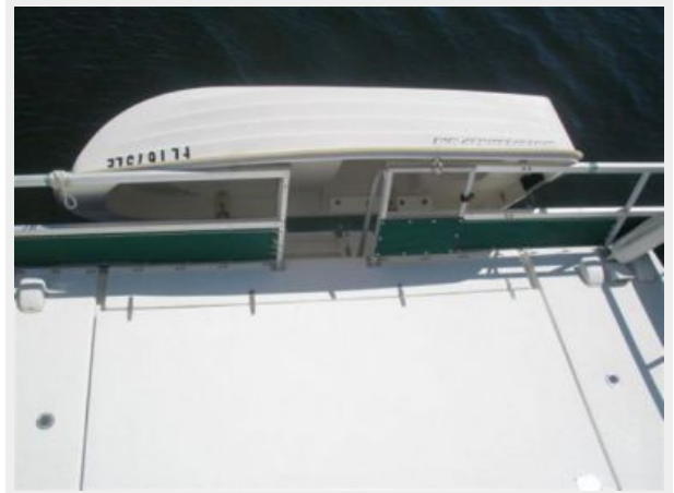
Aft Cockpit - 9' dinghy