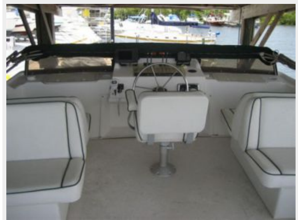
Bridge -Upper Helm