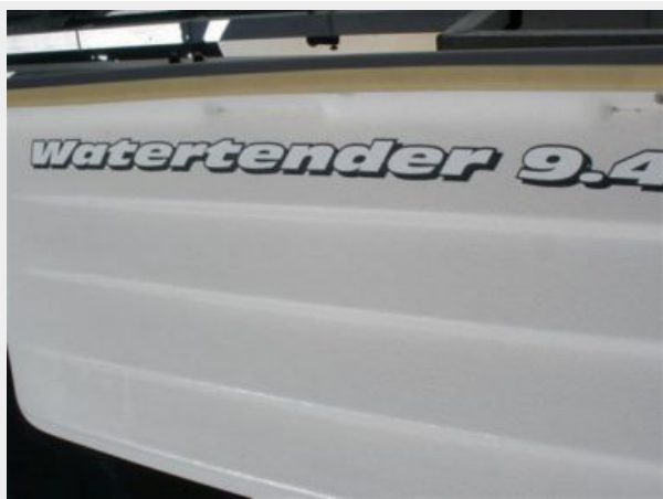
9' Leisure Water Tender