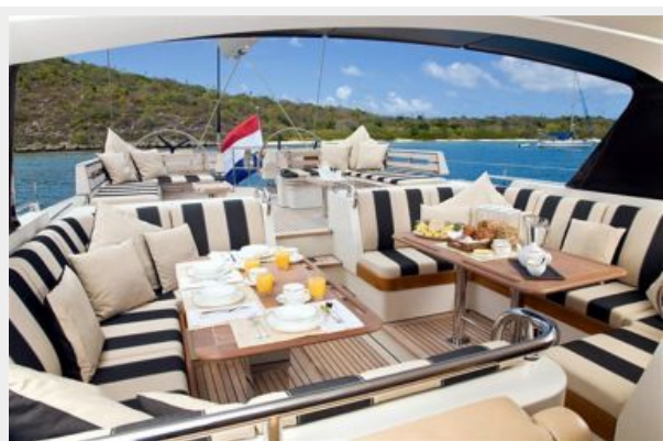
Al fresco dining