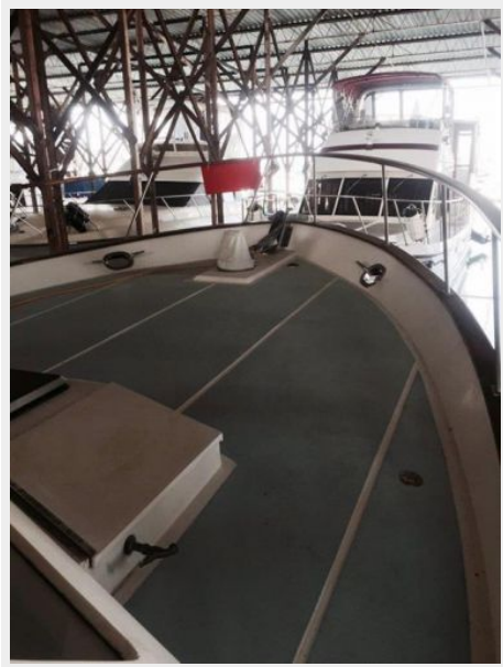
Transferrable Covered Moorage