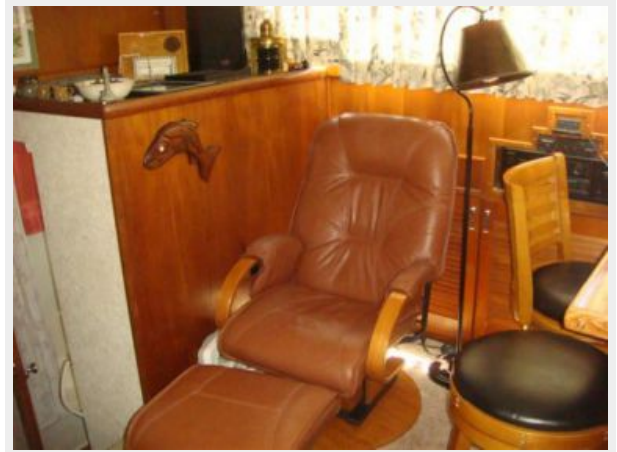
45' Chris Craft Salon Starboard Forward