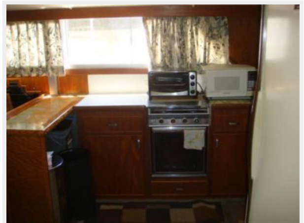
45' Chris Craft Galley photo2