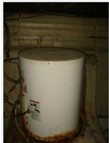
45' Chris Craft Water Heater