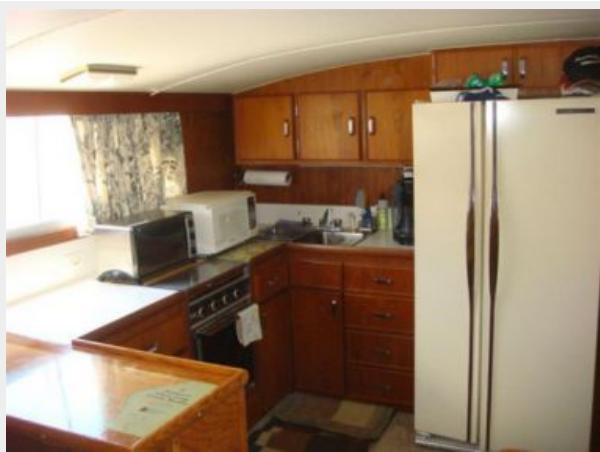
45' Chris Craft Galley photo1