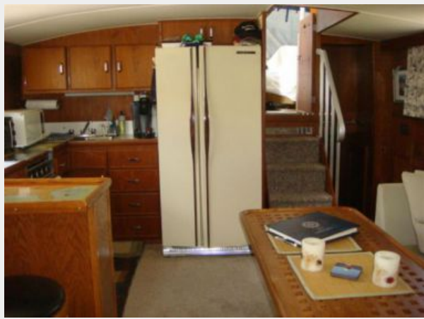
45' Chris Craft Salon Aft