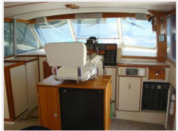
45' Chris Craft Sundeck Forward