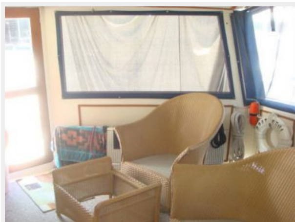
45' Chris Craft Sundeck Starboard