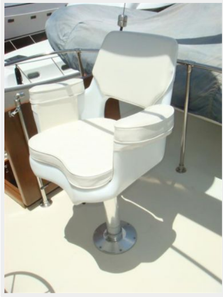
45' Chris Craft Flybridge Helmseat