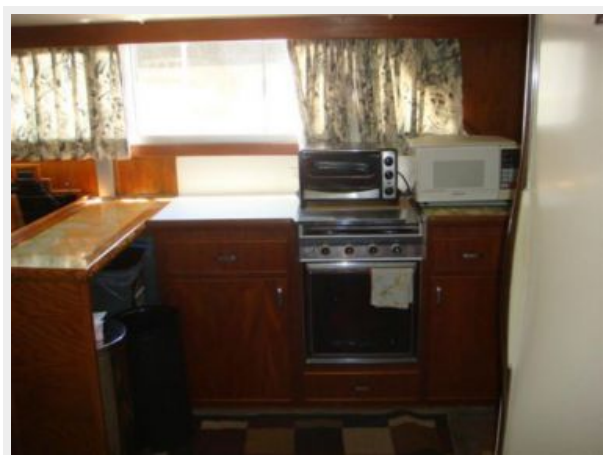
45' Chris Craft Galley photo2