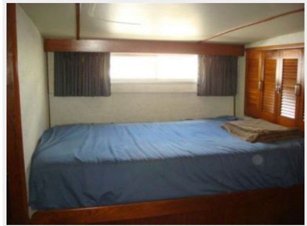
45' Chris Craft Master Stateroom Starboard