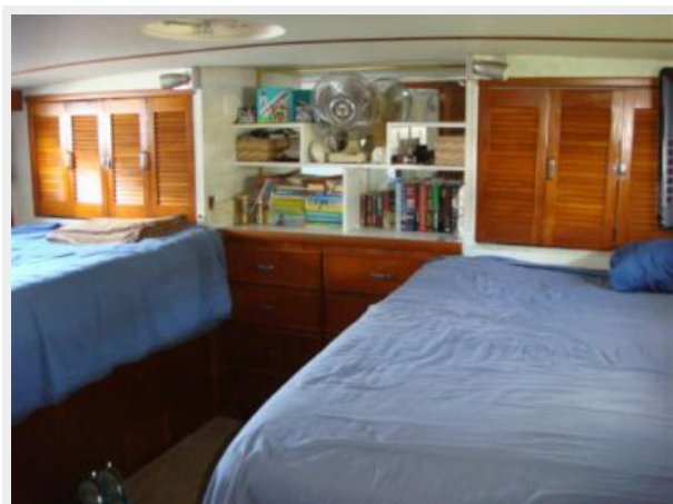
45' Chris Craft Master Stateroom