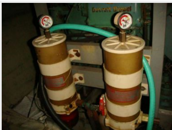
45' Chris Craft Racor Fuel Filters