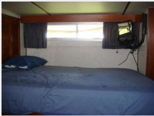
45' Chris Craft Master Stateroom Port