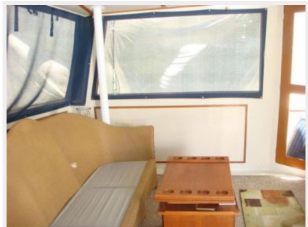
45' Chris Craft Sundeck Port