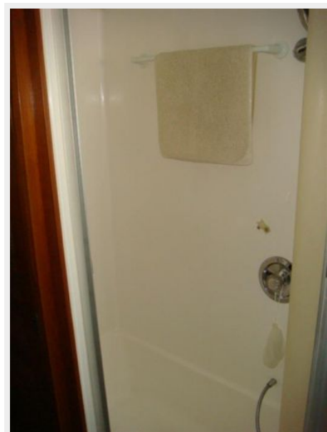
45' Chris Craft Master Stateroom Shower