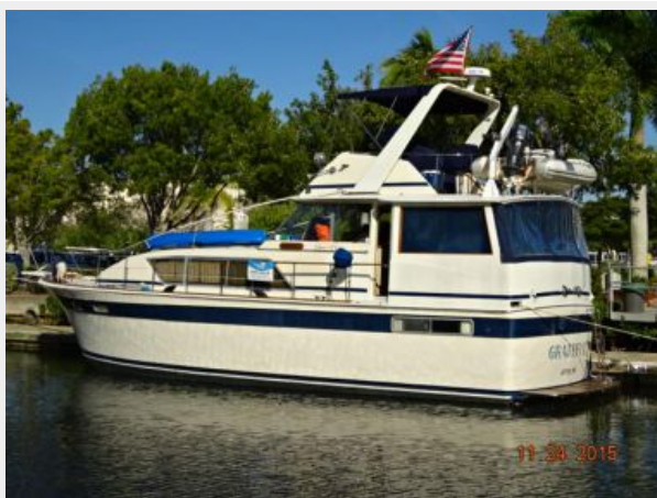
45' Chris Craft port aft profile