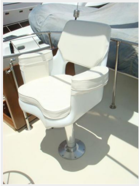
45' Chris Craft Flybridge Helmseat