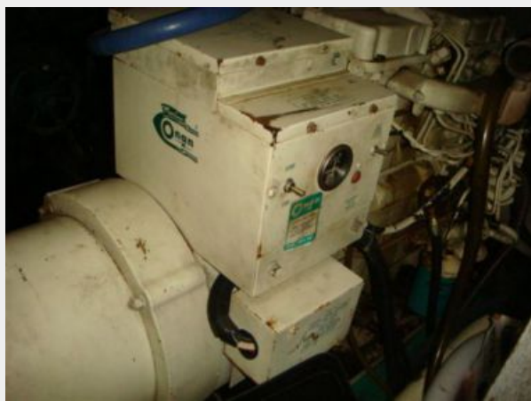
45' Chris Craft Generator photo1