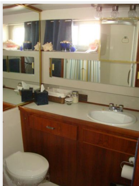
45' Chris Craft Master Stateroom Head