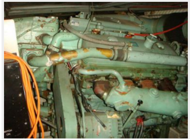
45' Chris Craft Starboard Main Engine