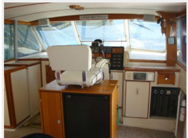
45' Chris Craft Sundeck Forward