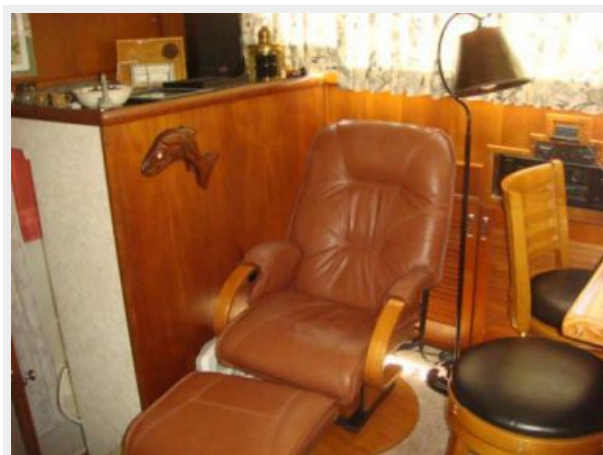
45' Chris Craft Salon Starboard Forward