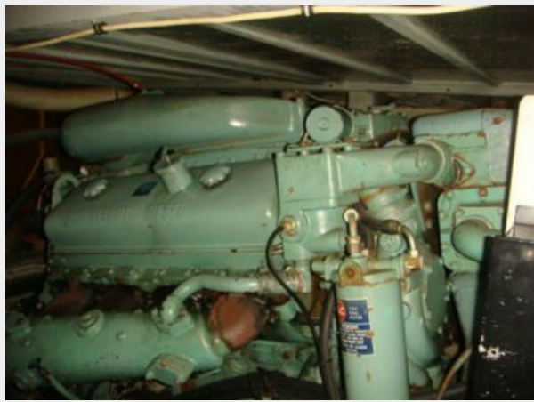
45' Chris Craft Port Main Engine