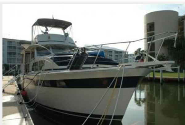
45' Chris Craft Starboard Forward Profile