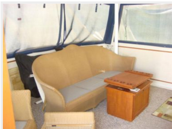
45' Chris Craft Sundeck