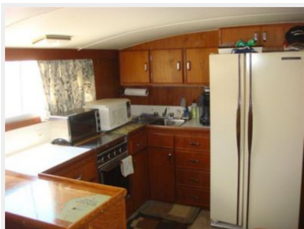
45' Chris Craft Galley photo1