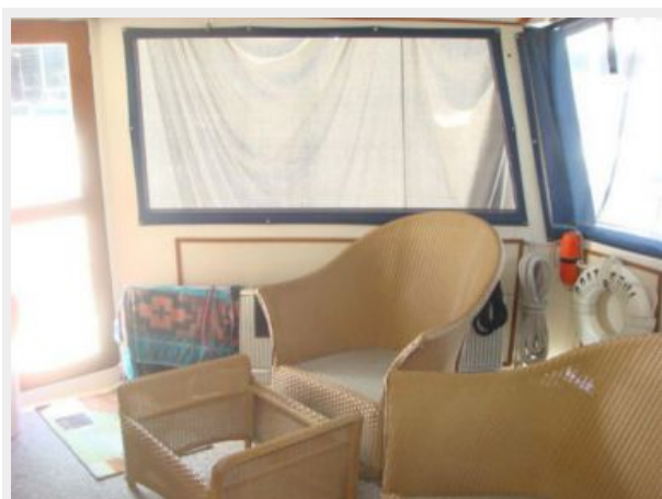
45' Chris Craft Sundeck Starboard