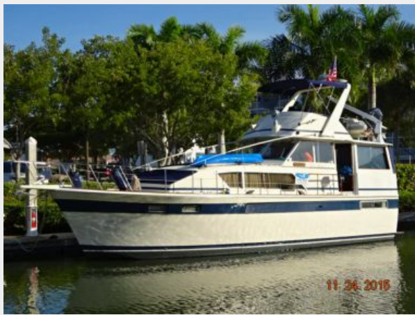
45' Chris Craft port forward profile photo1