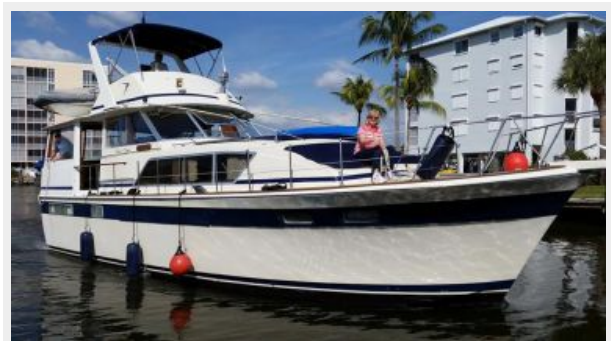
45' Chris Craft starboard forward profile photo1