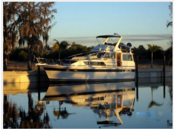
45' Chris Craft Port Forward Profile