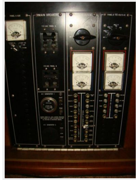
45' Chris Craft Salon Electrical Panel