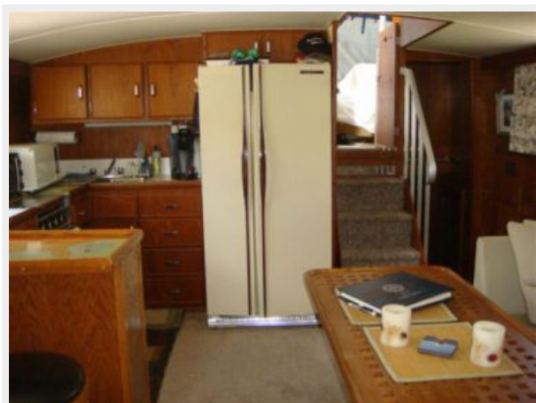
45' Chris Craft Salon Aft