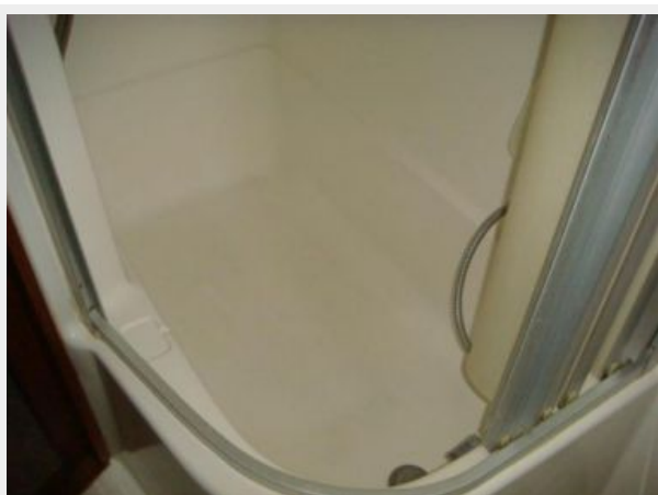
45' Chris Craft Master Stateroom Tub