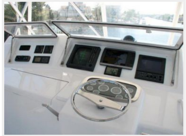
Helm / Electronics & Navigation 3