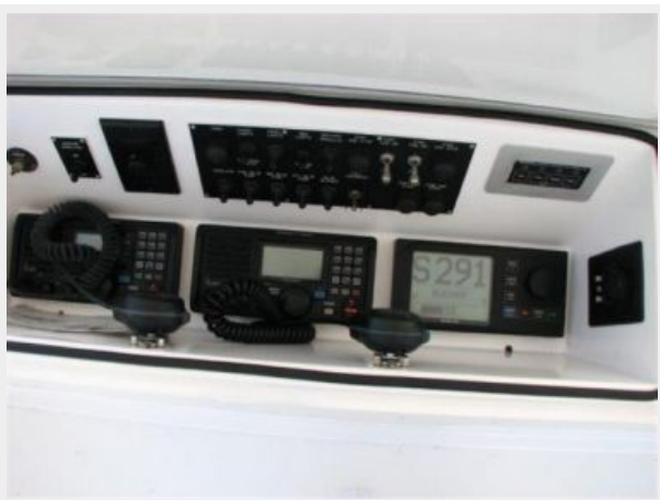
Helm / Electronics & Navigation 6 - Radio Box