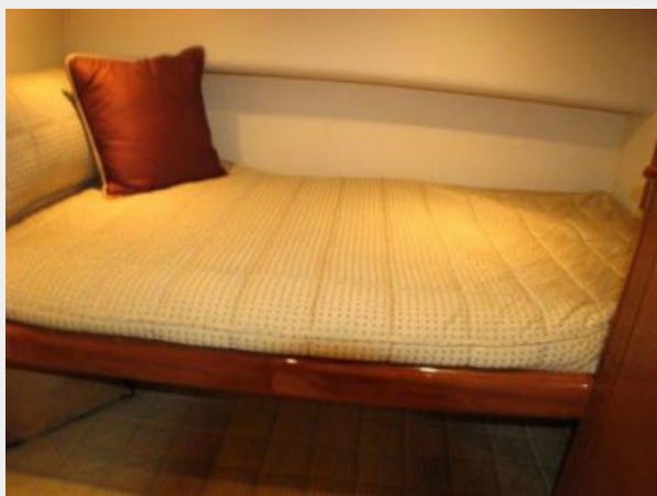
Guest Stateroom 3