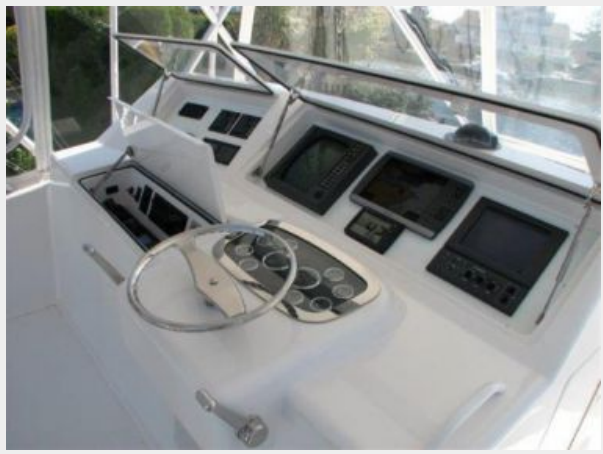
Helm / Electronics & Navigation 2