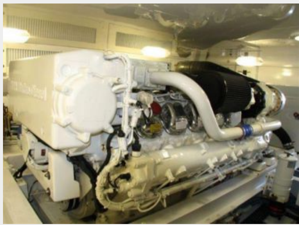
Engine & Mechanical Equipment 2 - Port Engine