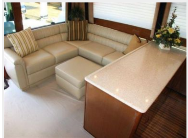
Salon 1 - Sofa