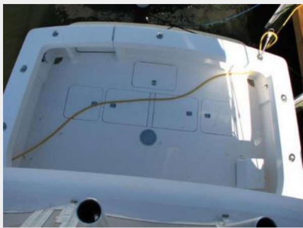
Cockpit / Fishing Equipment 1