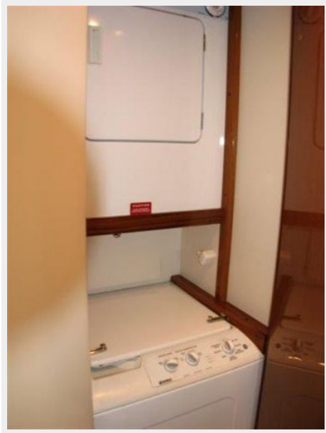
Galley / Laundry - Clothes Washer & Clothes Dryer