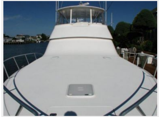
Deck 3 - View From Pulpit