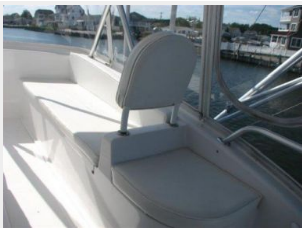
Deck 6 - Bridge Seating