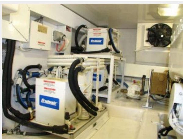
Engine & Mechanical Equipment 6 - Cruisair