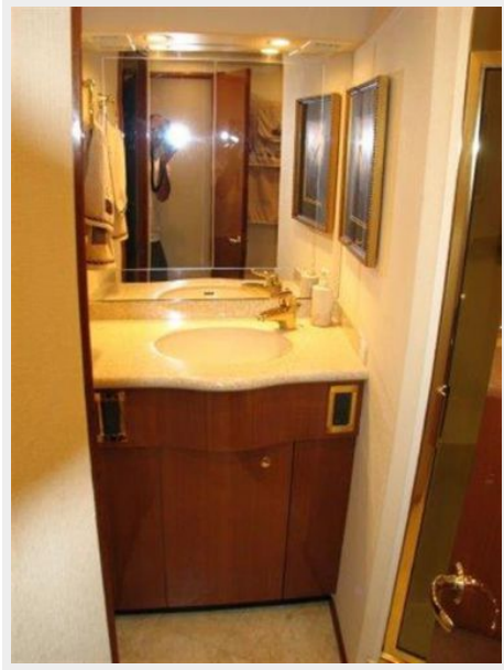
Guest Head 1