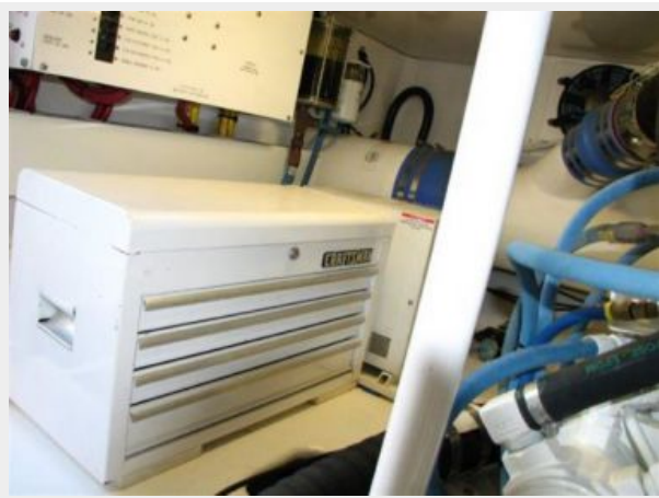
Engine & Mechanical Equipment 10 - Engine Room