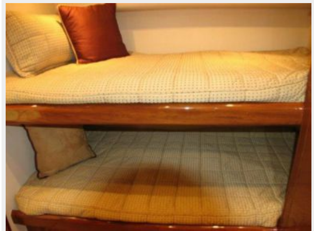
Guest Stateroom 2