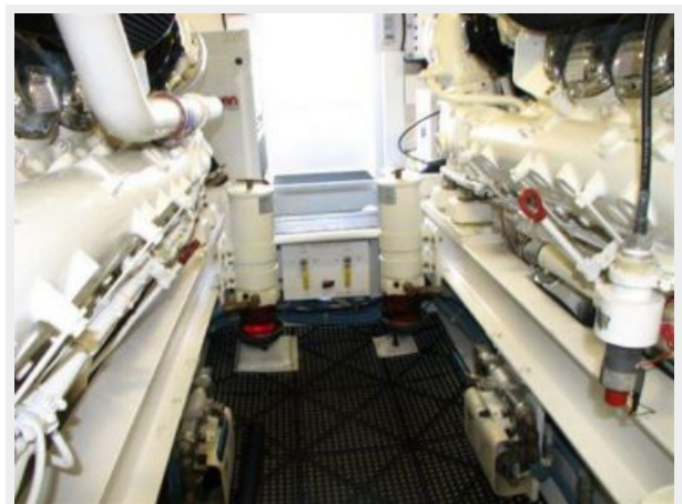
Engine & Mechanical Equipment 5 - Engine Room