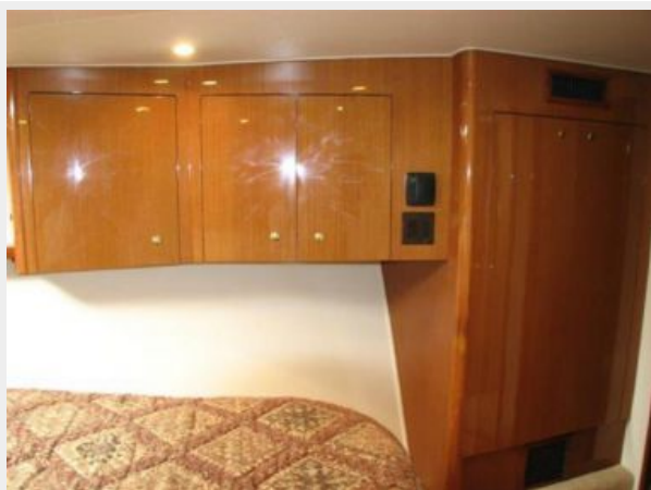
Master Stateroom 3