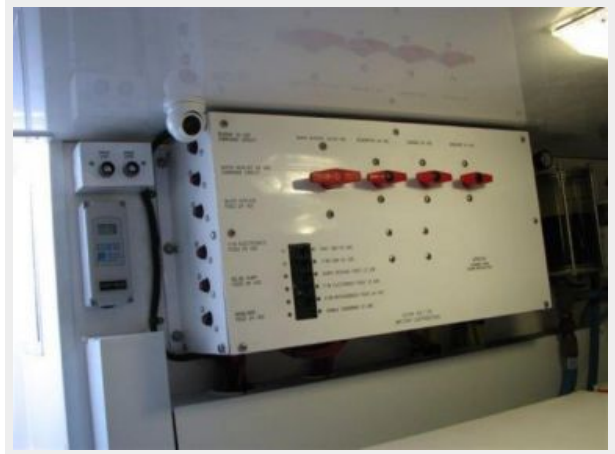
Engine & Mechanical Equipment 9 - Engine Room