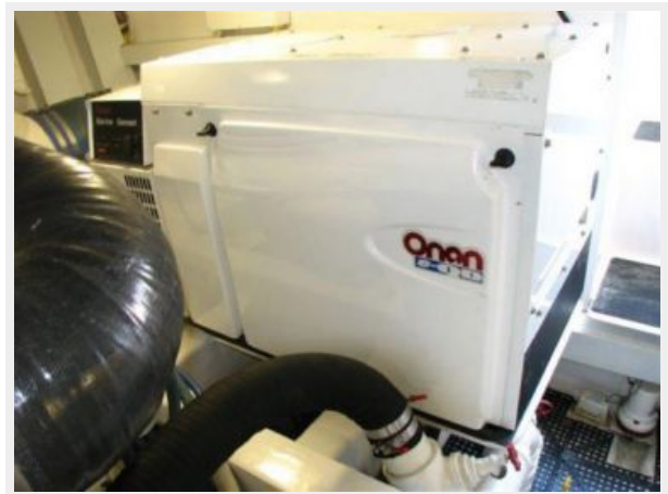
Electrical System / Equipment - Onan Generator