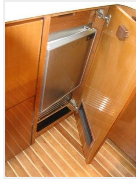
Galley 4 - Ice Maker