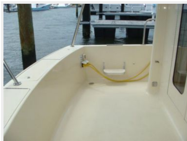
34' Mainship Aftdeck Port