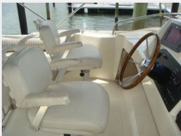
34' Mainship Flybridge Port