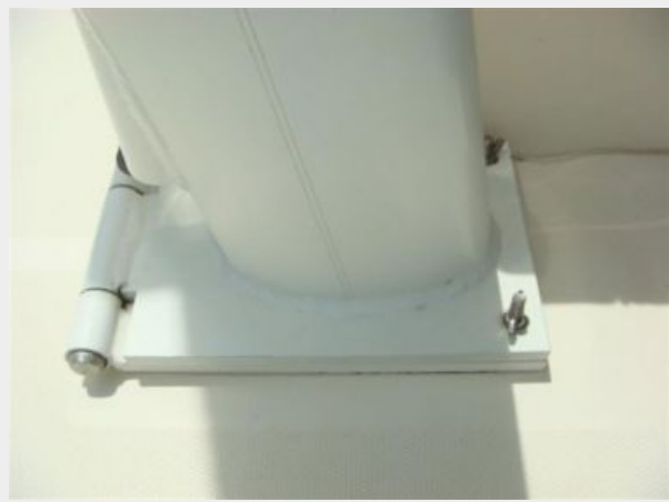
34' Mainship Mast Hinge