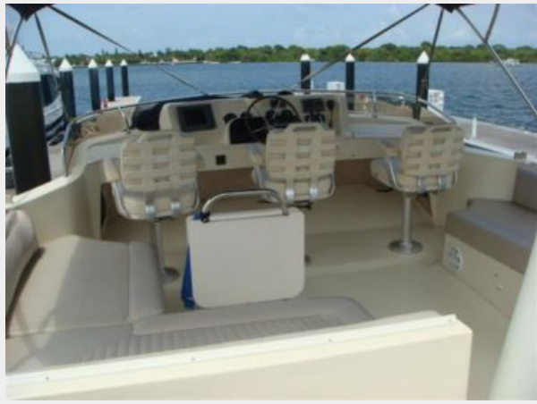
34' Mainship Flybridge Forward