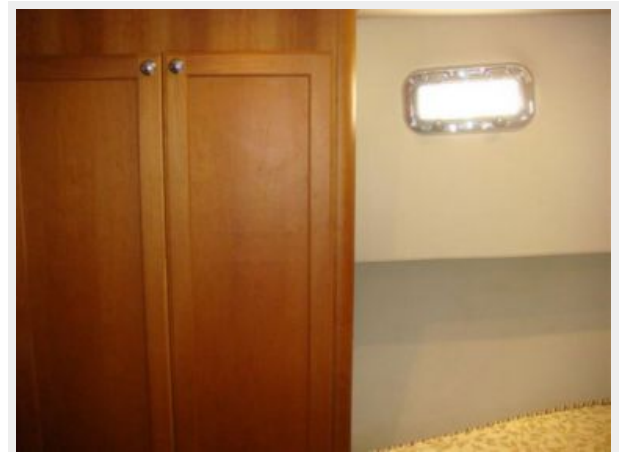
34' Mainship Master Stateroom Port