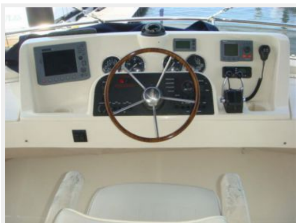
34' Mainship Flybridge Helm