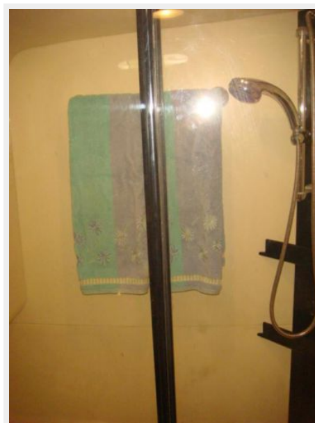
34' Mainship Shower