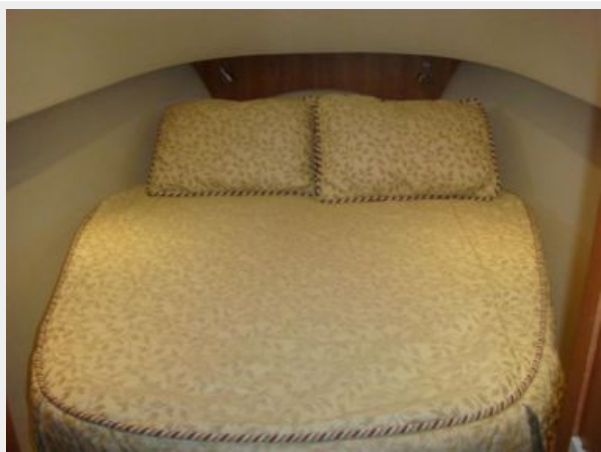
34' Mainship Master Stateroom