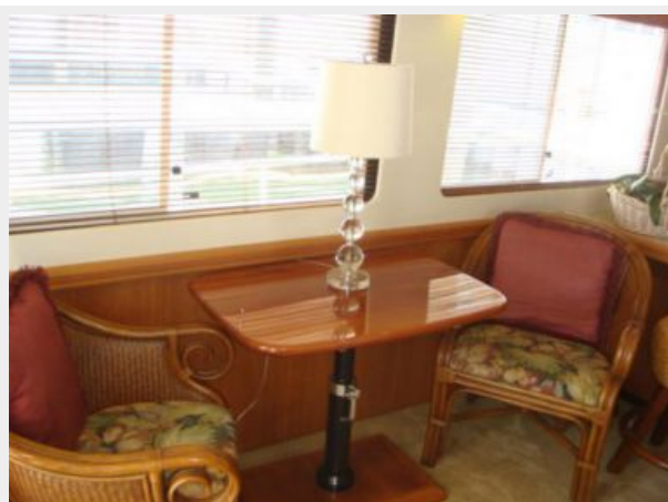
34' Mainship Salon Port