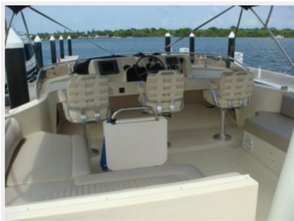
34' Mainship Flybridge Forward