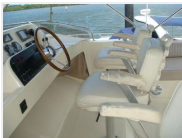
34' Mainship Flybridge Starboard