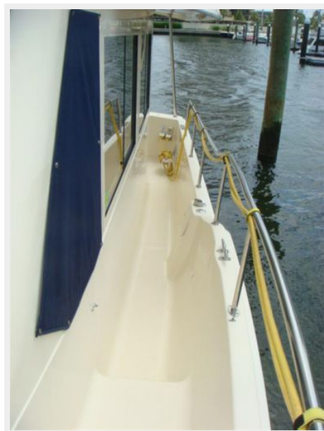
34' Mainship Port Side Deck photo2