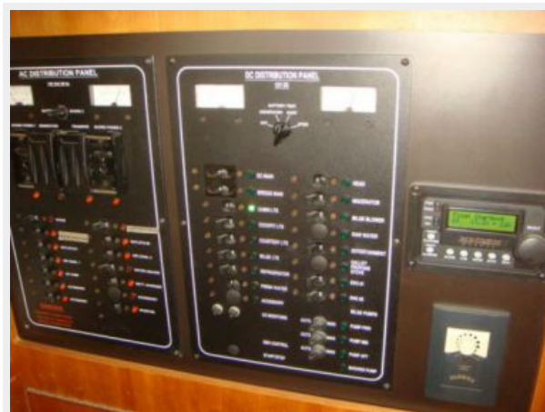
34' Mainship Electrical Panel