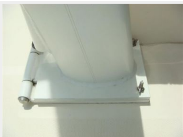
34' Mainship Mast Hinge