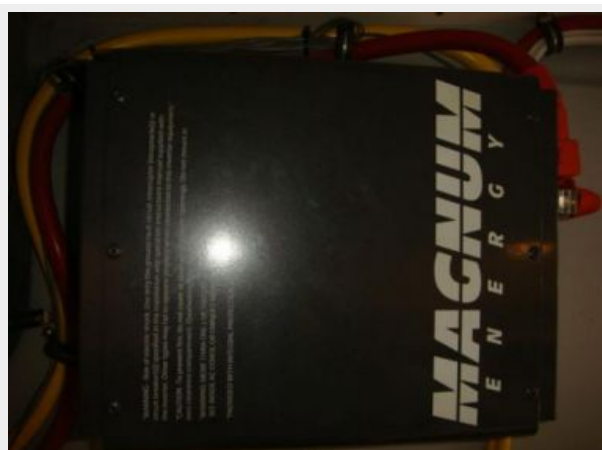
34' Mainship Inverter-Charger