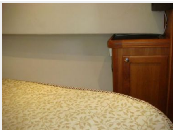
34' Mainship Master Stateroom Starboard