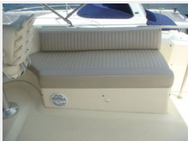
34' Mainship Flybridge Starboard Seating