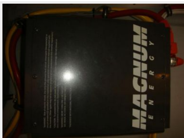
34' Mainship Inverter-Charger