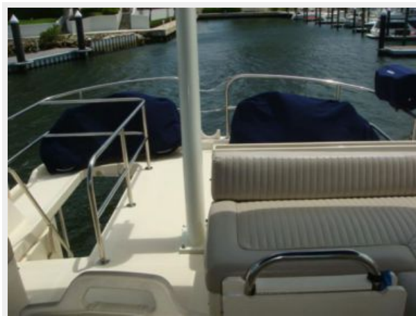
34' Mainship Flybridge Aft