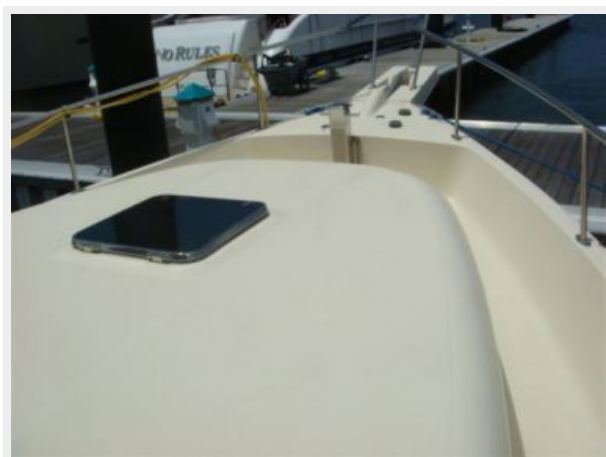
34' Mainship Foredeck