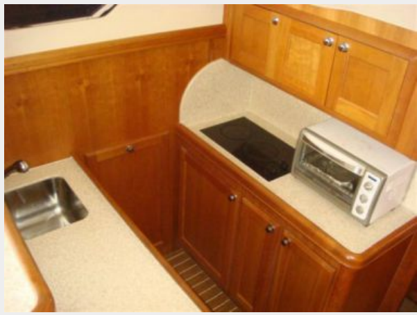
34' Mainship Galley photo1