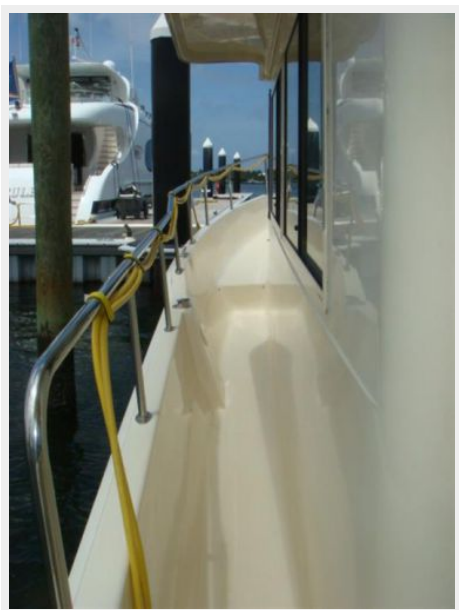
34' Mainship Port Side Deck photo1