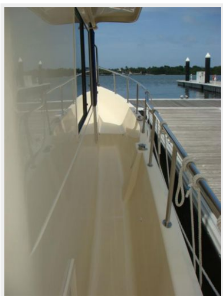
34' Mainship Starboard Side Deck photo1