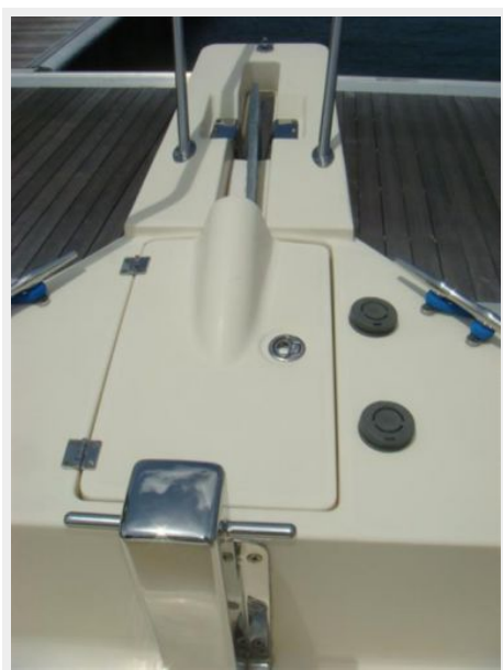
34' Mainship Anchor Windlass Covered