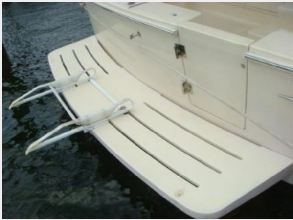
34' Mainship Swim Platform