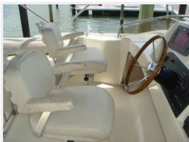
34' Mainship Flybridge Port