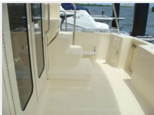
34' Mainship Aftdeck Starboard