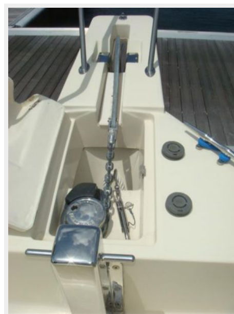
34' Mainship Anchor Windlass Uncovered