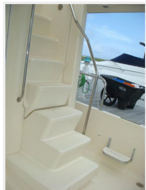
34' Mainship Flybridge Stairs