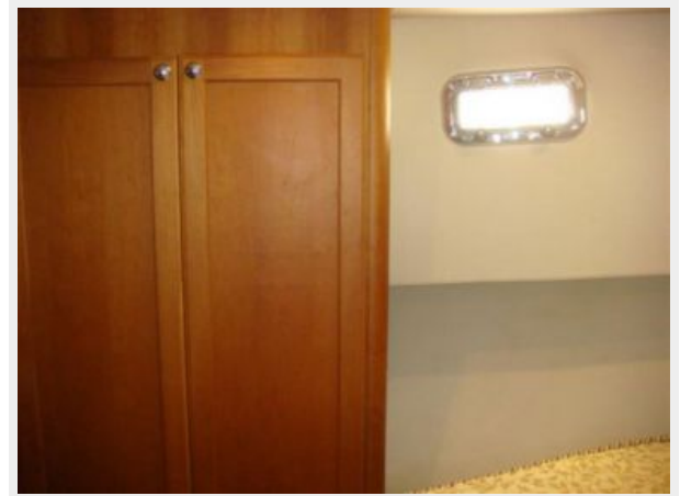
34' Mainship Master Stateroom Port