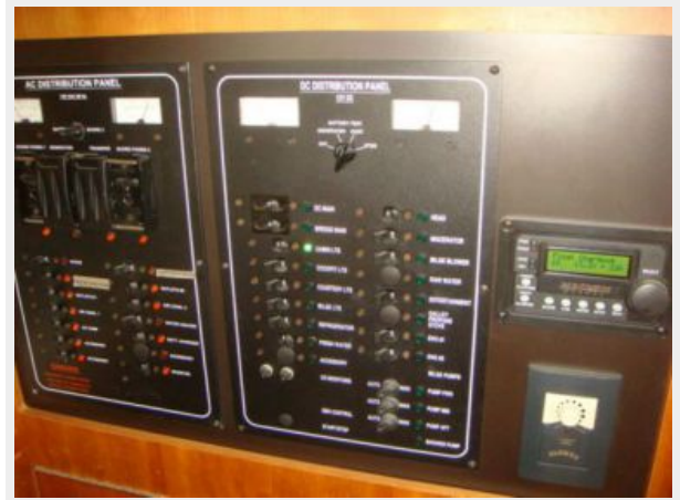
34' Mainship Electrical Panel