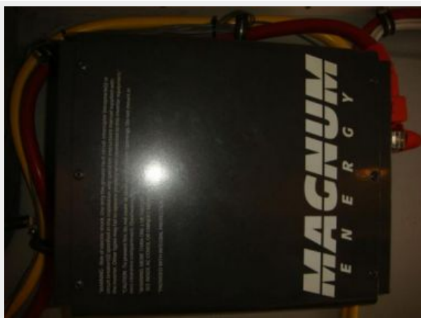
34' Mainship Inverter-Charger