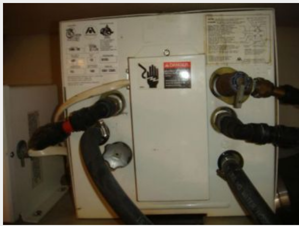
34' Mainship Water Heater