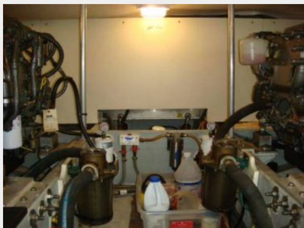
34' Mainship Engine Room Forward