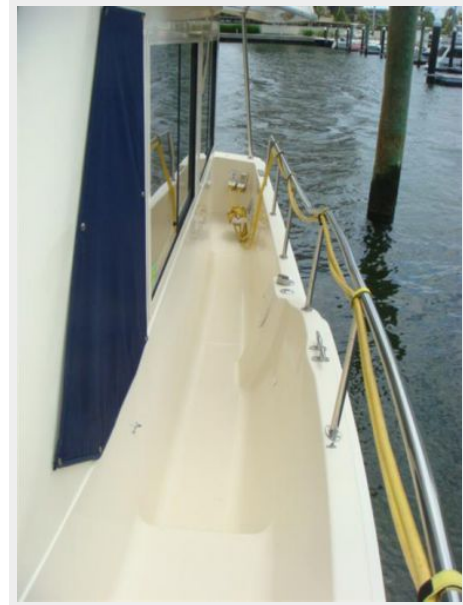
34' Mainship Port Side Deck photo2