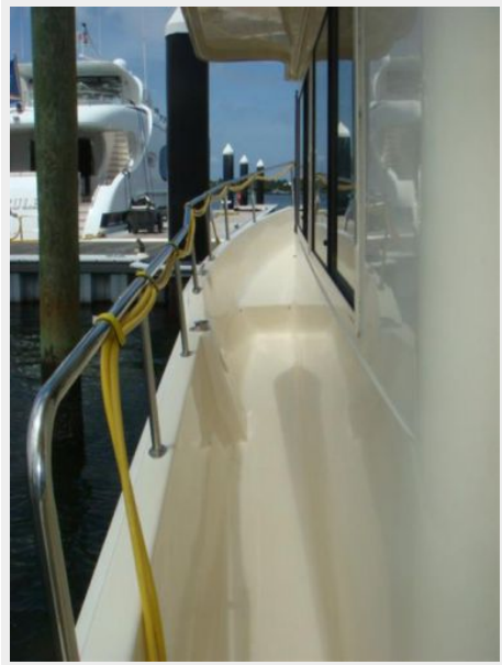
34' Mainship Port Side Deck photo1