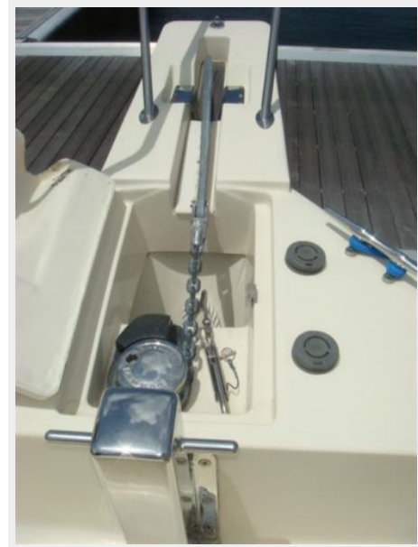
34' Mainship Anchor Windlass Uncovered