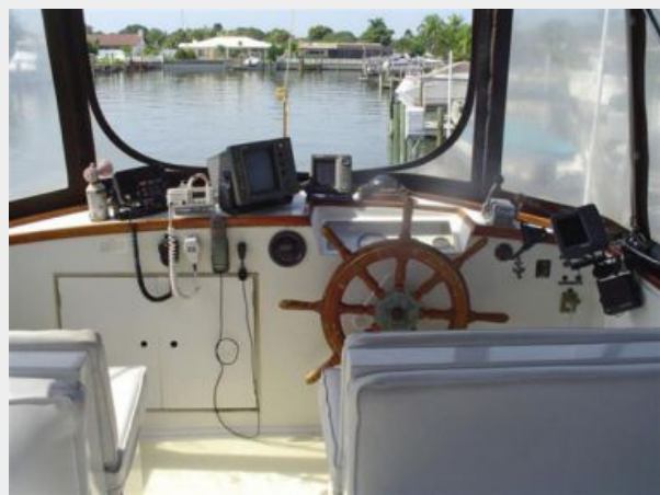
Flybridge Seating for at least 8 adults