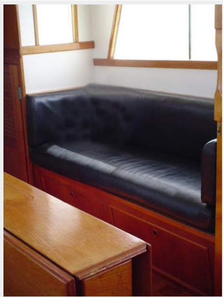
Main Salon Portside Settee w/New Upholstery