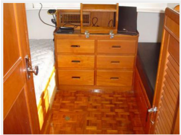
Aft Stateroom Drawer Storage, Hanging Locker to Port, Ensuite Head to Starboard