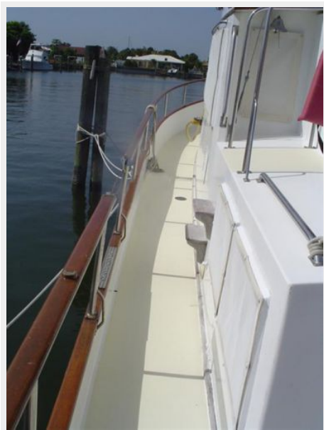
Wide Side Decks, Newly Painted