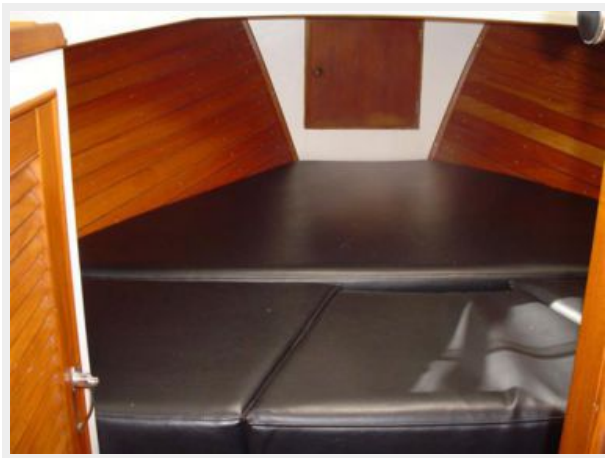
Forward Guest Stateroom