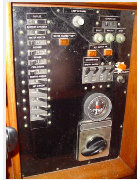
AC Electrical Panel