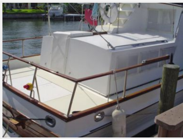
Aft Deck and Cockpit