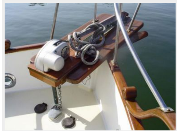
NEW Maxwell Windlass w/foot pedals/flybridge remote (2015)