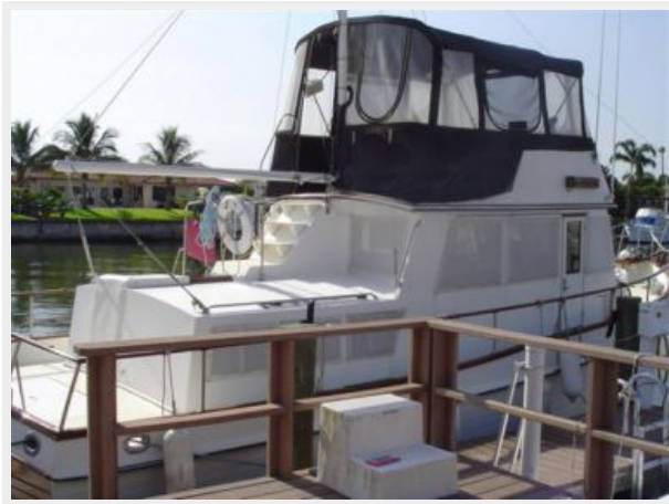
Starboard Stern View