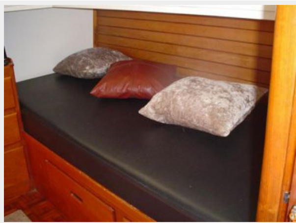
Aft Master Stateroom Portside Settee/Single Berth