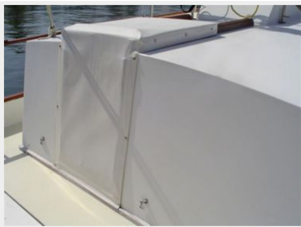
Companionway to Aft Stateroom from Aft Deck