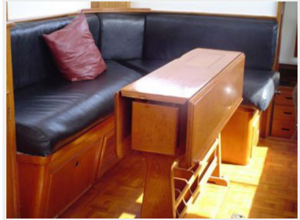
Main Salon Starboard with dinette table, L-shaped Sofa w/New Upholstery