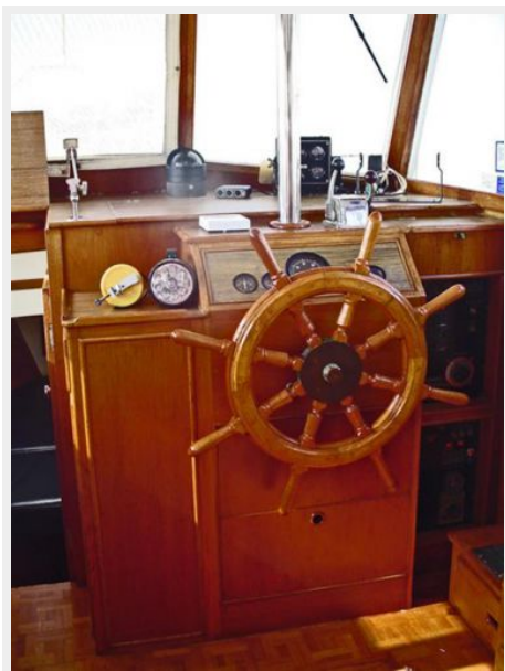
Lower Helm Station