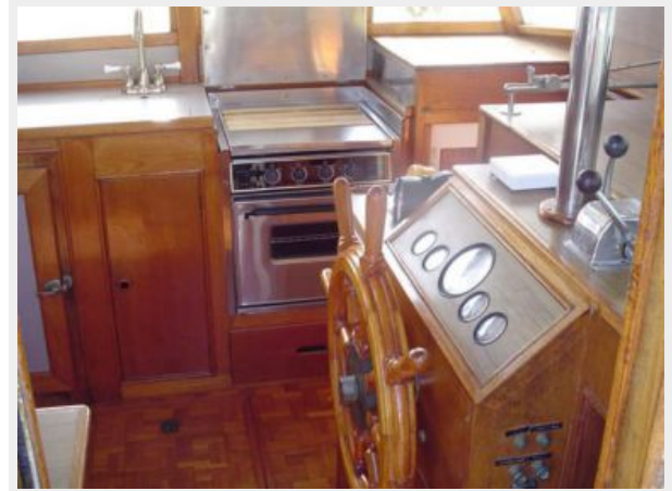
Galley to Port