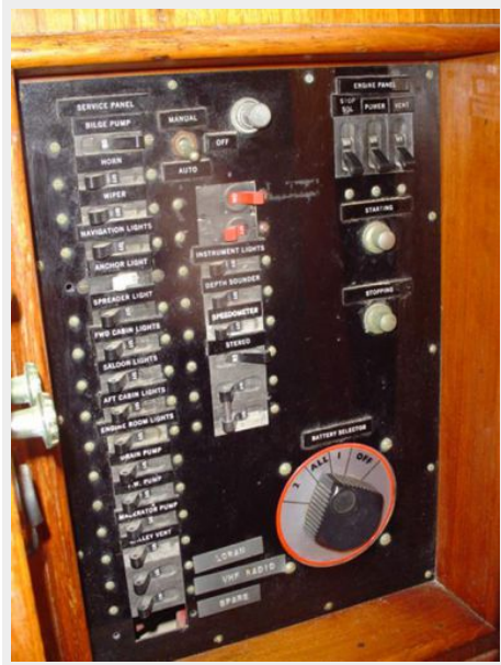
DC Electrical Panel