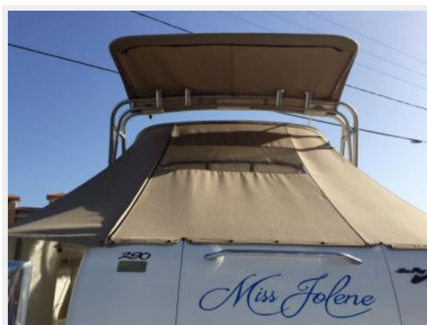
Like New Canvas