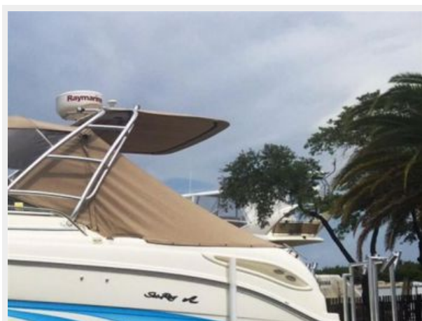
Custom Aft Canvas