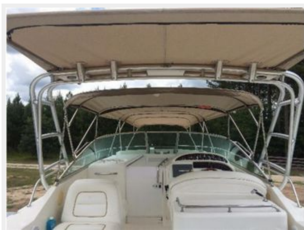
Lots of Shade