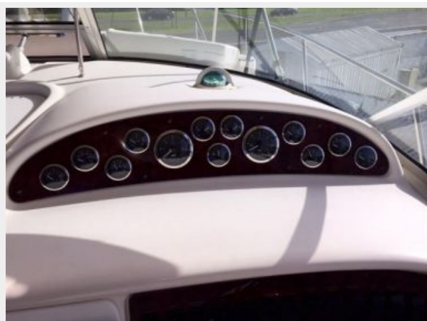
Like New Dash