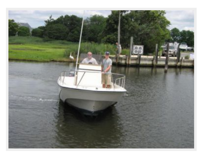
Center Console / Electronics & Navigation 1 Center Console / Electronics & Navigation 2 - Console & Leaning Post - Electronics