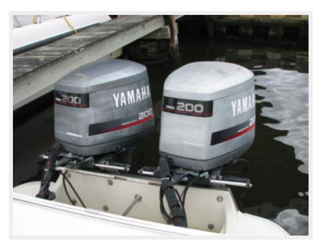
Engine & Mechanical Equipment - Motors