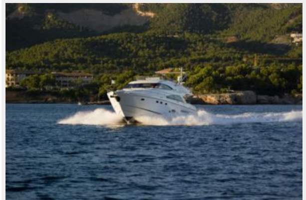
Fairline 65 Squadron G MARINE Exclusive Dealer Florida USA