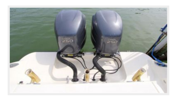
Yamaha 250 Four-Strokes W/250 Hours (Full Service June 2015)