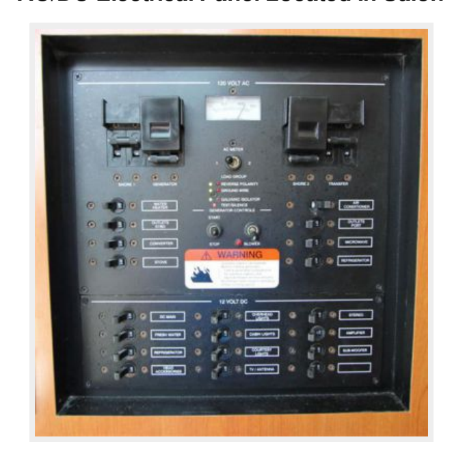
AC/DC Electrical Panel Located In Salon