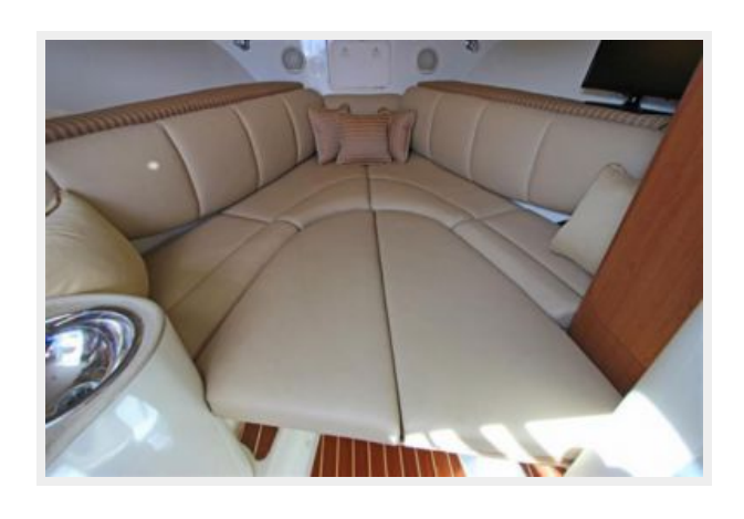
Forward V-Berth W/Filler Cushions Installed