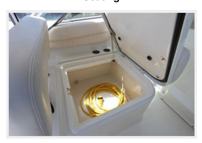
Huge Insulated Storage/Cooler In Port Helm Seating