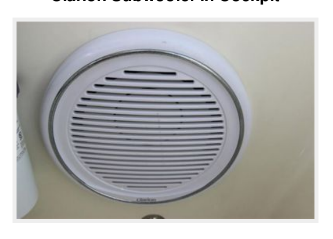
Clarion Subwoofer in Cockpit