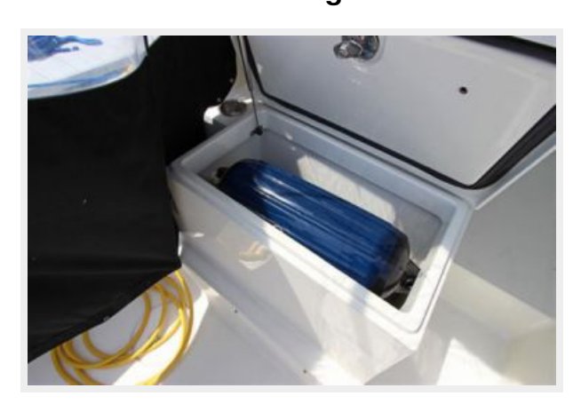
Insulated Storage/Cooler In Port Cockpit Seating