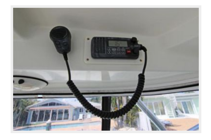
ICOM VHF Radio