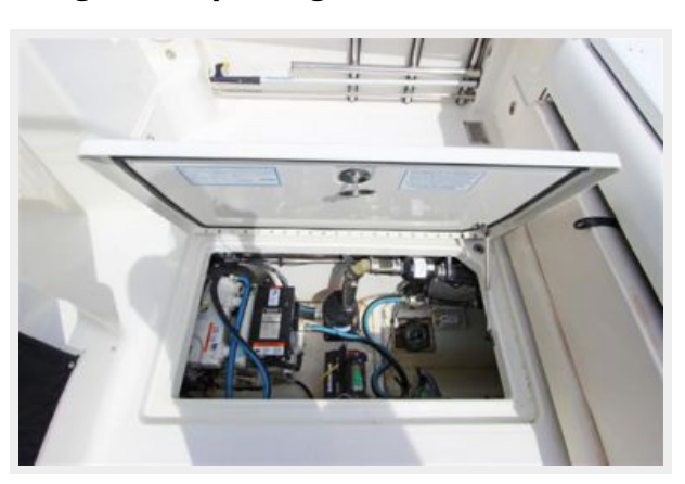
Large Cockpit Bilge/Generator Access