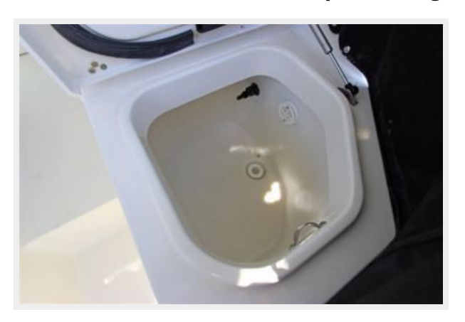
Live-Well In Starboard Cockpit Seating