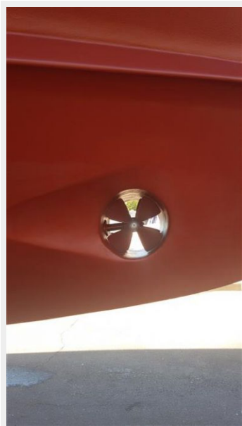
BOW THRUSTER FRESH BOTTOM PAINT 09.2015