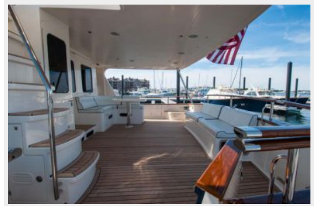
AFT DECK AND AFT DECK DAY HEAD