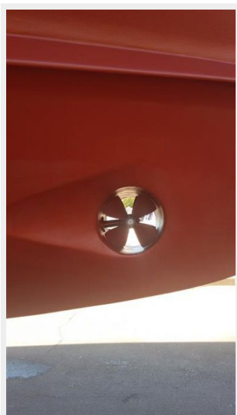
BOW THRUSTER FRESH BOTTOM PAINT 09.2015