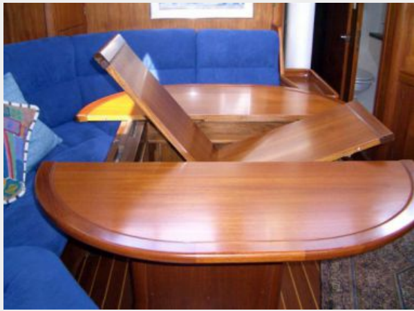
Saloon Table Leaf