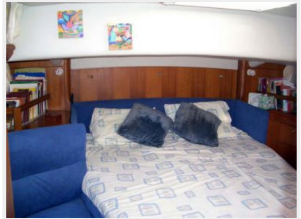
Owner's Aft Cabin