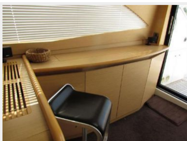
TV CABINET W/TV HIDDEN