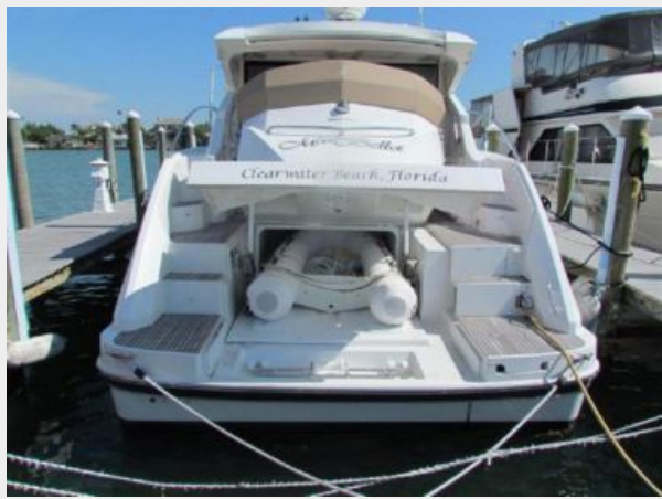
TRANSOM DINGHY GARAGE