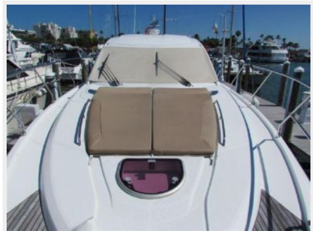
FOREDECK SUN PAD CUSHIONS