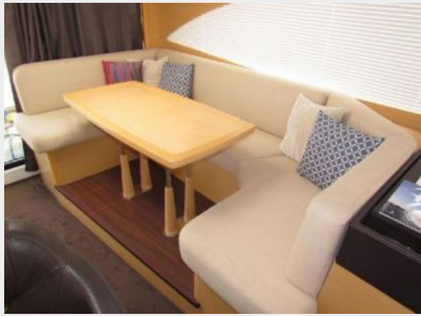
CUSTOM WOOD DINETTE TABLE