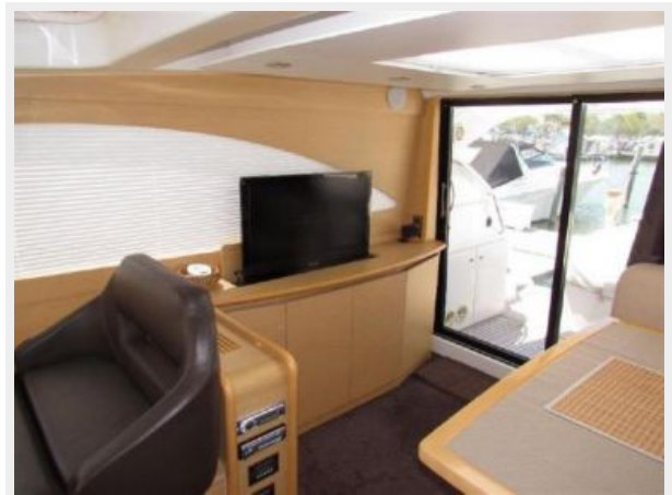
SALON STBD SIDE AFT/TV CABINET