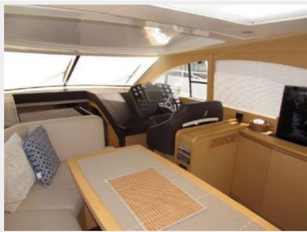
SALON STBD SIDE FWD