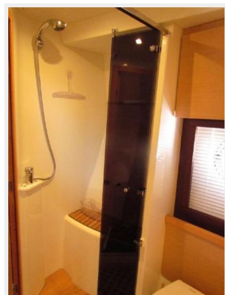
FWD HEAD SHOWER STALL