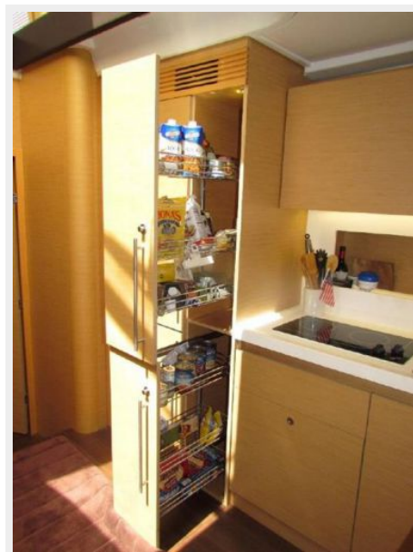
GALLEY DUAL "PULL OUT" PANTRY