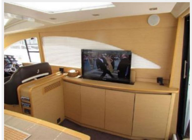
SALON STBD SIDE ENTERTAINMENT CENTER/CABINET