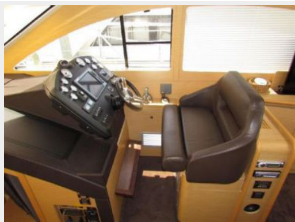
HELM CONTROLS & DOUBLE HELM SEAT