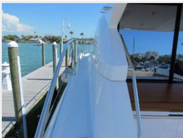
SIDE DECK PORT