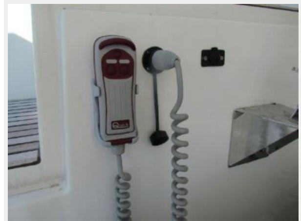
DINGHY WINCH CONTROL