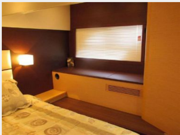
OWNER'S STATEROOM CUSTOM STORAGE- PORT OUTBOARD