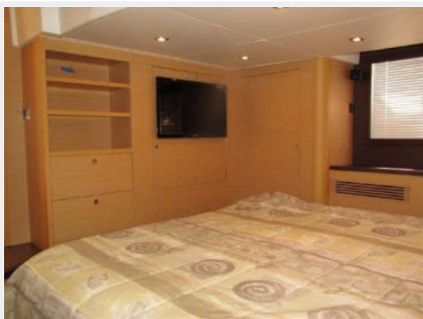
OWNER'S STATEROOM FWD- STARBOARD