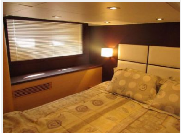
OWNER'S STATEROOM STORAGE- STARBOARD OUTBOARD