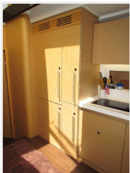
GALLEY UPPER REF/LOWER FREEZER