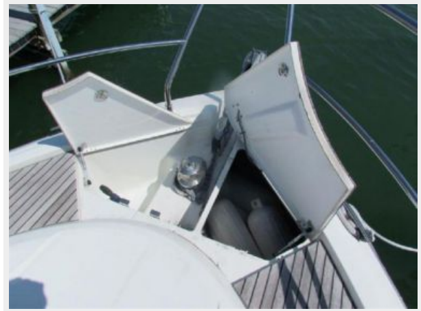
ANCHOR WELL & WINDLASS