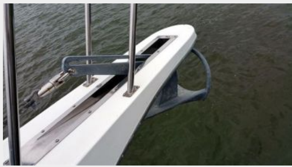
50' Navigator Bow Pulpit