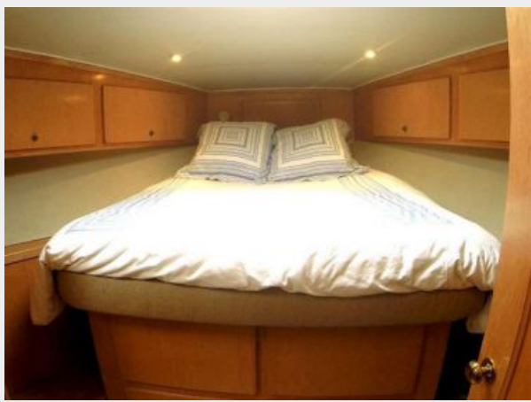
50' Navigator Forward Guest Stateroom