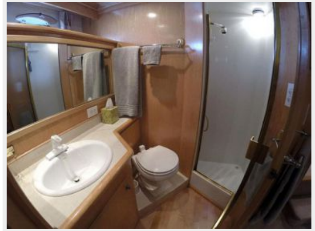
50' Navigator Port Guest Stateroom