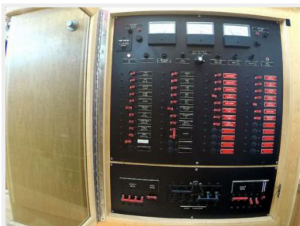
50' Navigator Electrical Panel