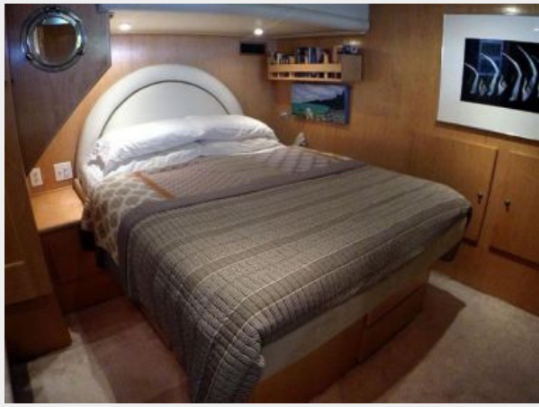
50' Navigator Master Stateroom