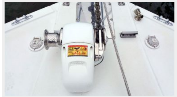
50' Navigator Anchor Windlass