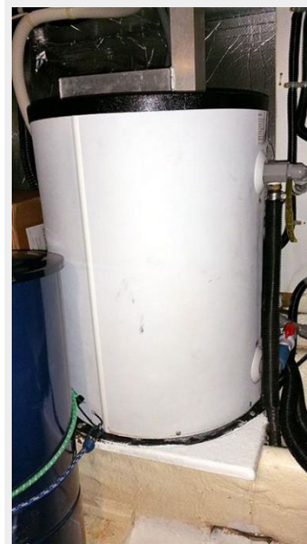
50' Navigator Hot Water Heater