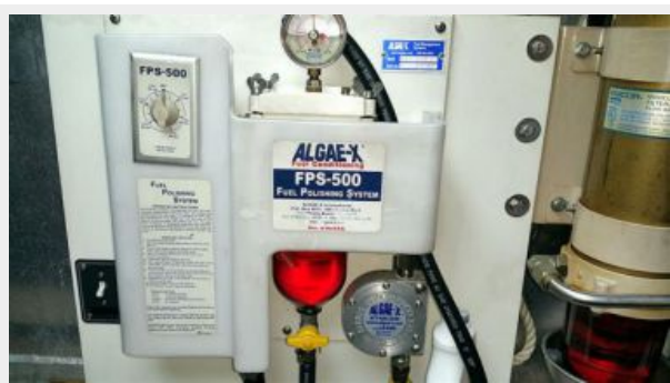
50' Navigator Fuel Polishing System