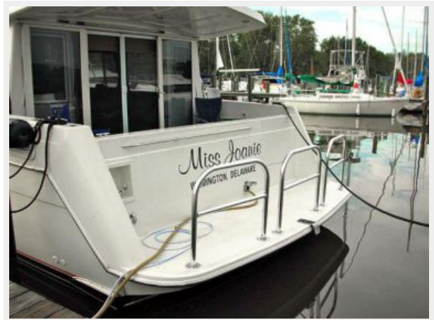
50' Navigator Swim Platform