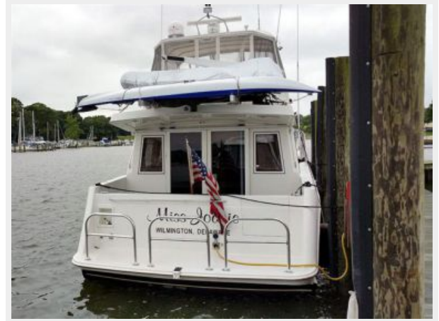
50' Navigator Aft Profile