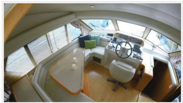
50' Navigator Pilothouse