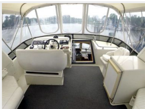
50' Navigator Flybridge Forward