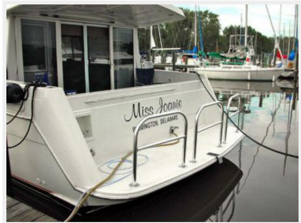
50' Navigator Swim Platform