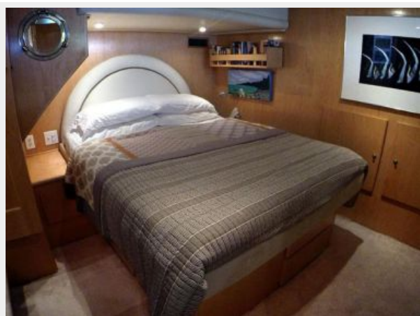
50' Navigator Master Stateroom