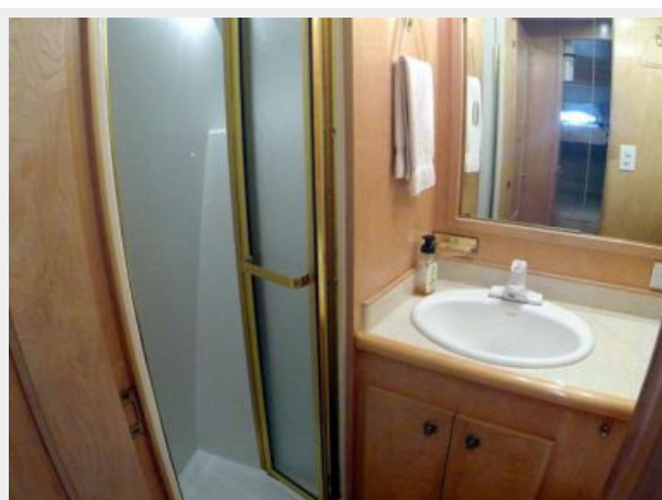
50' Navigator Guest Head