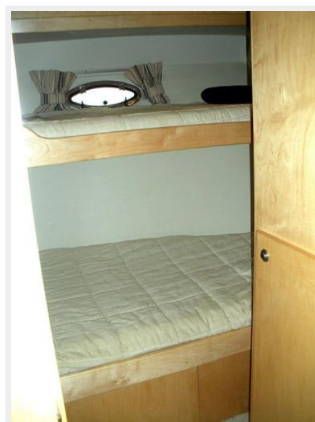
50' Navigator Port Guest Stateroom