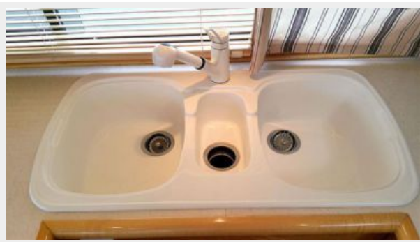
50' Navigator Galley Sink