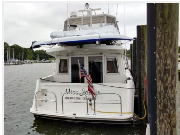
50' Navigator Aft Profile