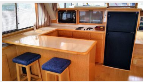
50' Navigator Galley Photo1