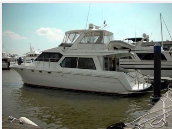
50' Navigator Port Aft Profile