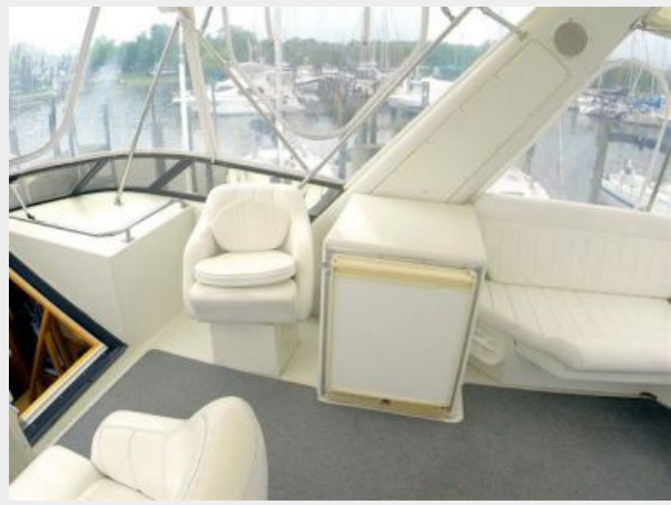
50' Navigator Flybridge Starboard