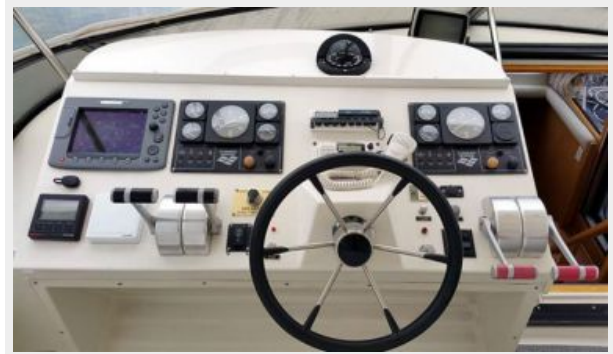
50' Navigator Flybridge Helm