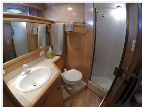
50' Navigator Port Guest Stateroom