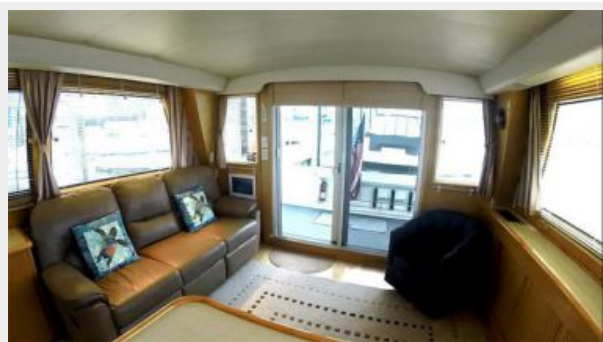
50' Navigator Salon Aft