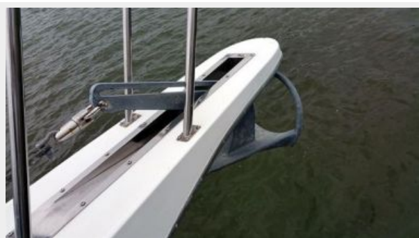
50' Navigator Bow Pulpit