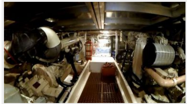
50' Navigator Port Racor Fuel Filters