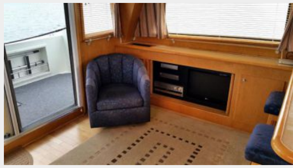
50' Navigator Salon Port Aft