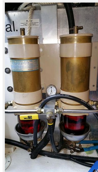
50' Navigator Port Racor Fuel Filters