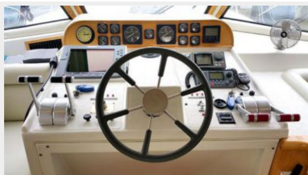
50' Navigator Pilothouse Helm