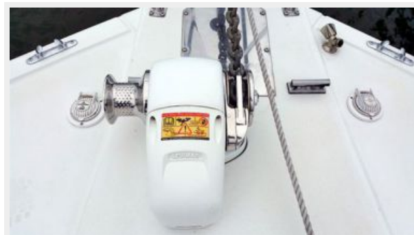
50' Navigator Anchor Windlass