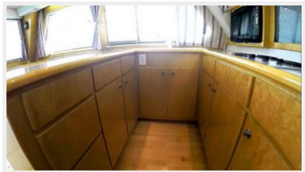
50' Navigator Galley Photo2