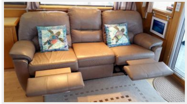
50' Navigator Salon Starboard Seating