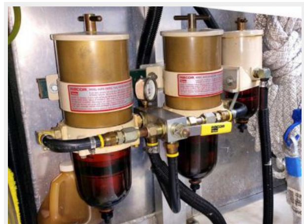
50' Navigator Starboard Racor Fuel Filters