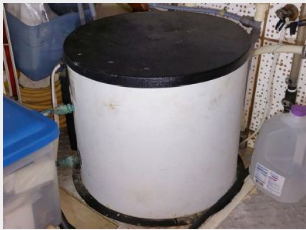
40' Albin Water Heater