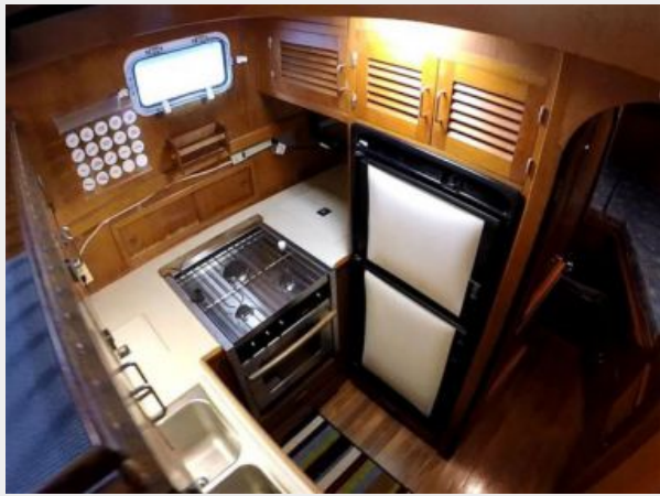
40' Albin Galley Photo1