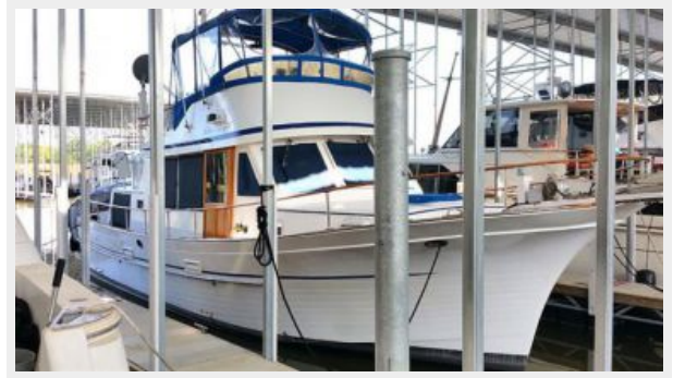
40' Albin Starboard Forward Profile