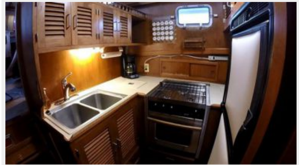
40' Albin Galley Photo2