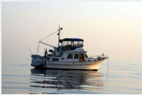
40' Albin Starboard Profile