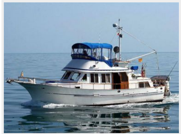
40' Albin Port Forward Profile Photo1