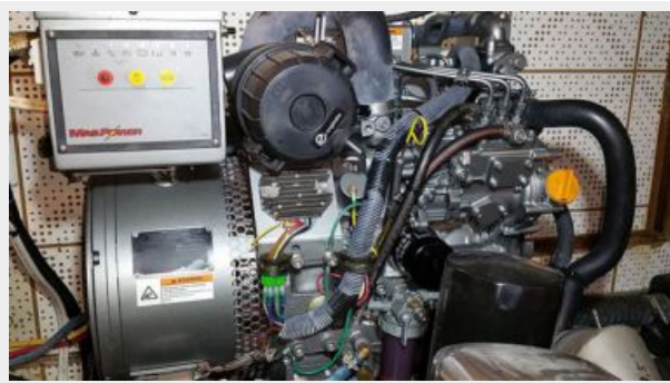
40' Albin Generator