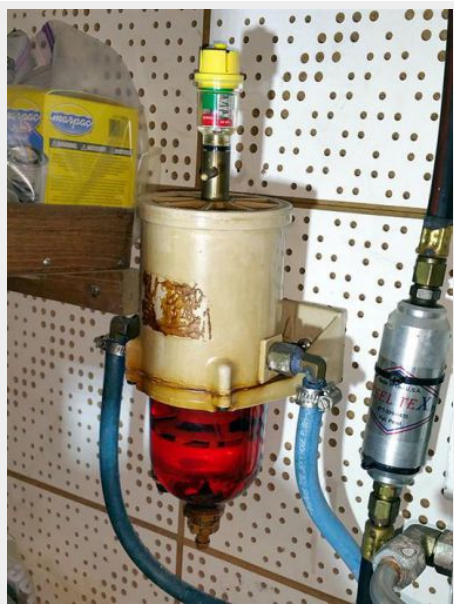
40' Albin Genset Racor Fuel Filter