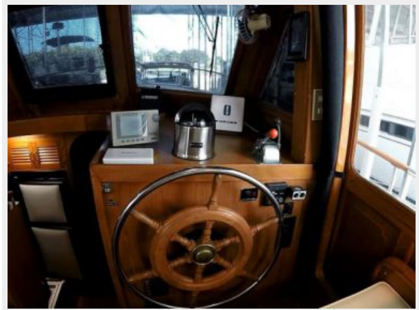
40' Albin Lower Helm Photo2