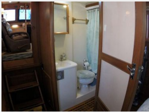
40' Albin Master Head