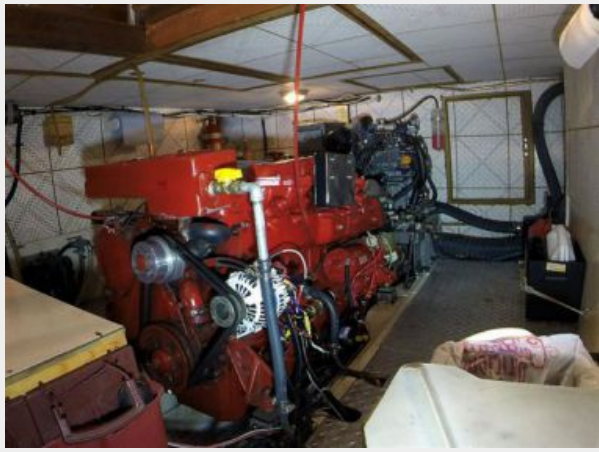
40' Albin Main Engine Photo2