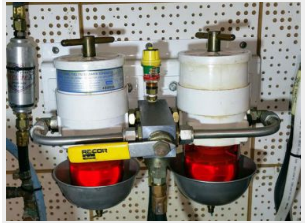
40' Albin Main Engine Racor Fuel Filters