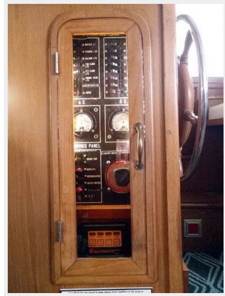
40' Albin Electrical Panel