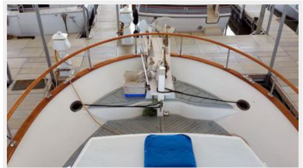
40' Albin Foredeck