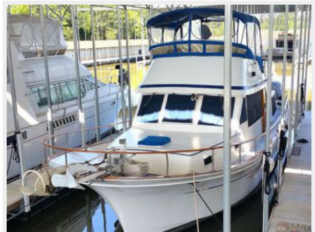
40' Albin Port Forward Profile Photo3