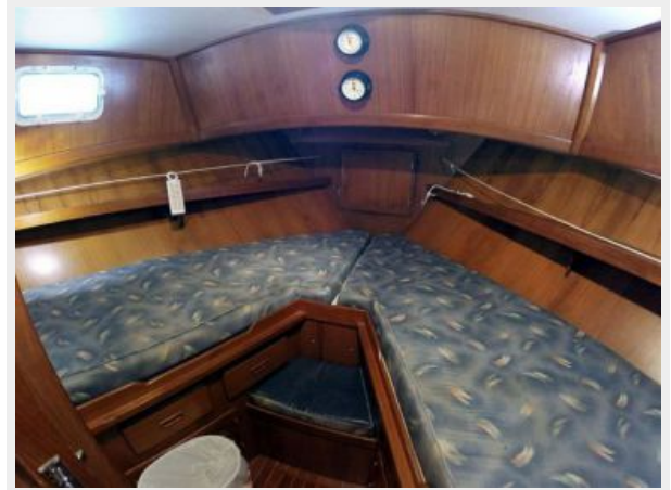
40' Albin Guest Stateroom