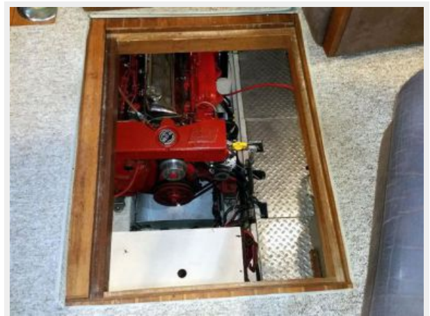
40' Albin Engine Room Access