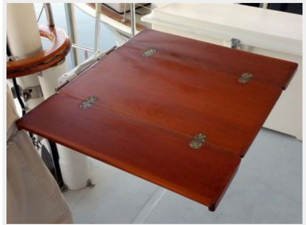
40' Albin Flybridge Table Photo2