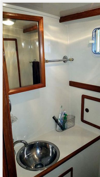
40' Albin Guest Head