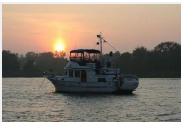
40' Albin Port Aft Profile Photo1