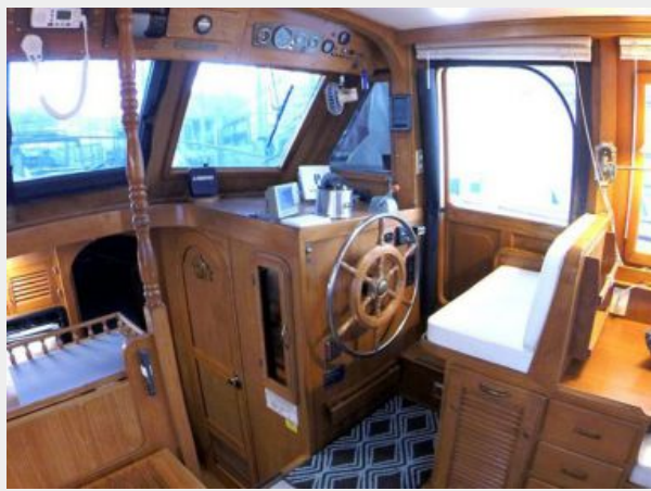
40' Albin Lower Helm Photo1