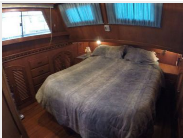
40' Albin Master Stateroom