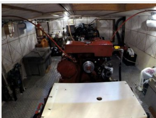
40' Albin Engine Room