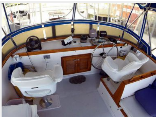
40' Albin Flybridge Forward