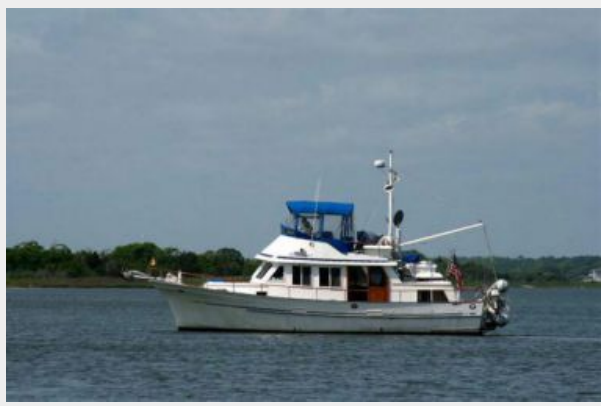
40' Albin Port Profile Photo2