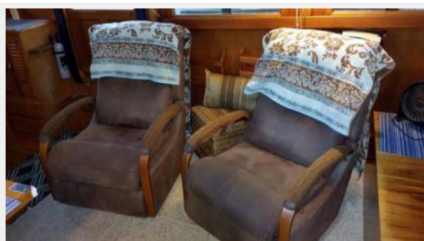
40' Albin Salon Recliners