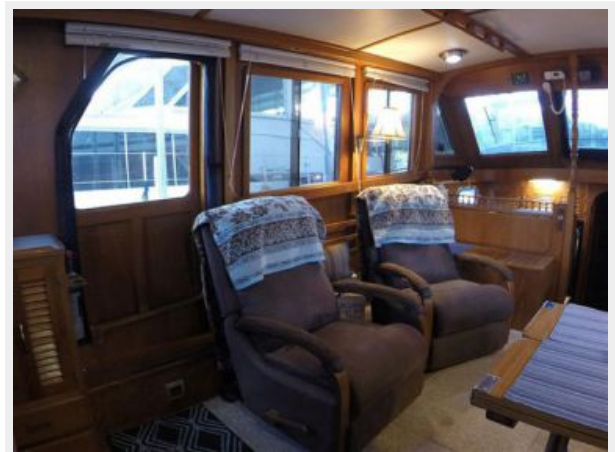
40' Albin Salon Port Forward