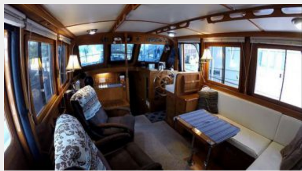
40' Albin Salon Forward