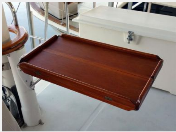
40' Albin Flybridge Table Photo1