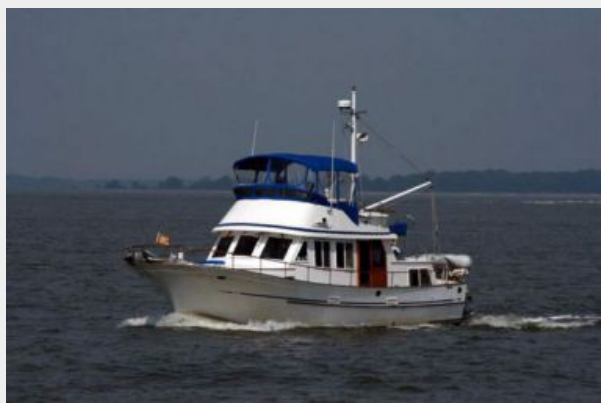
40' Albin Port Forward profile Photo2