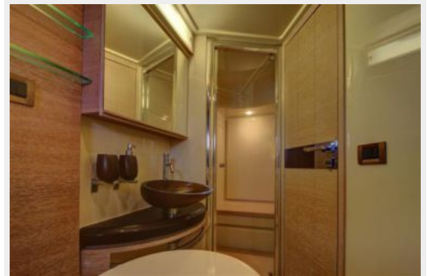
Master Stateroom Head