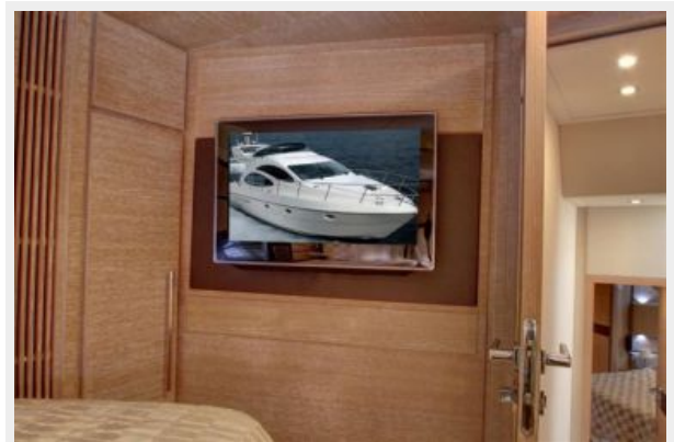
Forward Stateroom Entertainment