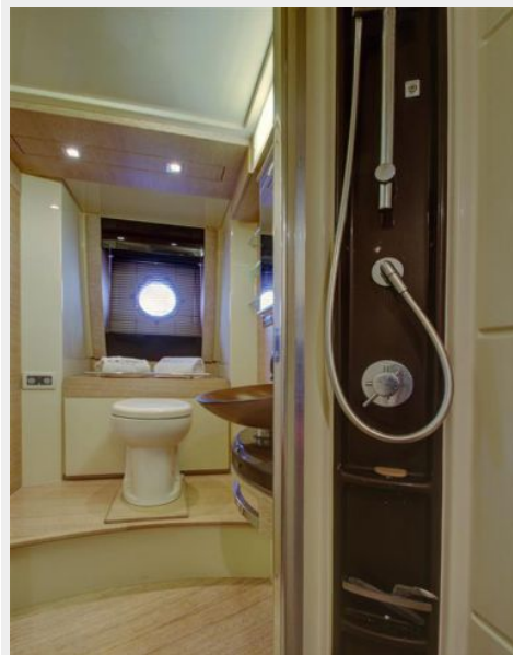
Master Stateroom Shower