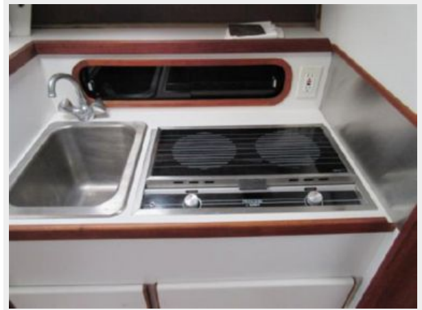
Tiara 31 Galley Photo3