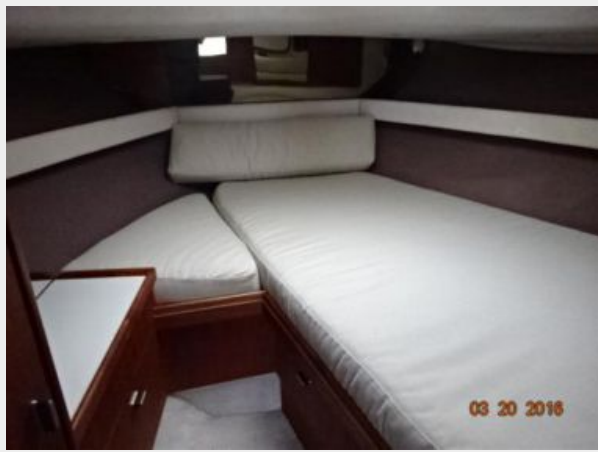
Tiara 31 Stateroom