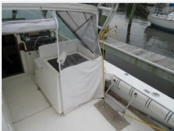
Tiara 31 Cockpit Starboard Forward