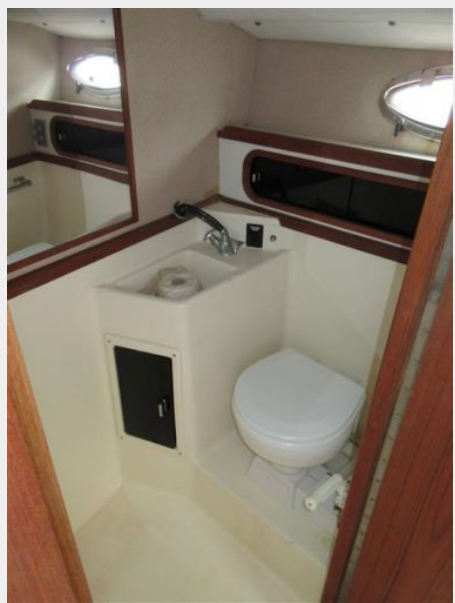
31' Tiara Head