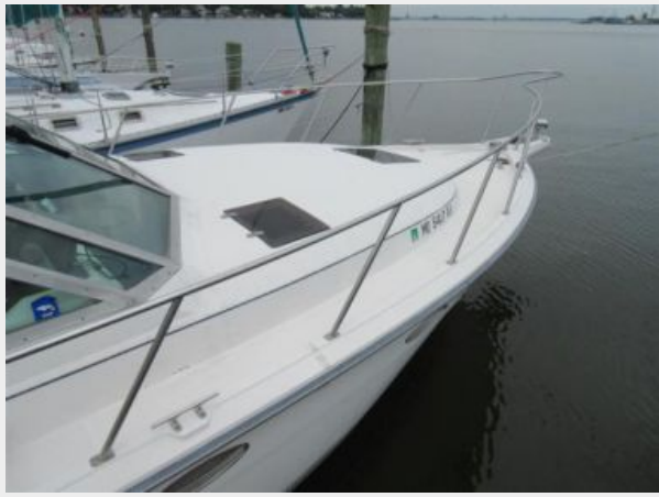
Tiara 31 Foredeck