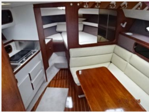
Tiara 31 Salon Forward