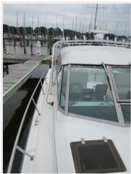
Tiara 31 Port Side Deck