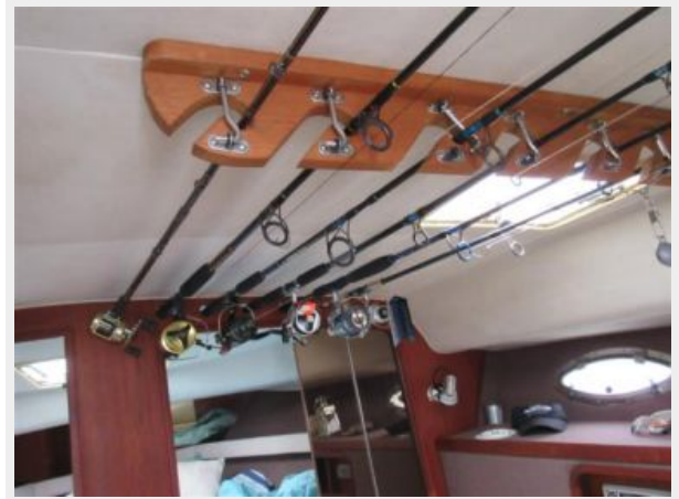
Tiara 31 Overhead Rod Storage