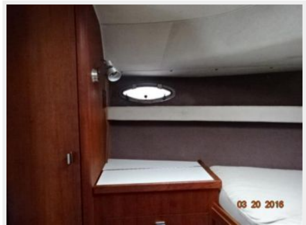
Tiara 31 Stateroom Port