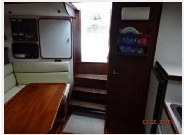
Tiara 31 Salon Aft