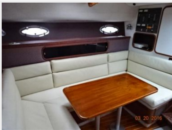
Tiara 31 Salon Starboard Photo1