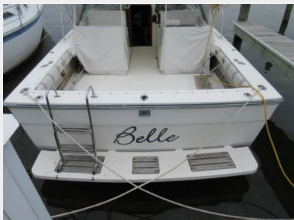
31' Tiara Cockpit