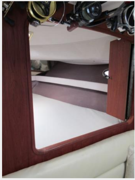
Tiara 31 Stateroom-Salon Window