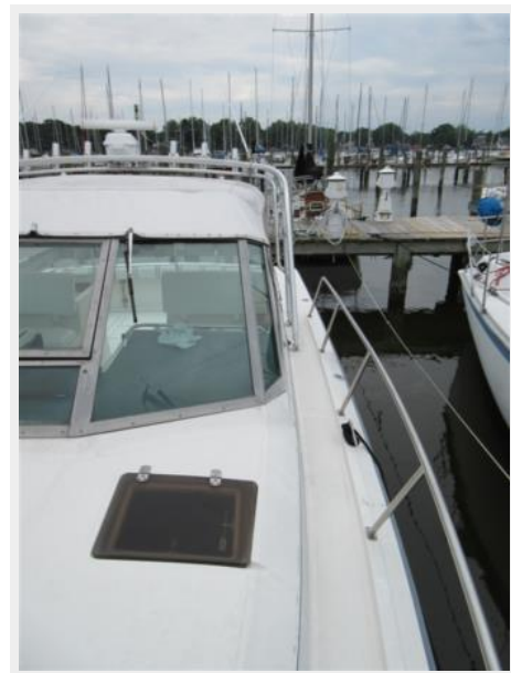
Tiara 31 Starboard Side Deck