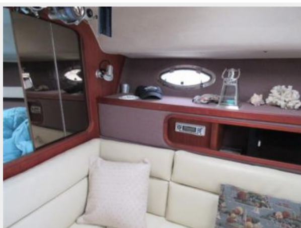
Tiara 31 Salon Starboard Forward