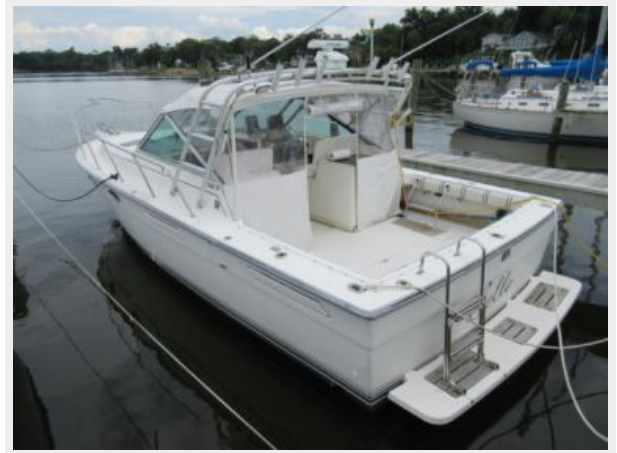
31' Tiara Port Aft Profile