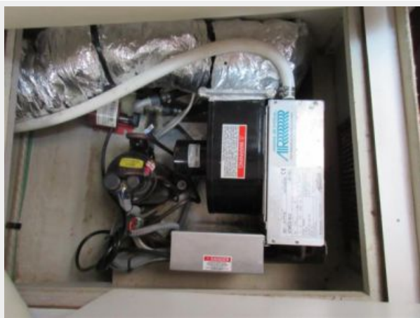
Tiara 31 Air Conditioning Unit