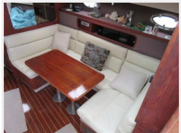
31' Tiara Salon