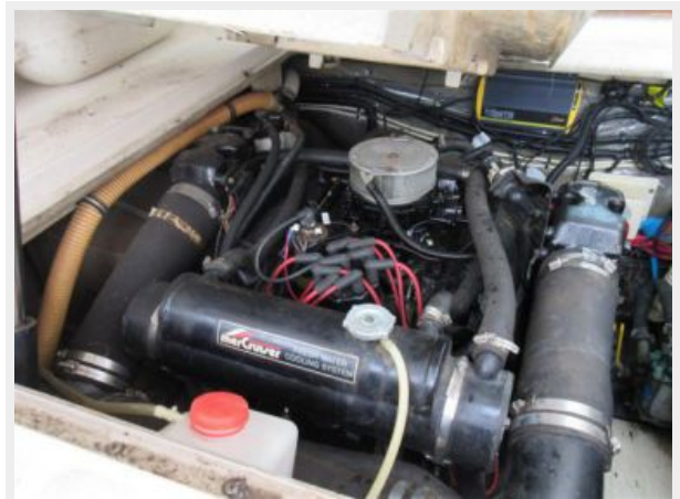
31' Tiara Port Main Engine