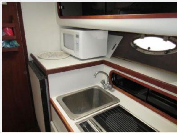
31' Tiara Galley