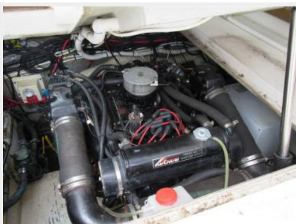
31' Tiara Starboard Main Engine