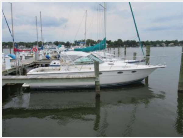
Tiara 31 Starboard Profile Previous Next