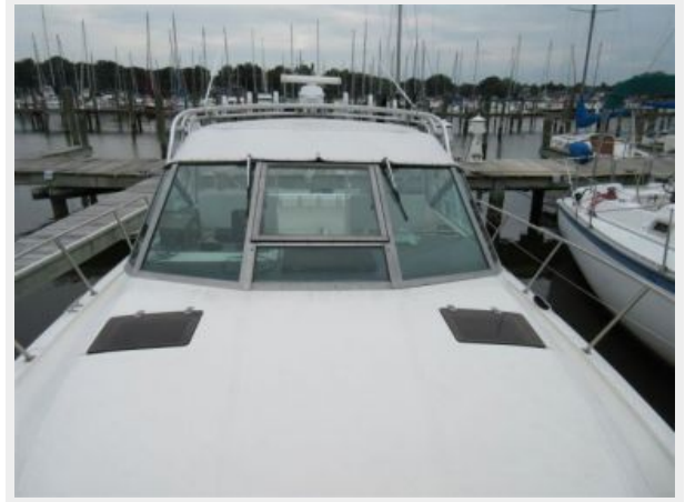
31' Tiara Foredeck Aft