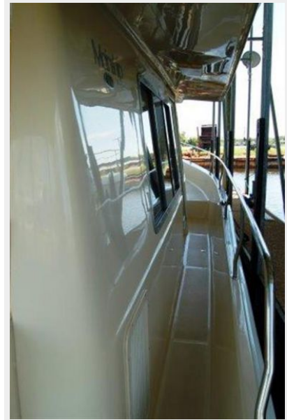
Decks - Starboard Shine