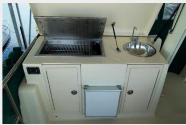
Flybridge Wet Bar