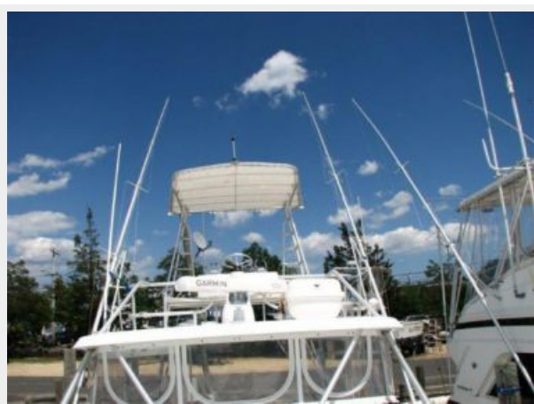
Deck 1 - Tower