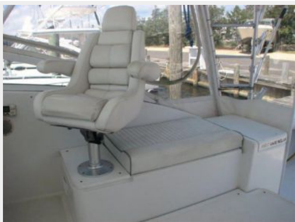
Deck 7 - Starboard Seating