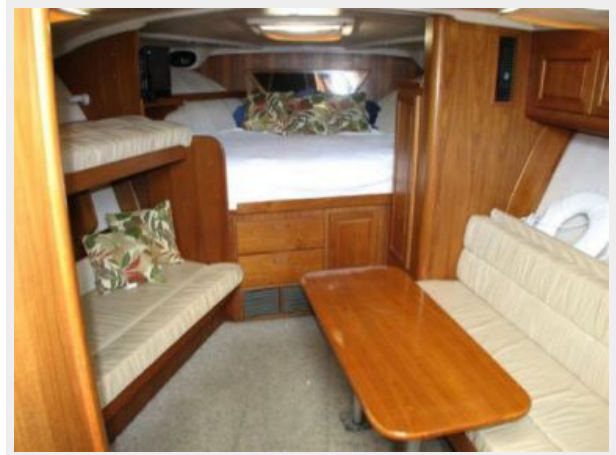
Main Cabin 2