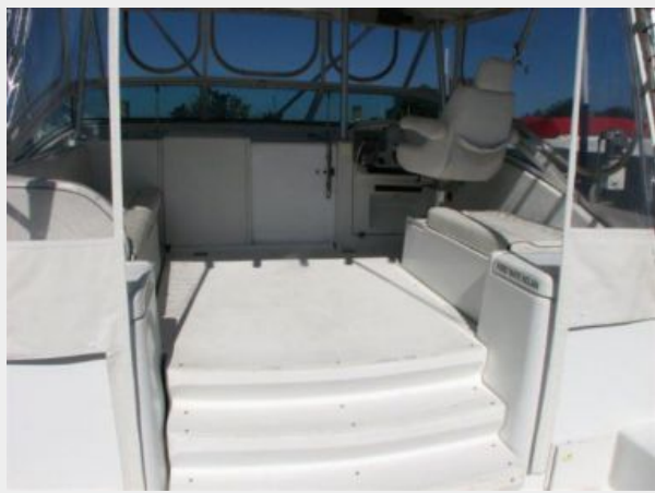
Deck 5 - Helm Deck