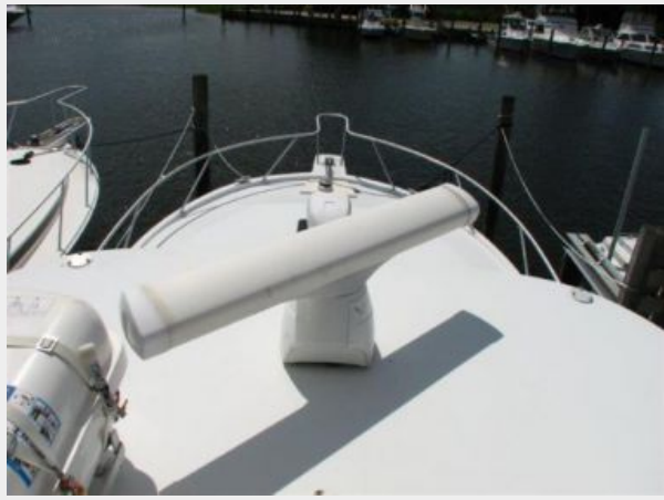
Deck 3 - View Forward From Tower