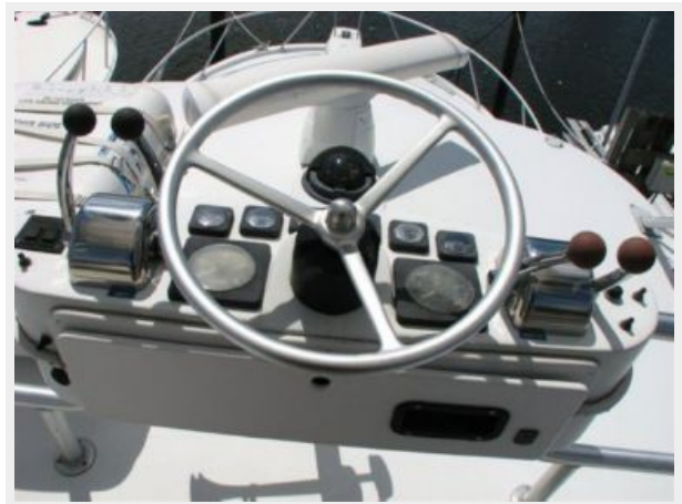
Helm / Electronics & Navigation 3 - Tower Helm