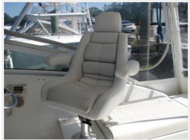
Deck 6 - Helm Seat