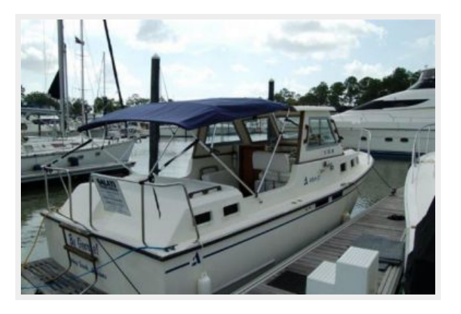
Starboard Profile at Dock