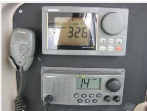
Autopilot & VHF on Lower Helm