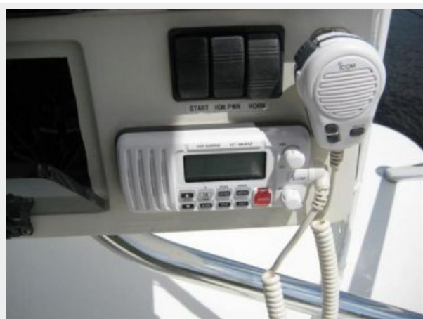
VHF on Tower