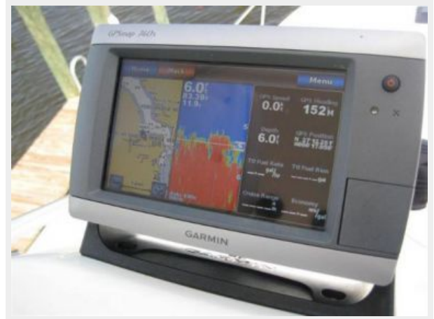
Garmin on Tower