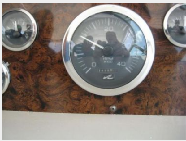
Port Engine Tach/Hours