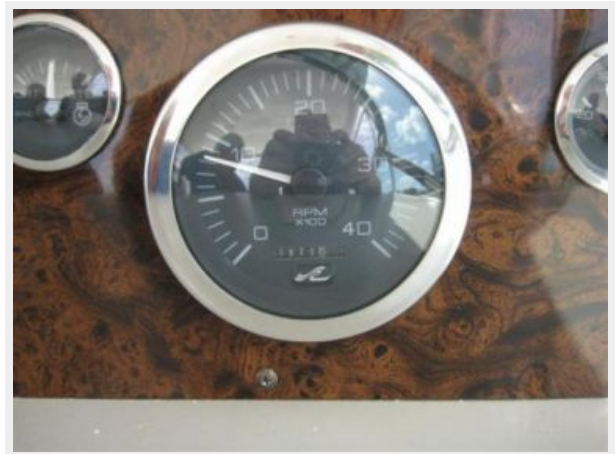
Starboard Engine Tach/Hours