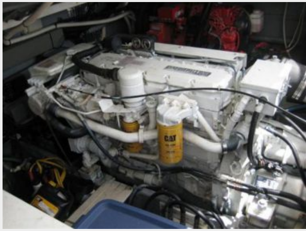
Starboard CAT 3116