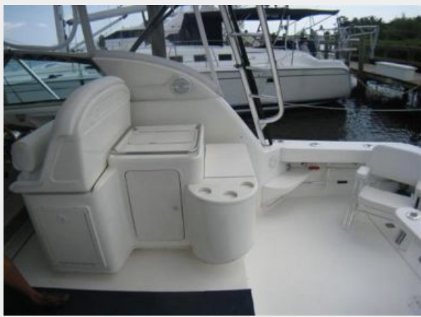
Bait Prep Station