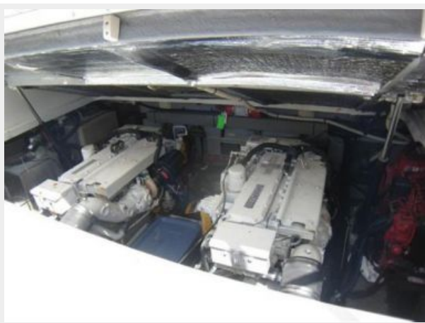
Power Bridgedeck Lift