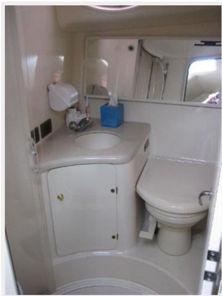
Head with Shower Stall