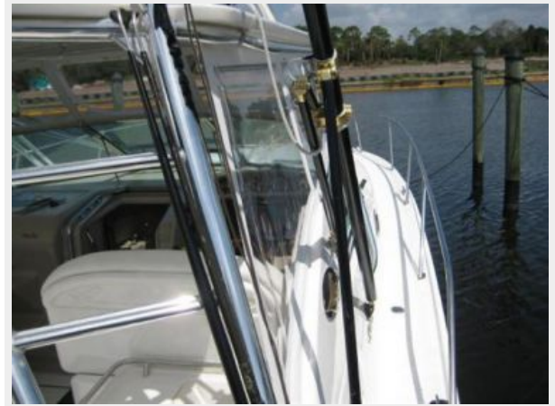
Starboard Side Deck