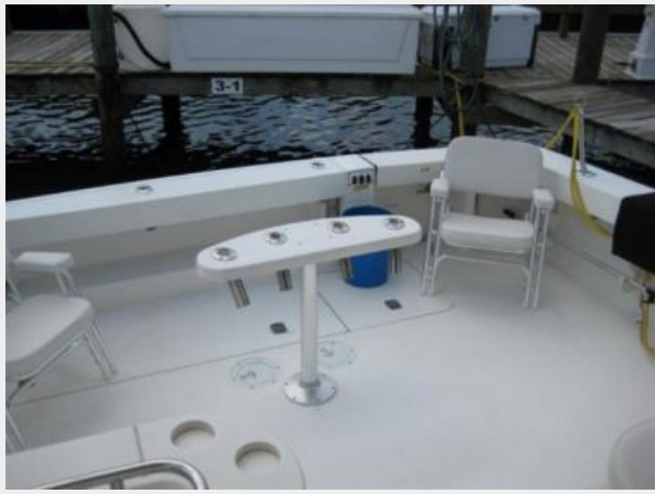
Cockpit to aft