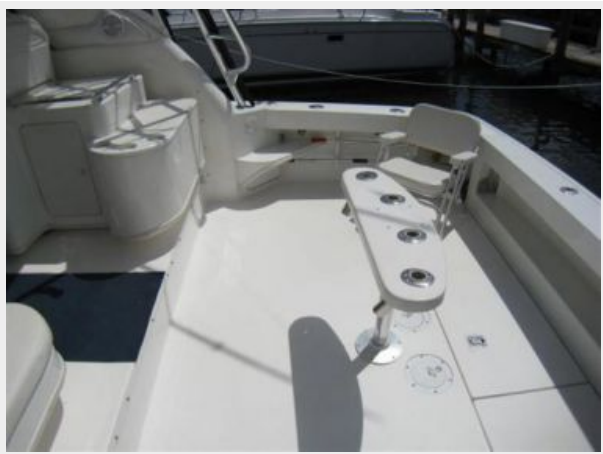
Cockpit to starboard