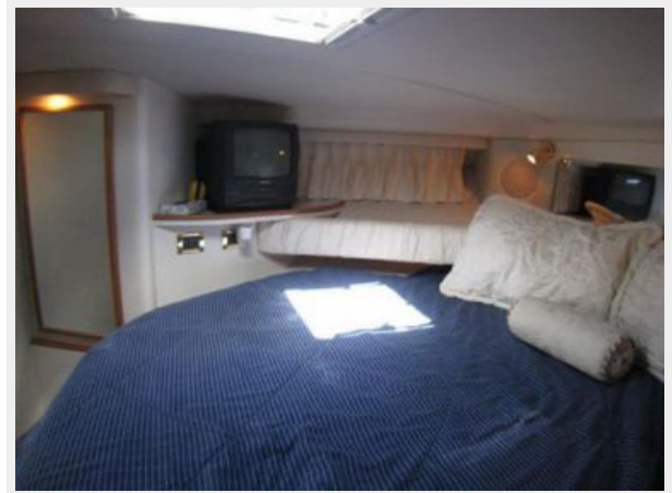
MSR to port