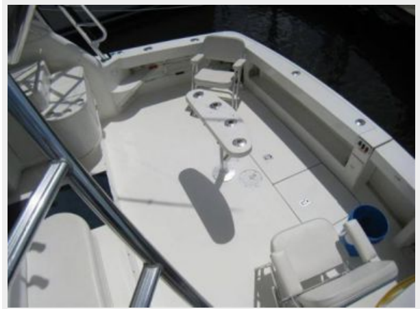
Cockpit to starboard