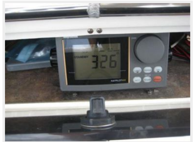
Autopilot on Tower