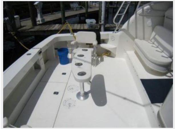
Cockpit to port