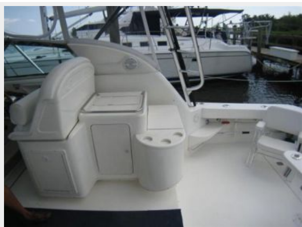
Bait Prep Station