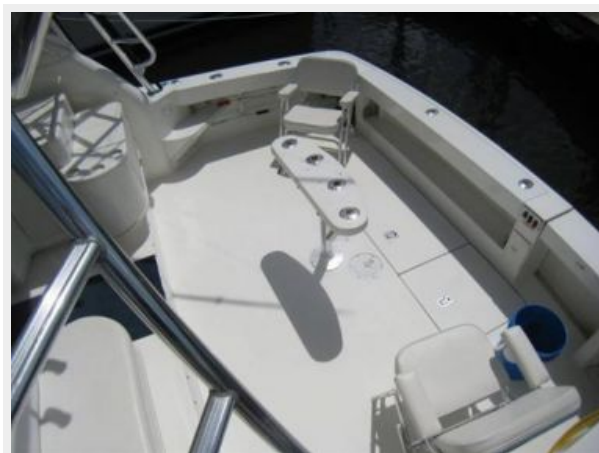
Cockpit to starboard