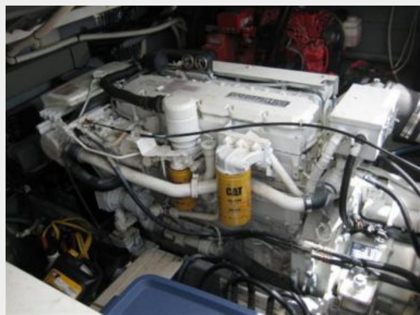
Starboard CAT 3116