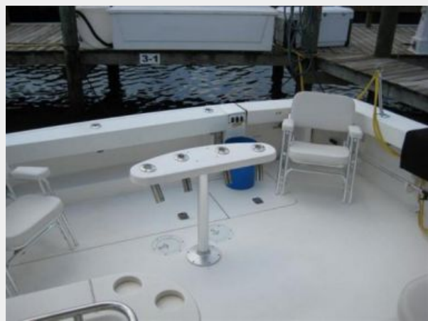
Cockpit to aft