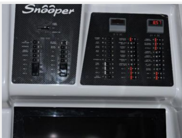
A/C + DC Panel