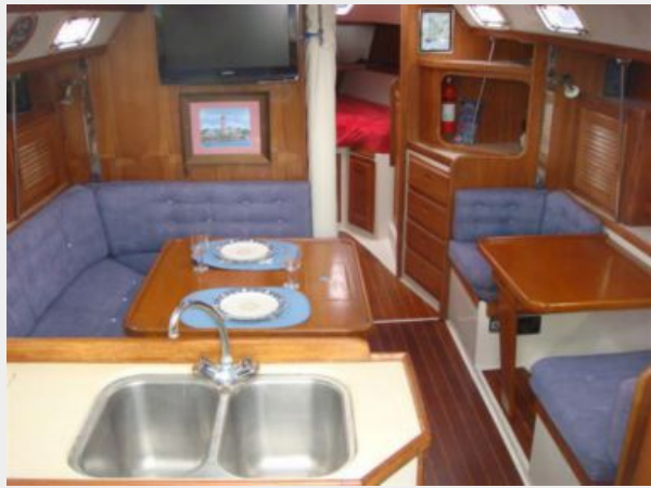
36' Catalina Salon Forward