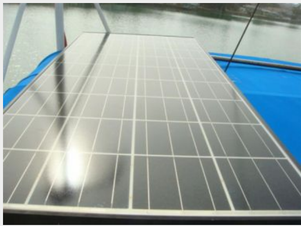
36' Catalina Starboard Solar Panel