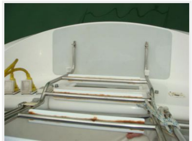
36' Catalina Swim Platform