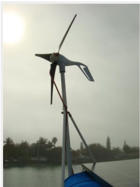
36' Catalina Wind Generator