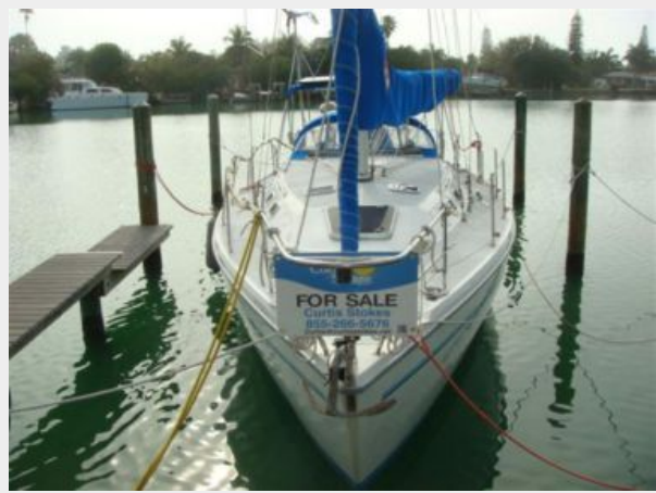
36' Catalina Forward Profile