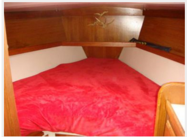
36' Catalina Guest Stateroom