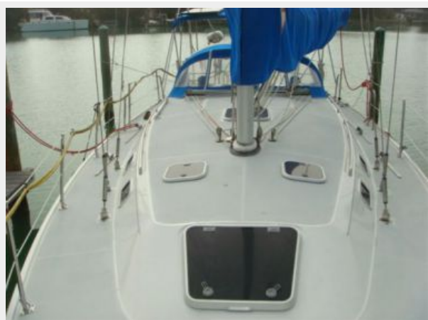
36' Catalina Foredeck Aft