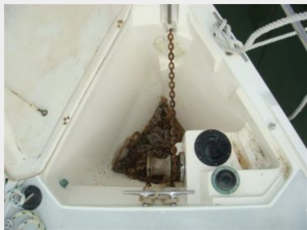
36' Catalina Anchor Windlass