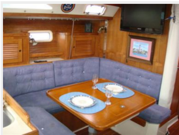
36' Catalina Salon Settee Photo2