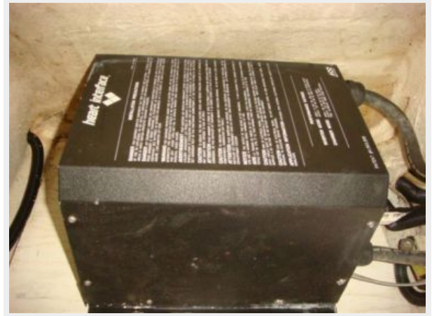
36' Catalina Inverter