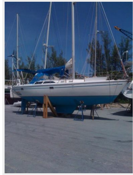
36' Catalina Hauled Out