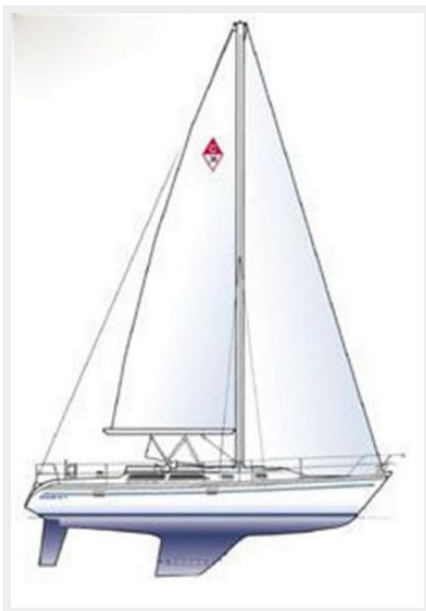
36' Catalina Sail Plan