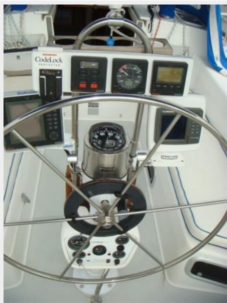
36' Catalina Cockpit Nav Pedestal