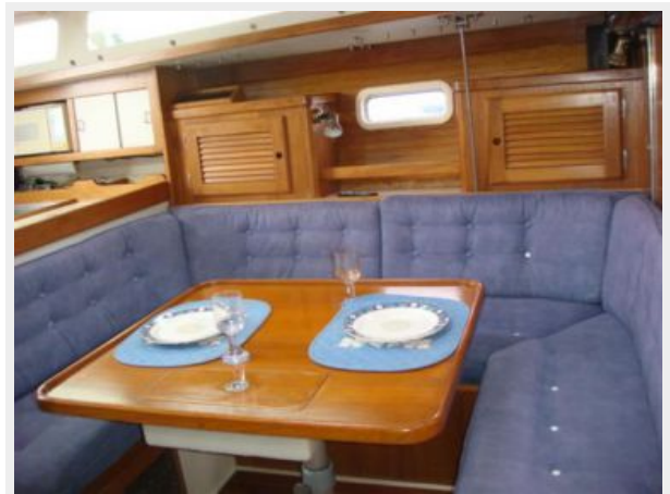
36' Catalina Salon Settee Photo1