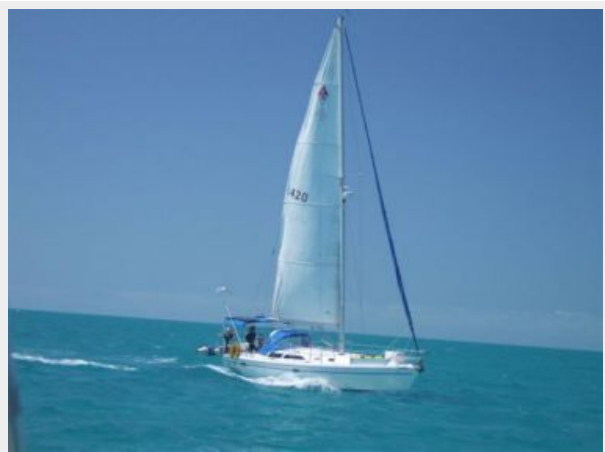
36' Catalina Underway