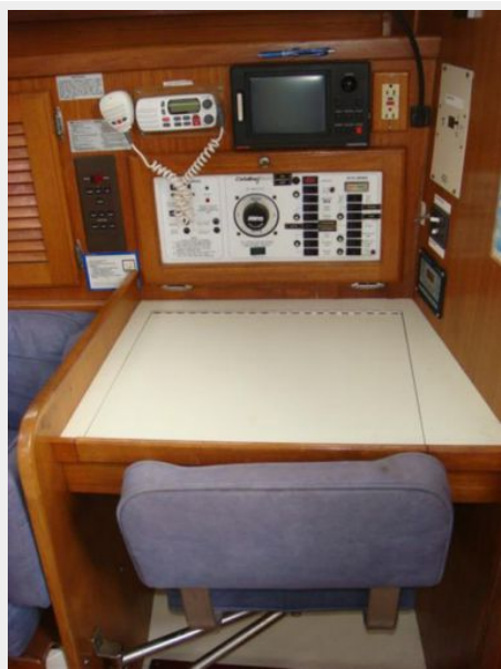
36' Catalina Nav Station