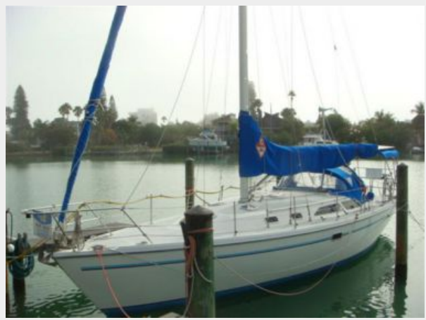
36' Catalina Port Forward Profile