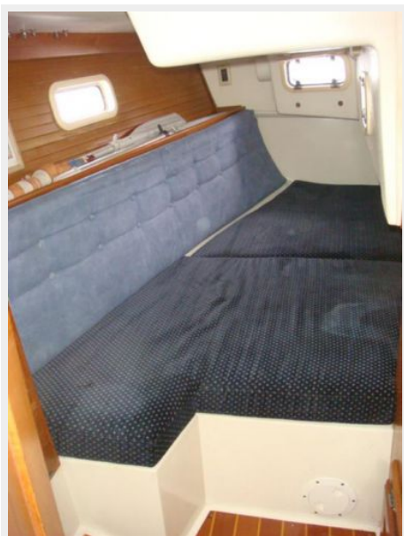
36' Catalina Master Stateroom