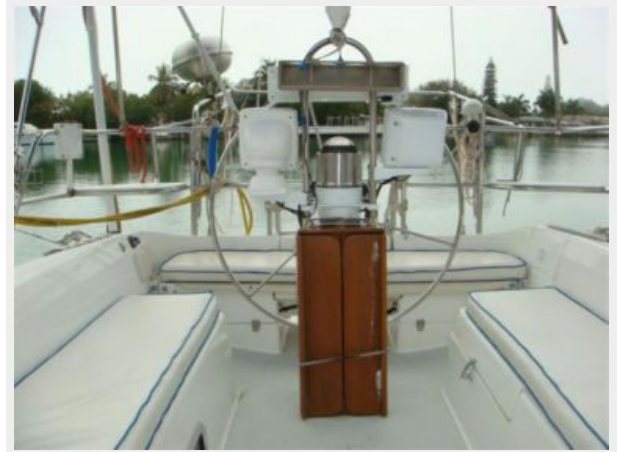
36' Catalina Cockpit Aft