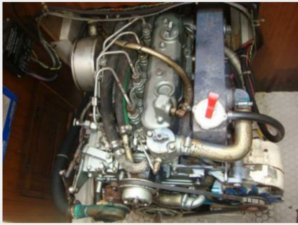
36' Catalina Auxillary