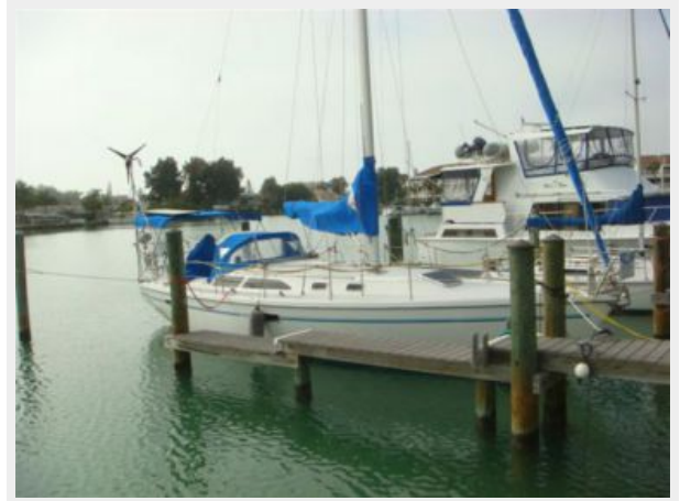
36' Catalina Starboard Forward Profile