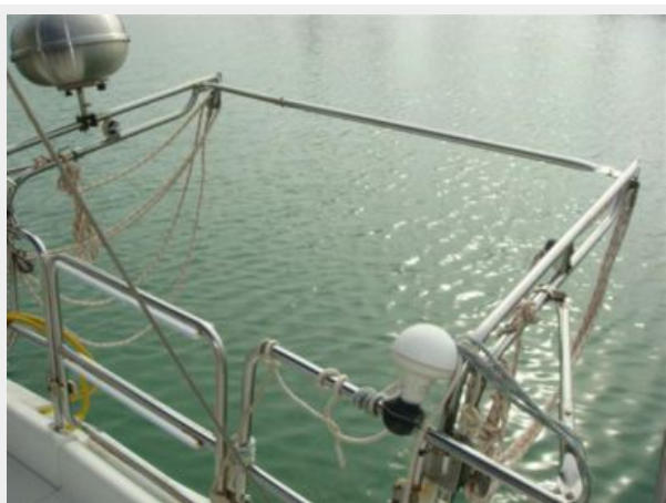
36' Catalina Tender Davits