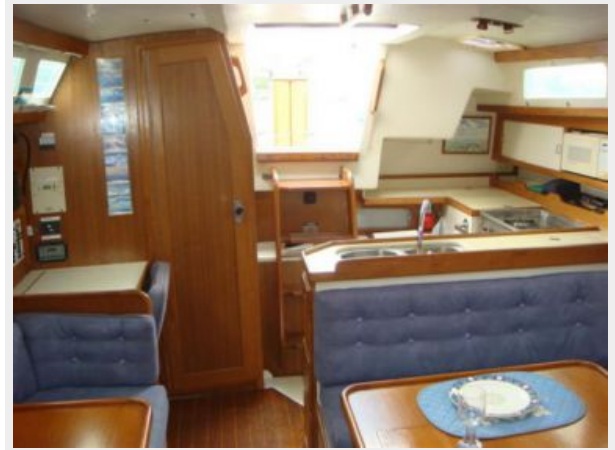
36' Catalina Salon Aft