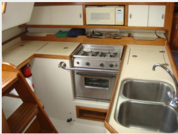
36' Catalina Galley Photo2