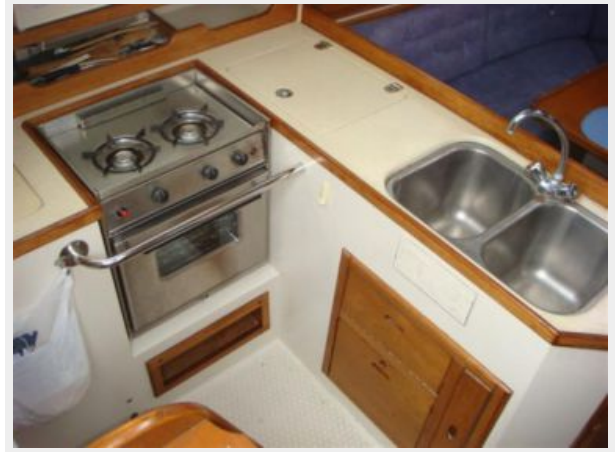
36' Catalina Galley Photo1