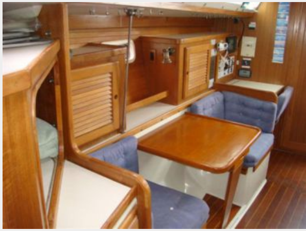
36' Catalina Salon Starboard Photo2