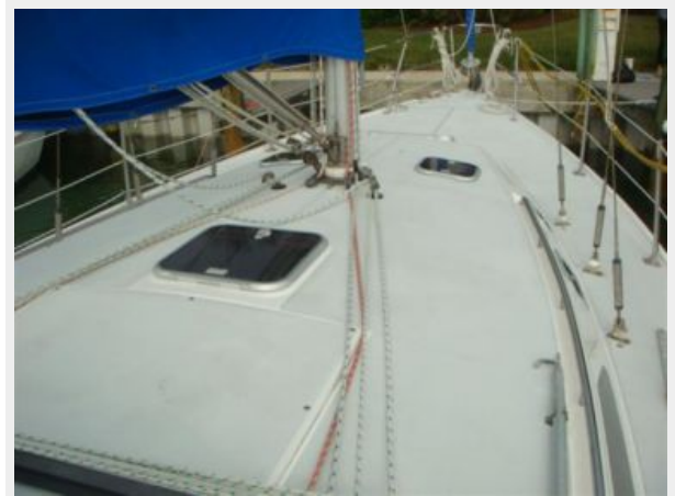
36' Catalina Foredeck