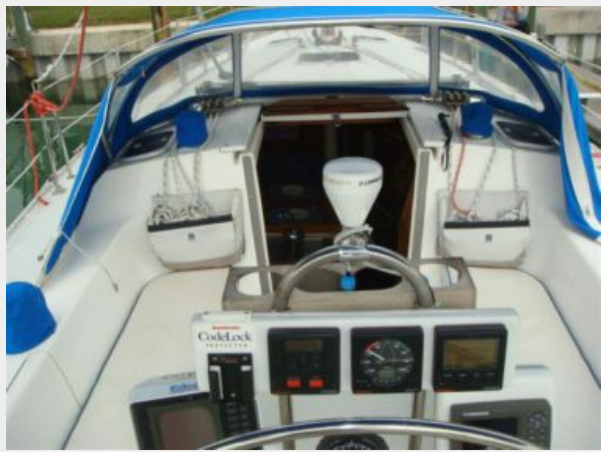
36' Catalina Cockpit Forward