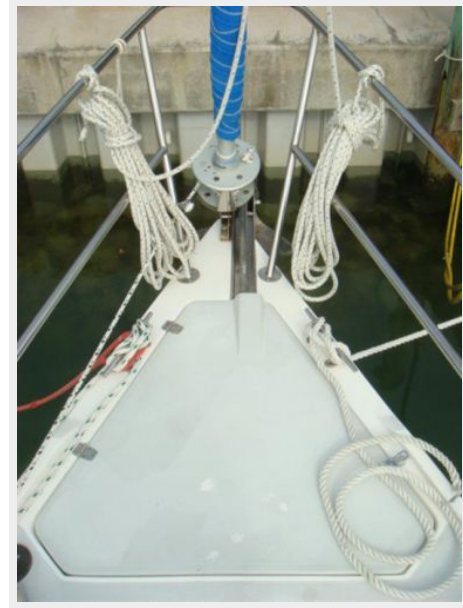
36' Catalina Anchor Windlass Covered