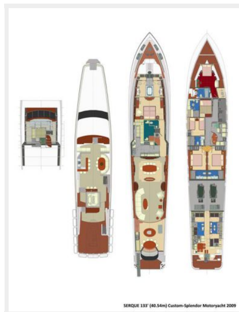
SERQUE 133' (40.54m) Custom-Splendor Motoryacht 2009