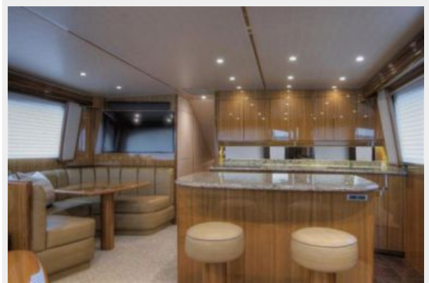
Viking 55 Convertible Galley/Dinette