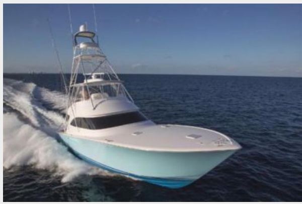
Viking 55 Convertible Running Profile