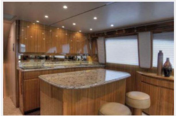
Viking 55 Convertible Galley