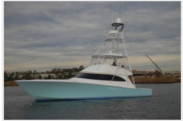
Viking 55 Convertible Profile