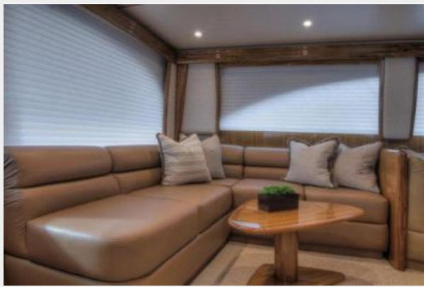
Viking 55 Convertible Salon