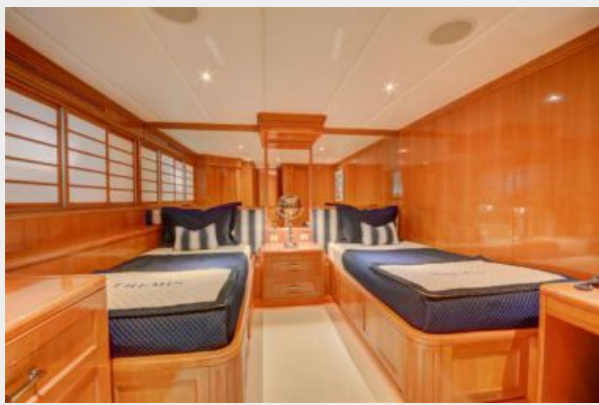
Twin Guest Starboard