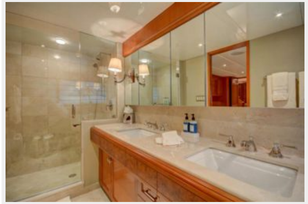
King Guest Bath