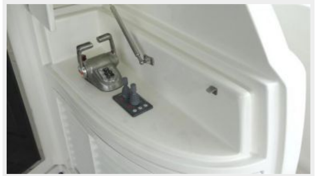
Aft Deck Controls with Thrusters