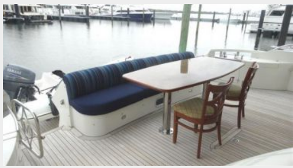
Aft Deck Settee Dining Table