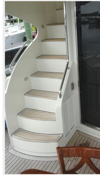
Stairwell to Flybridge