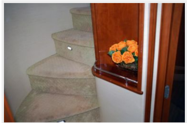
Staircase to Guest Staterooms