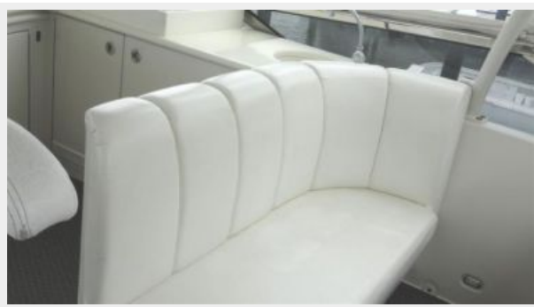
Flybridge Companion Seat