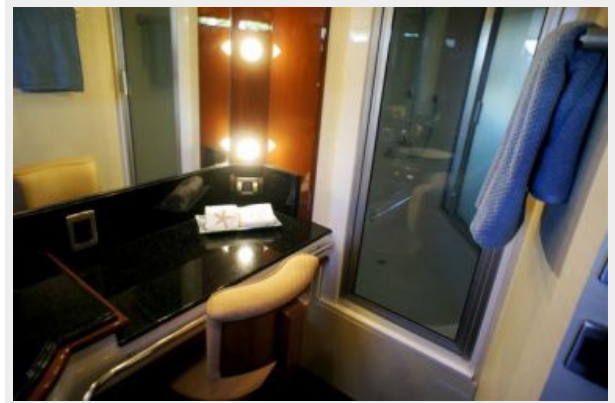
Her Head in Master