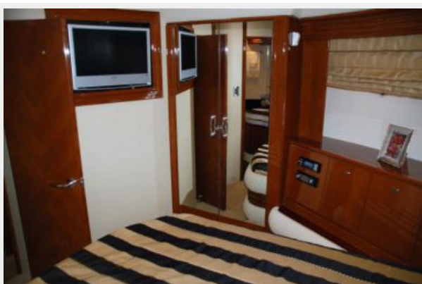
VIP Guest Stateroom