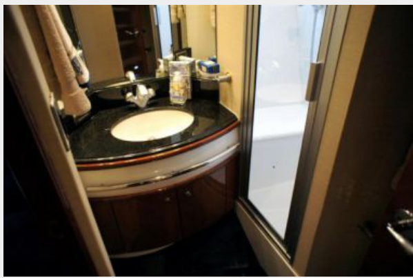
Port Guest Stateroom Head/Dayhead