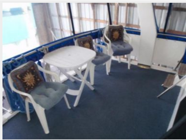
Enclosed Aft Deck