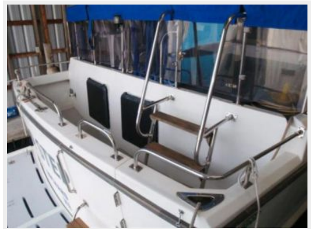
Aft Cockpit Starboard