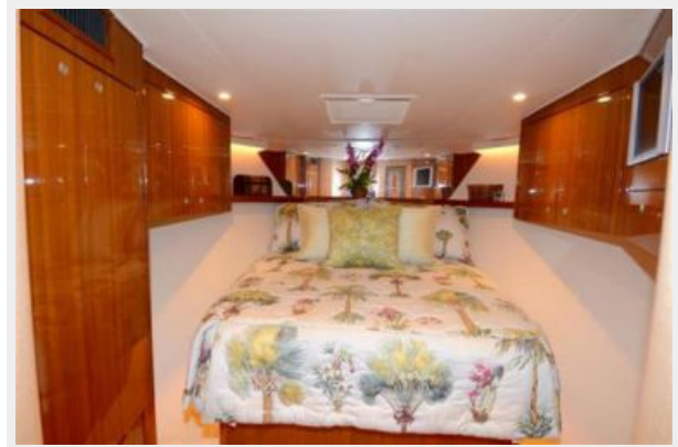
Forward Guest Stateroom