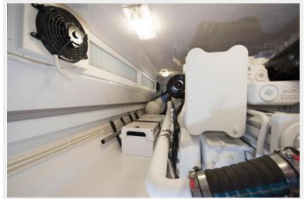
Engine Room Starboard Outboard