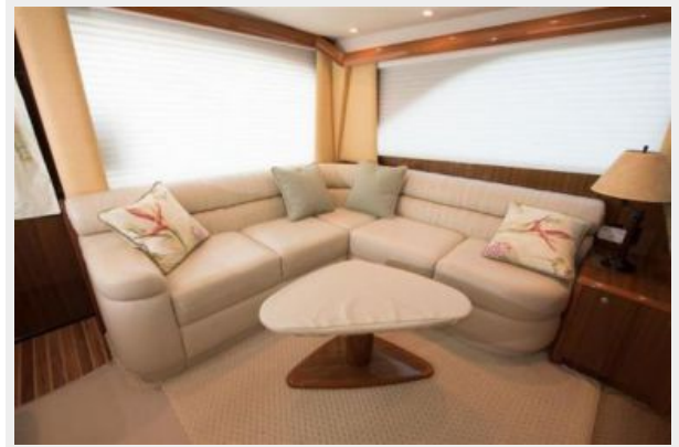
Salon Table Cover