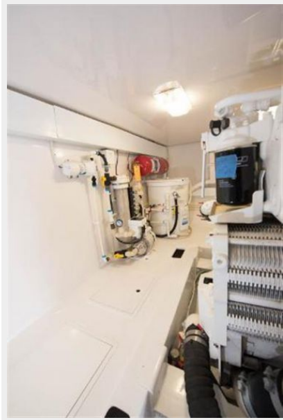
ENgine Room Starboard