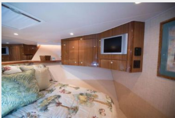
Forward Stateroom Starboard