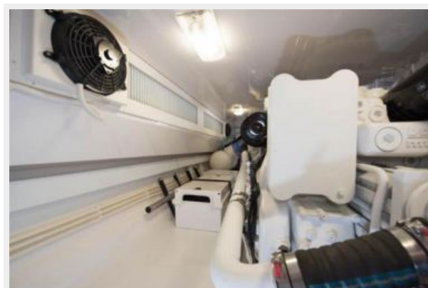
Engine Room Starboard Outboard